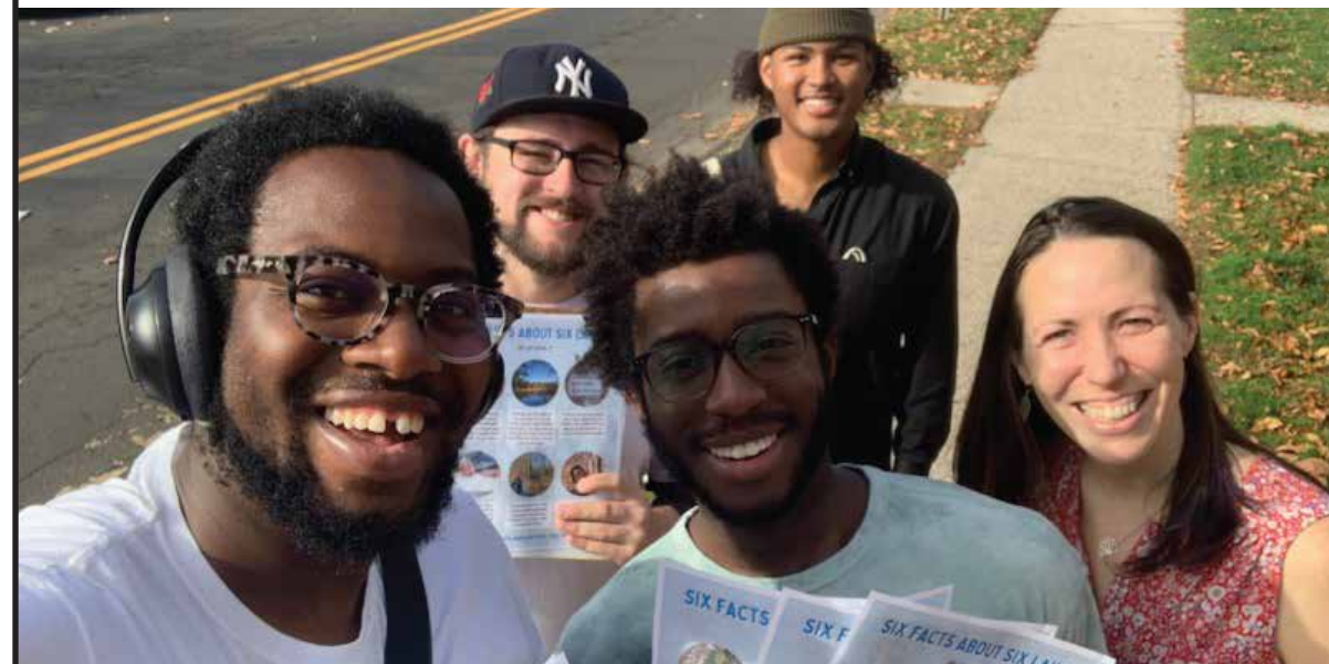
Photo Credits: Cover: Steve Hamm, courtesy of Mill River Watershed Association Page 3: Google maps Page 4: Visioning session images by Killian Duborg for Save the Sound Page 6: Juvenile hawk by Steve Hamm, courtesy of Mill River Watershed Association Page 7: Six Lakes landscape courtesy of Save the Sound; canvassing photo by Justin Farmer