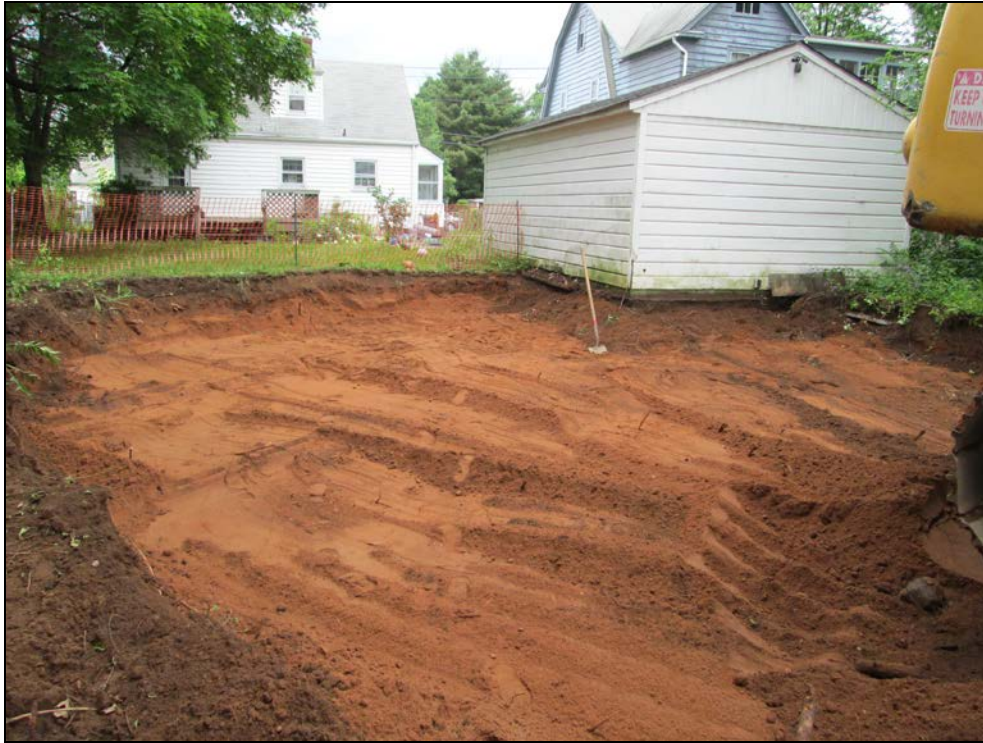
View looking east at extent of excavation.