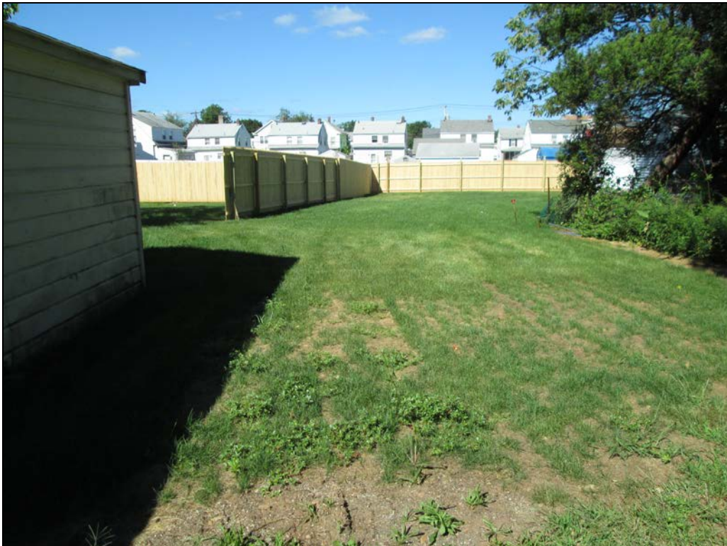
View looking west at restored back yard.