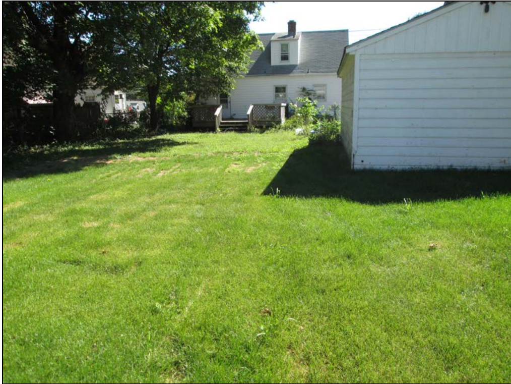
View looking east at restored back yard.