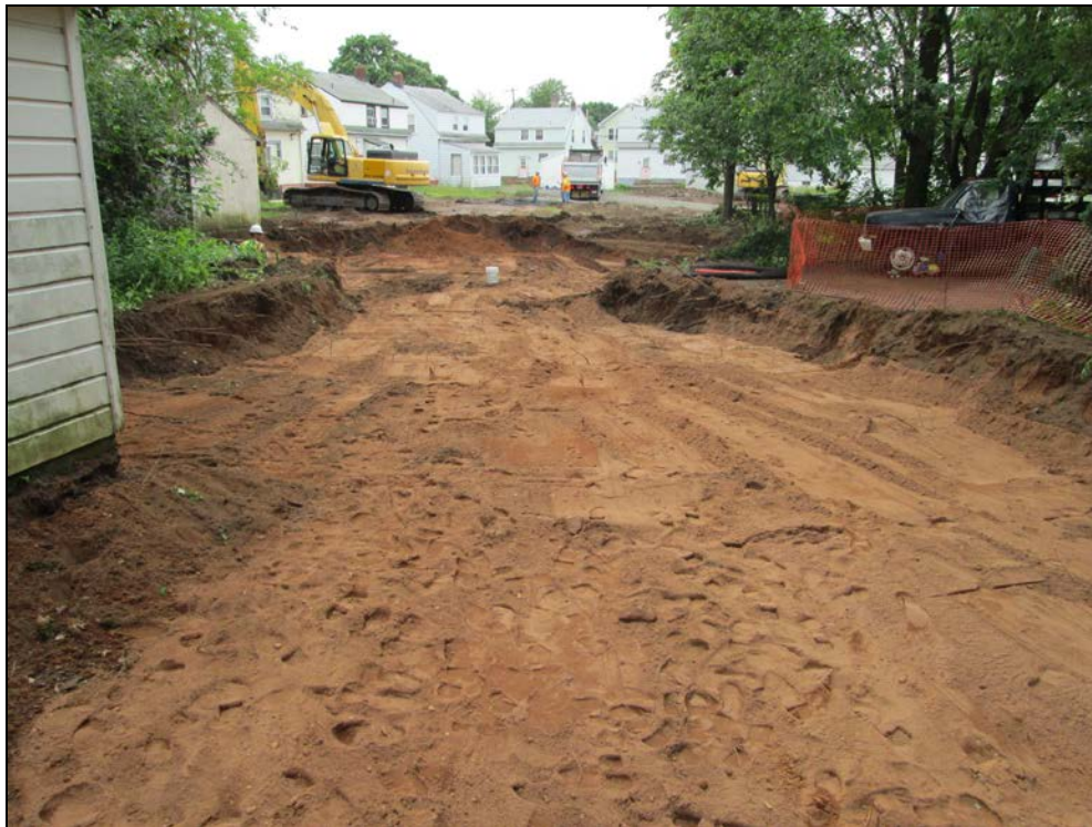
View looking west at excavated back yard.