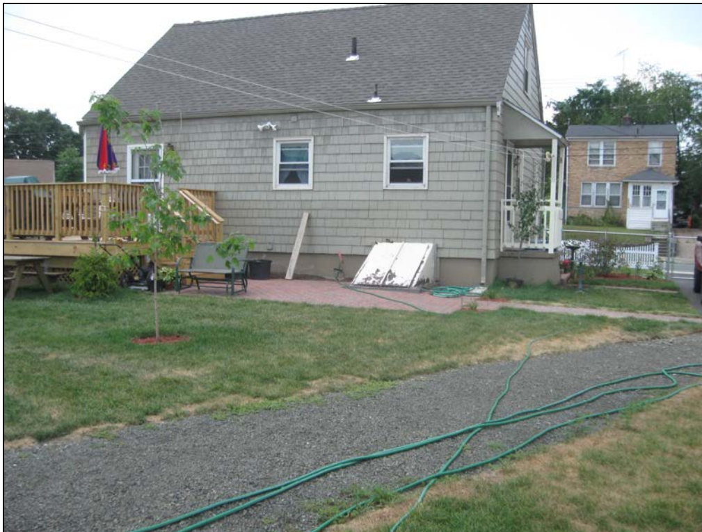
View looking west at restored back yard.