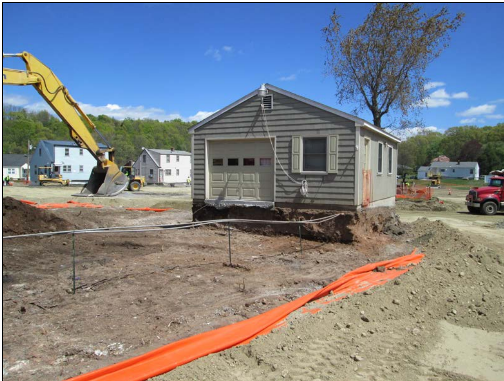
View looking east at excavated back yard.