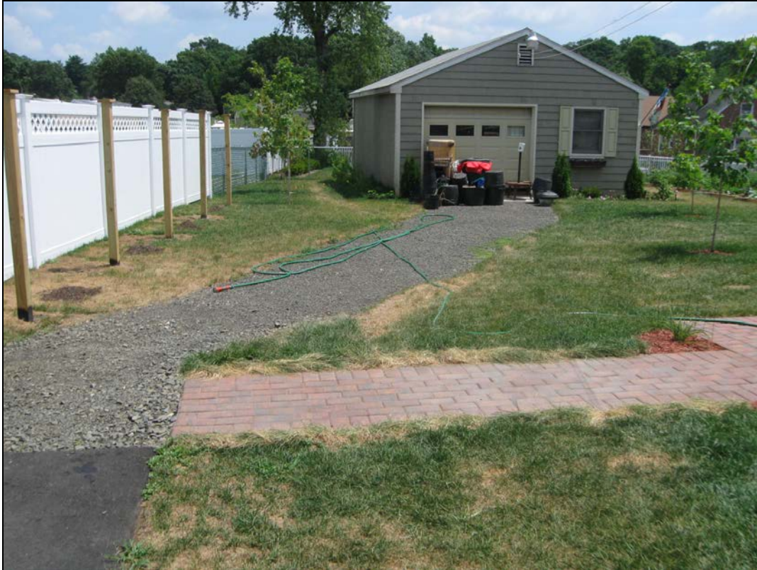
View looking east at restored back yard.