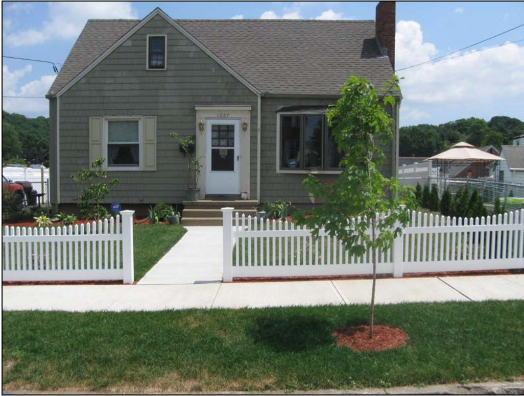
View looking east at restored front yard.