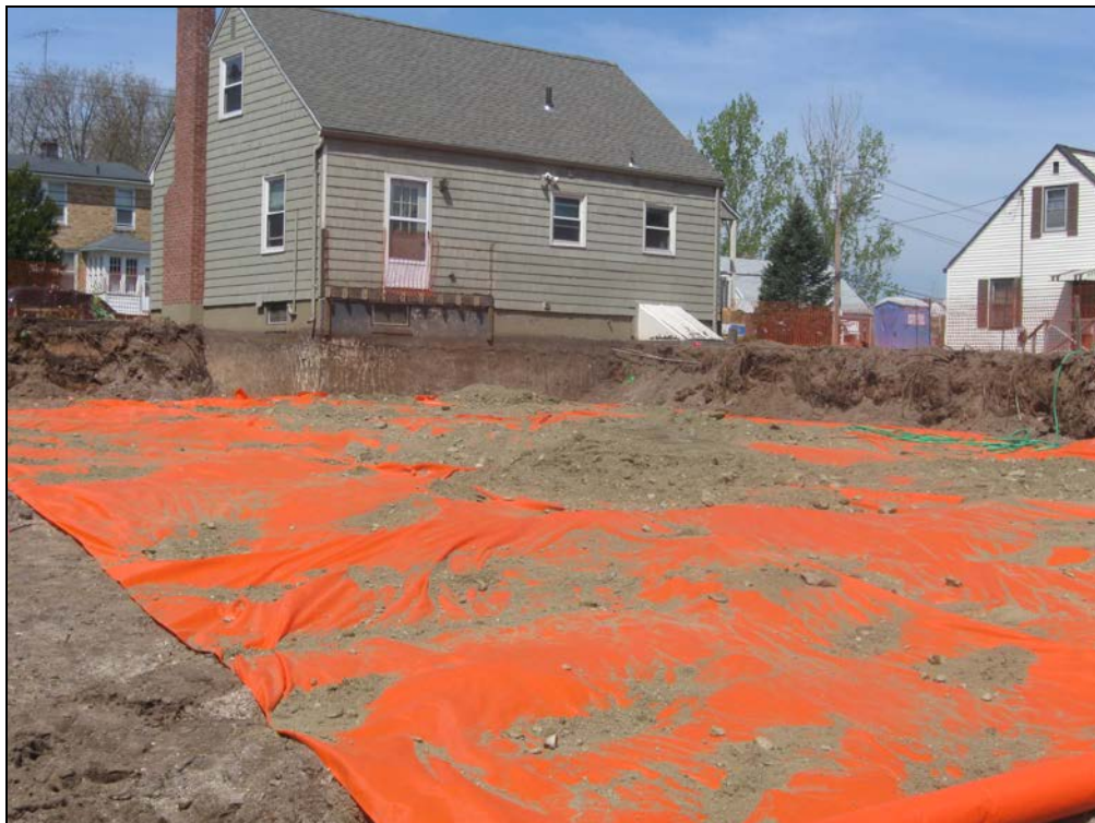
View looking northwest at excavated back yard.