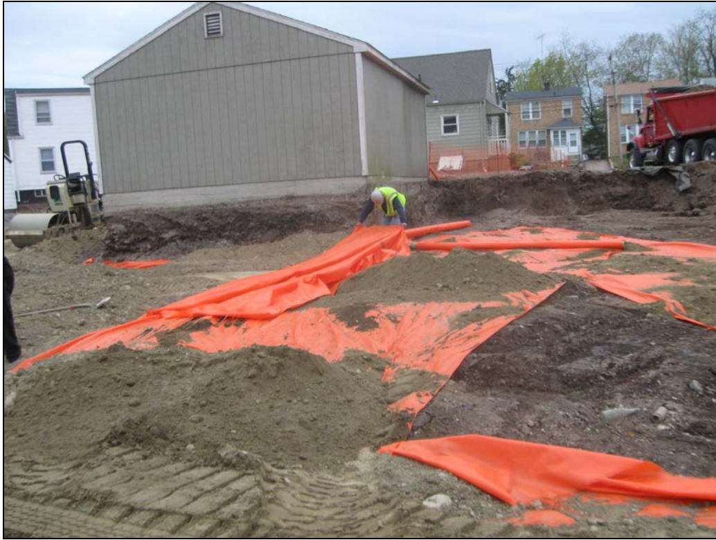
View looking west at marker barrier being installed around garage.