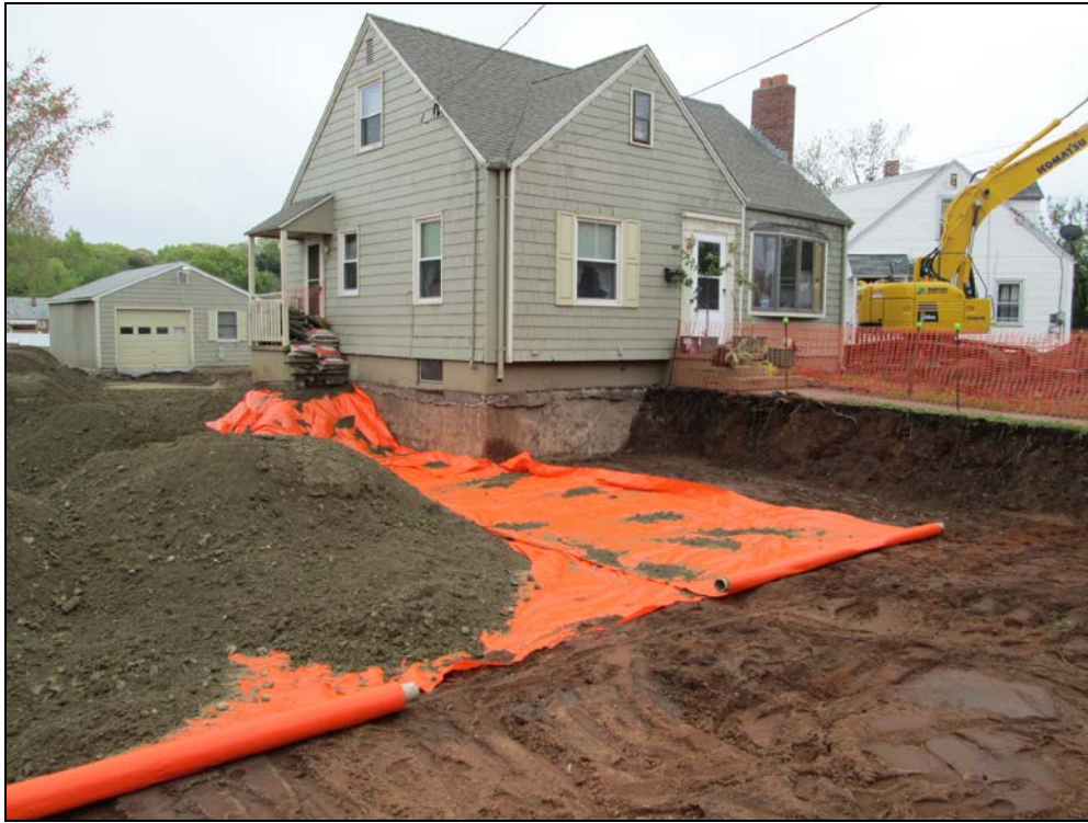
View facing southeast at excavated front yard with marker barrier being installed.