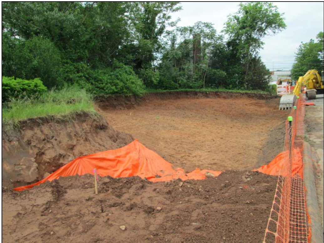
View looking west at excavated side yard along Newbury Street.