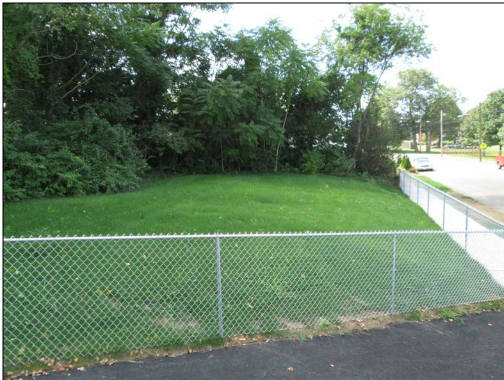
View looking west at restored side yard along Newbury Street.