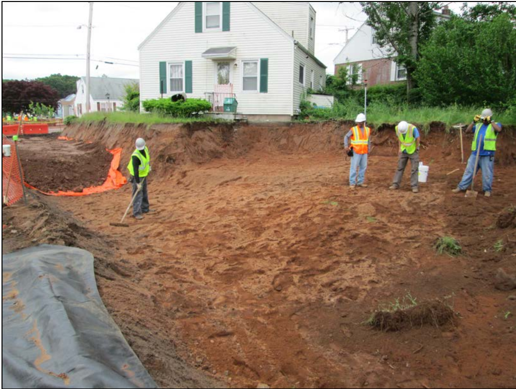
View looking southeast at excavated side yard following removal of UST.