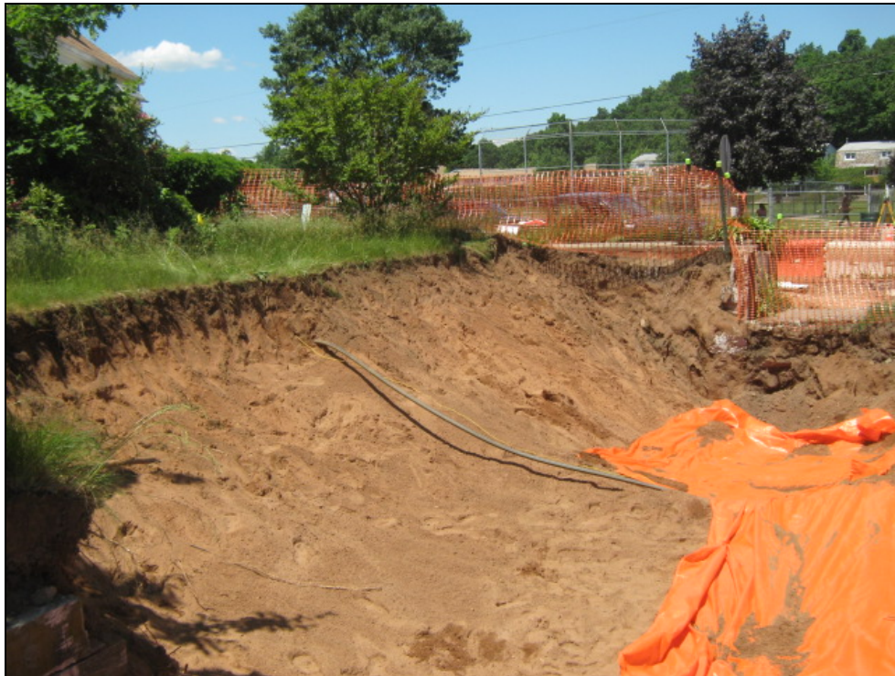
View looking north at excavation along Winchester Avenue.