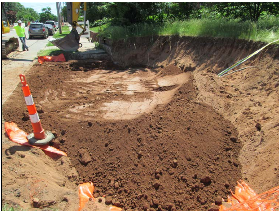
View looking south at excavation along Winchester Avenue.