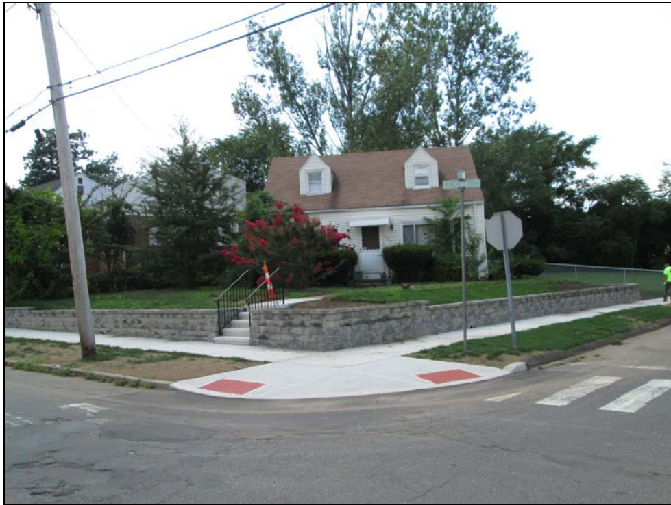
View looking southwest at restored property.