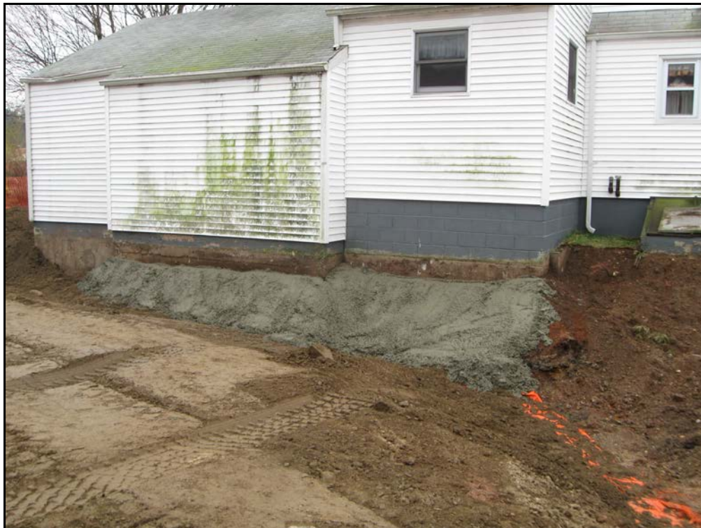
View looking south at partially backfilled back yard showing marker barrier over fill material left in place.