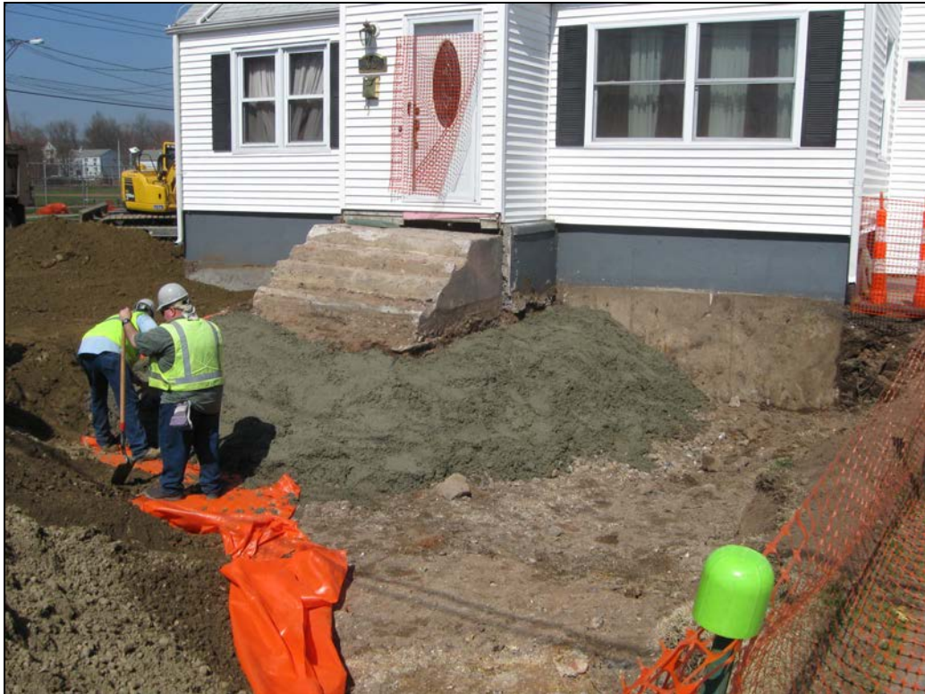
View looking north at excavation of front yard with concrete along the front stairs.