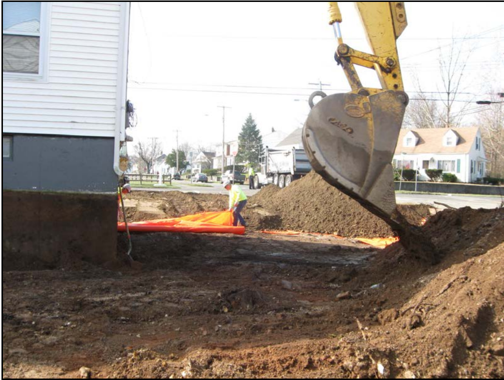
View looking south at marker barrier being installed in the excavated side yard.