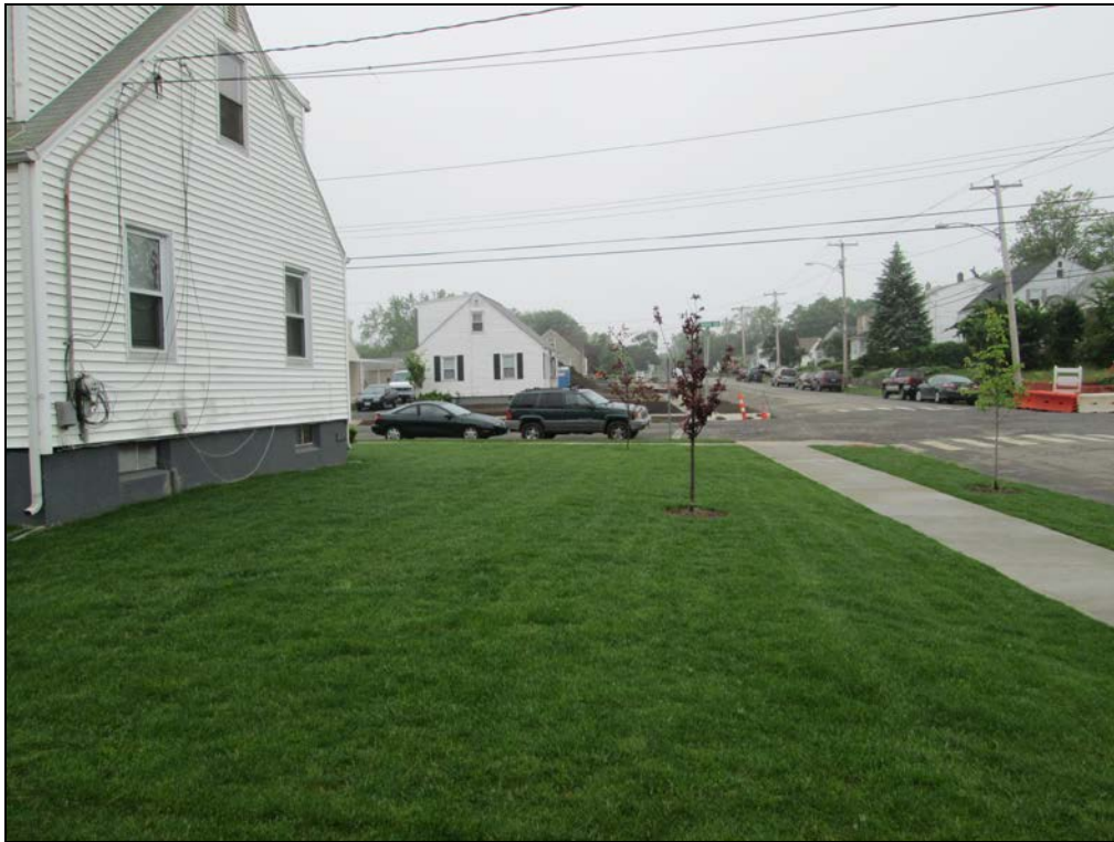
View looking south at restored side yard.