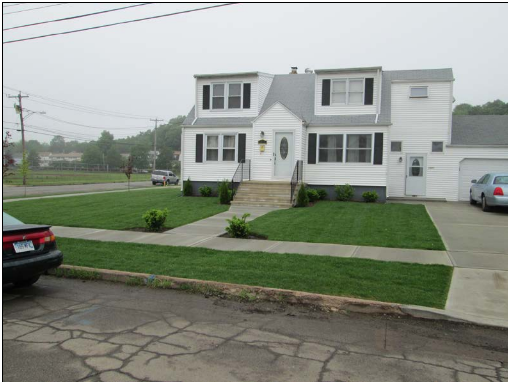
View looking north at restored front yard.