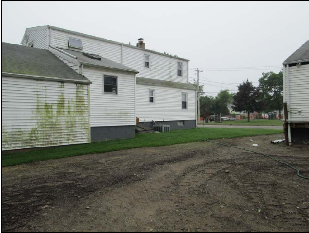
View looking southwest at restored grass in back yard.