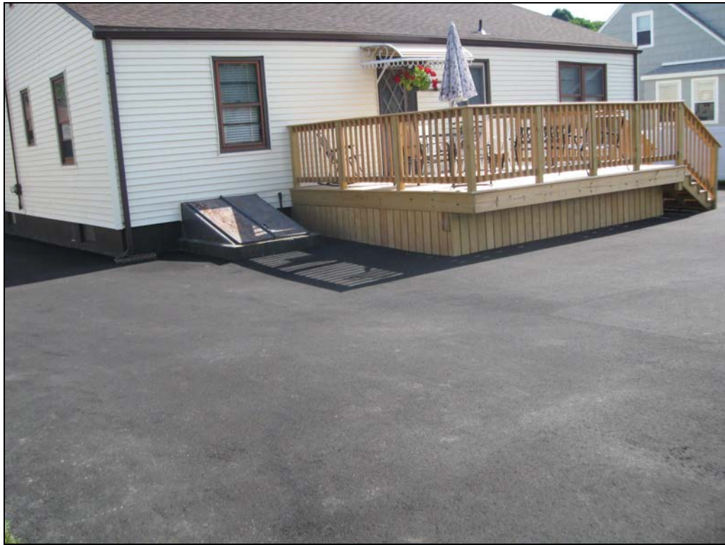
View looking northeast at restored back deck and parking area.