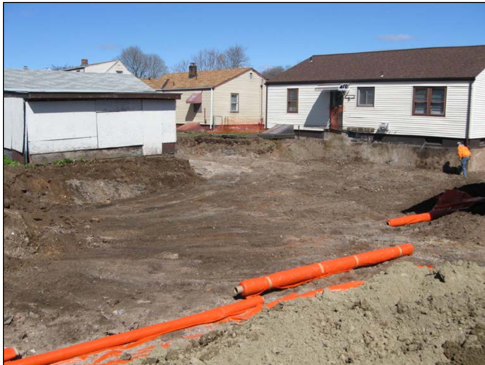
View looking northwest at excavated back yard.