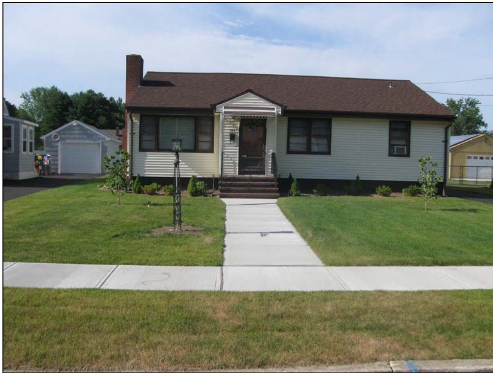
View looking south at restored front yard.