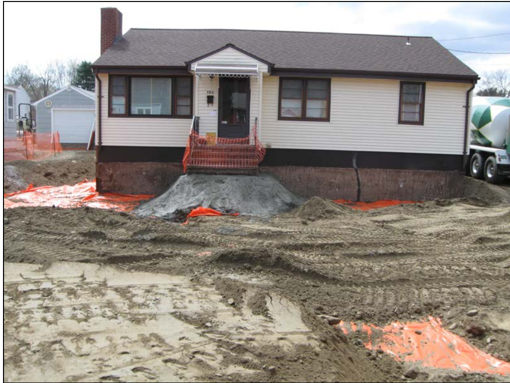
View facing south at excavated front yard.