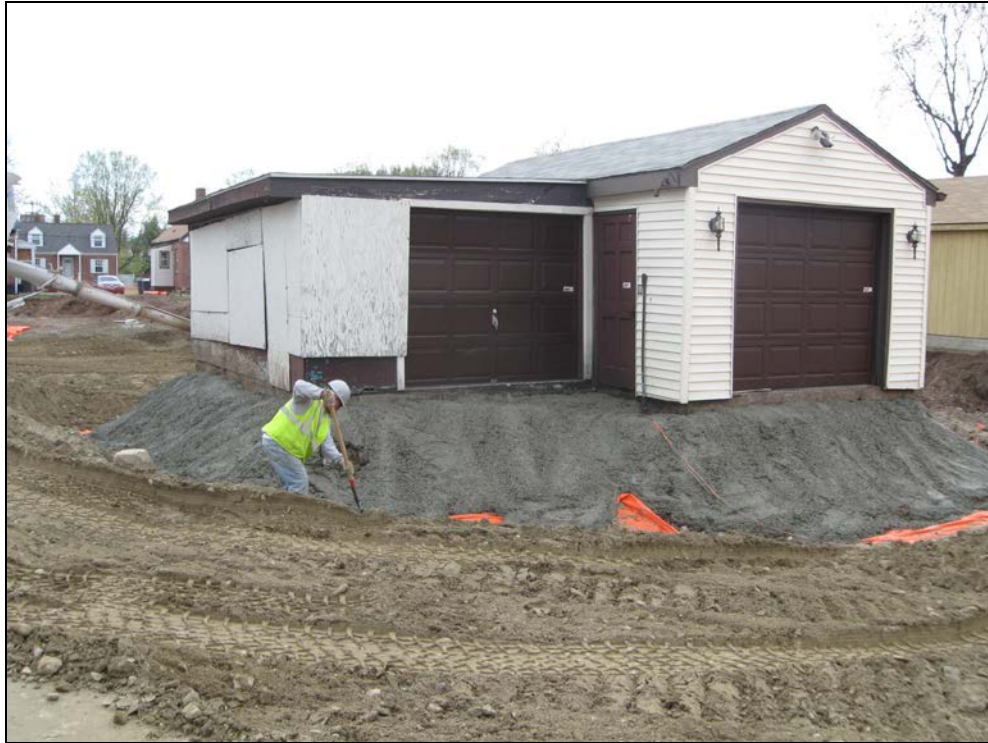
View looking south at concrete marker barrier being installed over remaining fill.