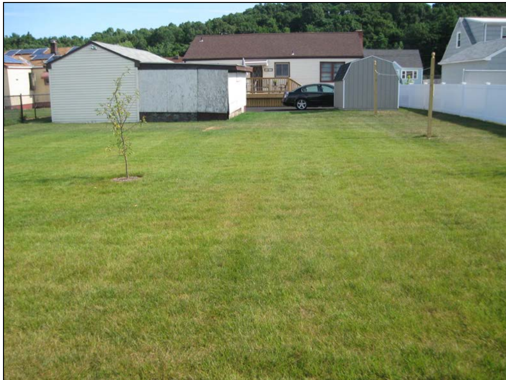
View looking north at restored back yard.