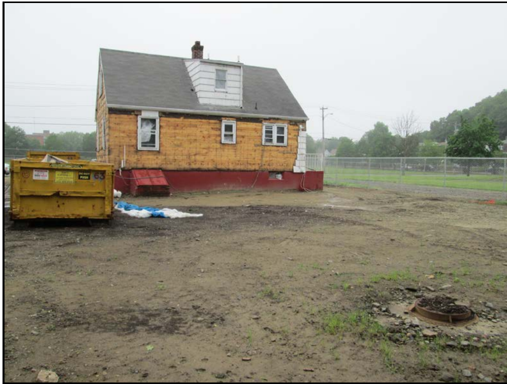
View looking west at backfilled back yard and new drywell.