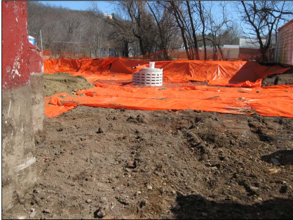
View looking east at new drywell and marker barrier being placed at excavation limits.