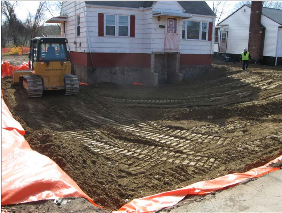
View looking east at partially backfilled front yard with marker barrier at limits of excavation.