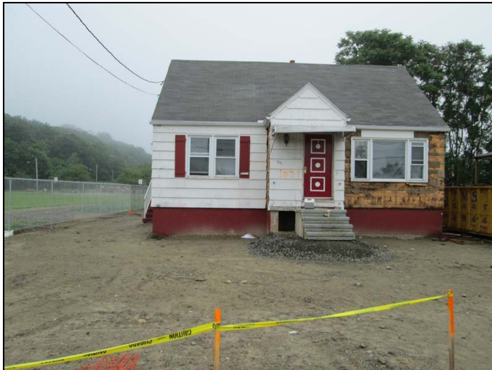
View looking east at backfilled front yard.