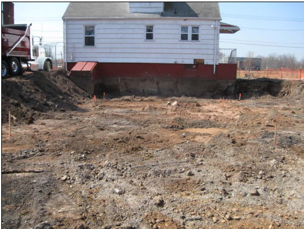
View looking west at excavated back yard prior to marker barrier being placed at the base.