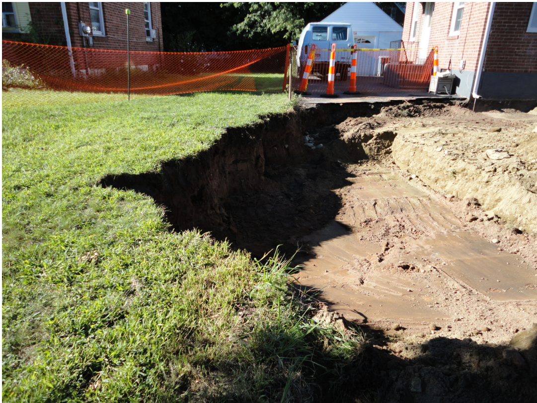
View looking south at the extent of excavation on 108 Morse Street.