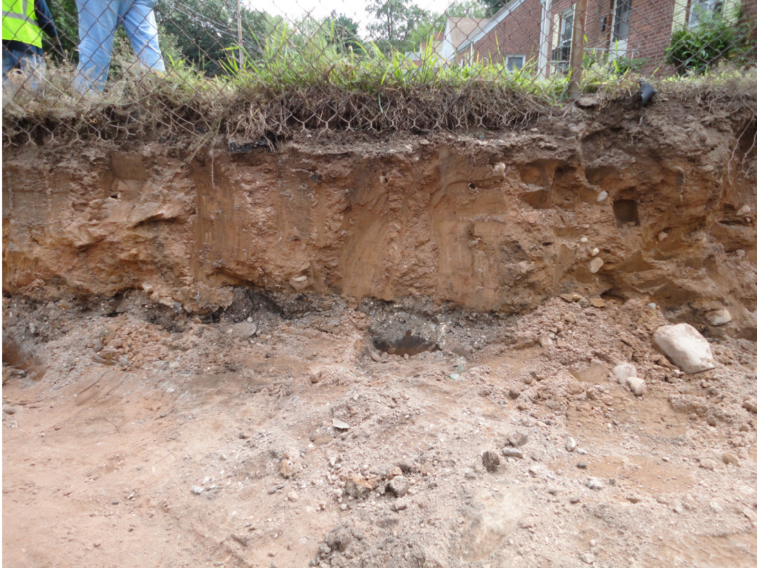
Looking east from adjacent property, view of thin lens of soil extending onto 108 Morse Street.