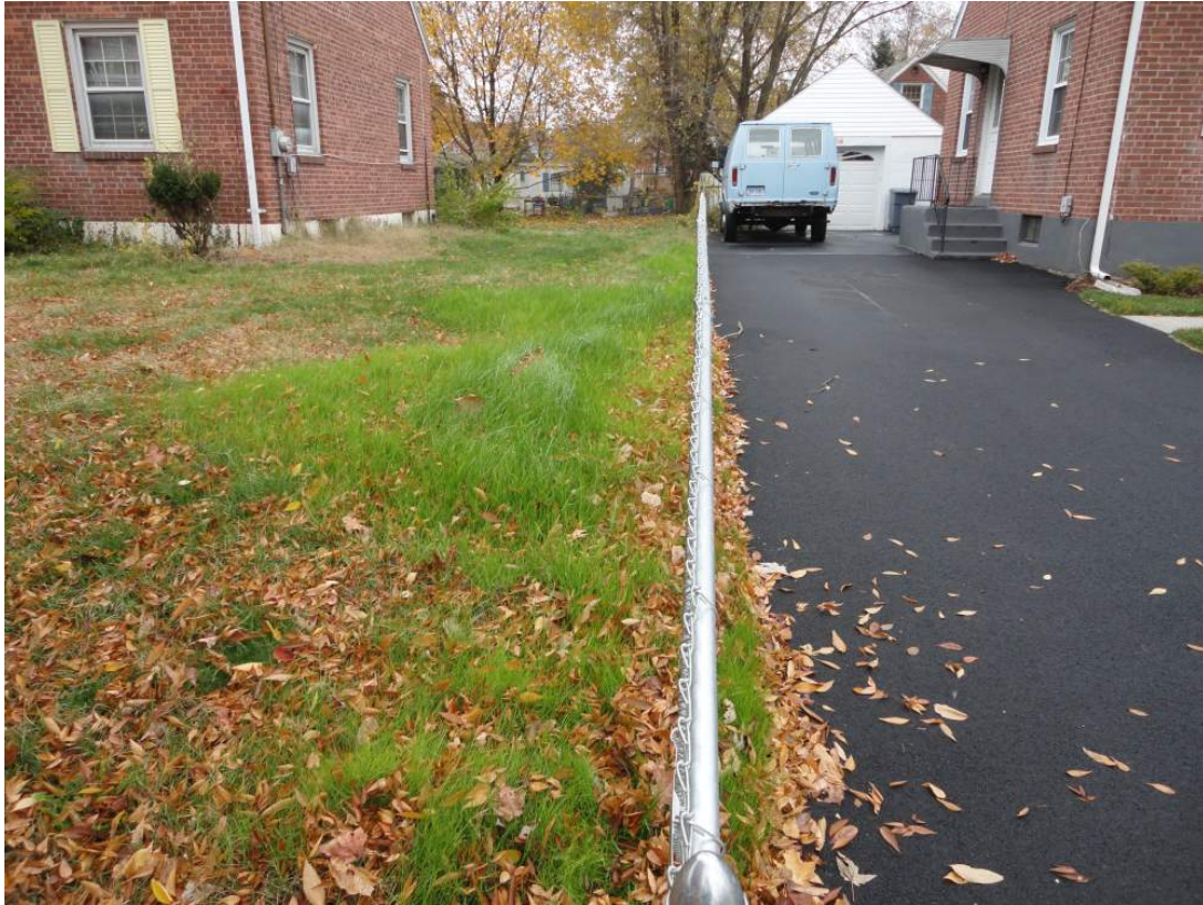
View looking south following restoration of 108 Morse and adjacent property.