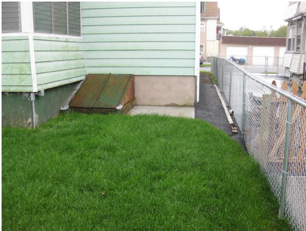
View looking South at restored back yard