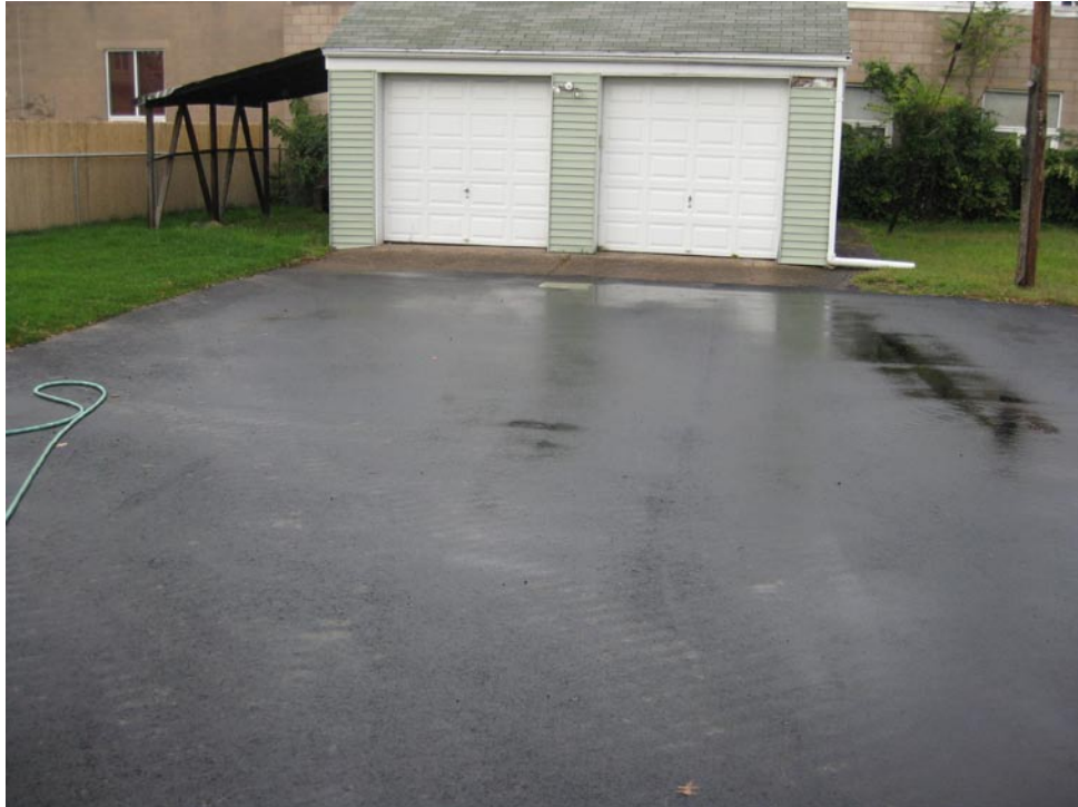
View looking North at restored driveway