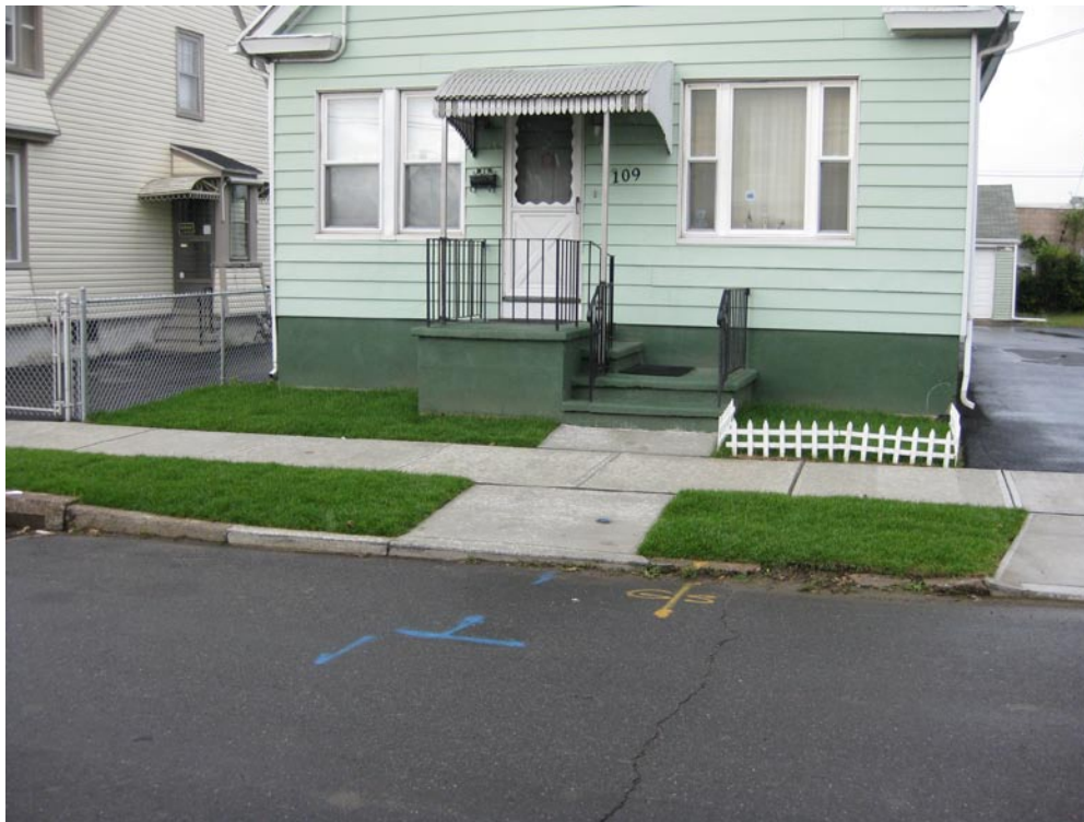
View looking North at restored front yard