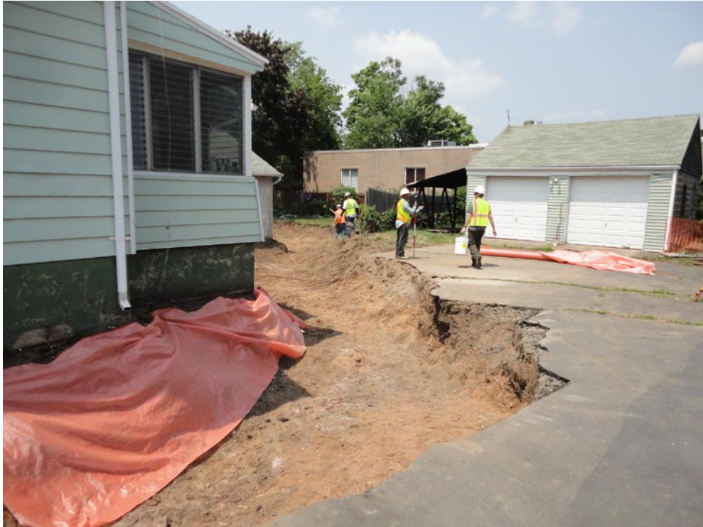
View looking Northwest at excavation area