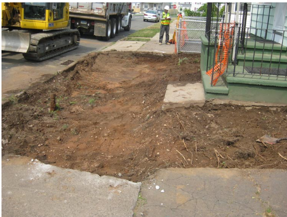
View looking West at excavation of front yard