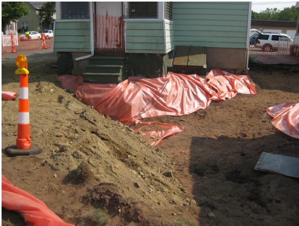
View looking South at excavation in back yard following placement of marker barrier