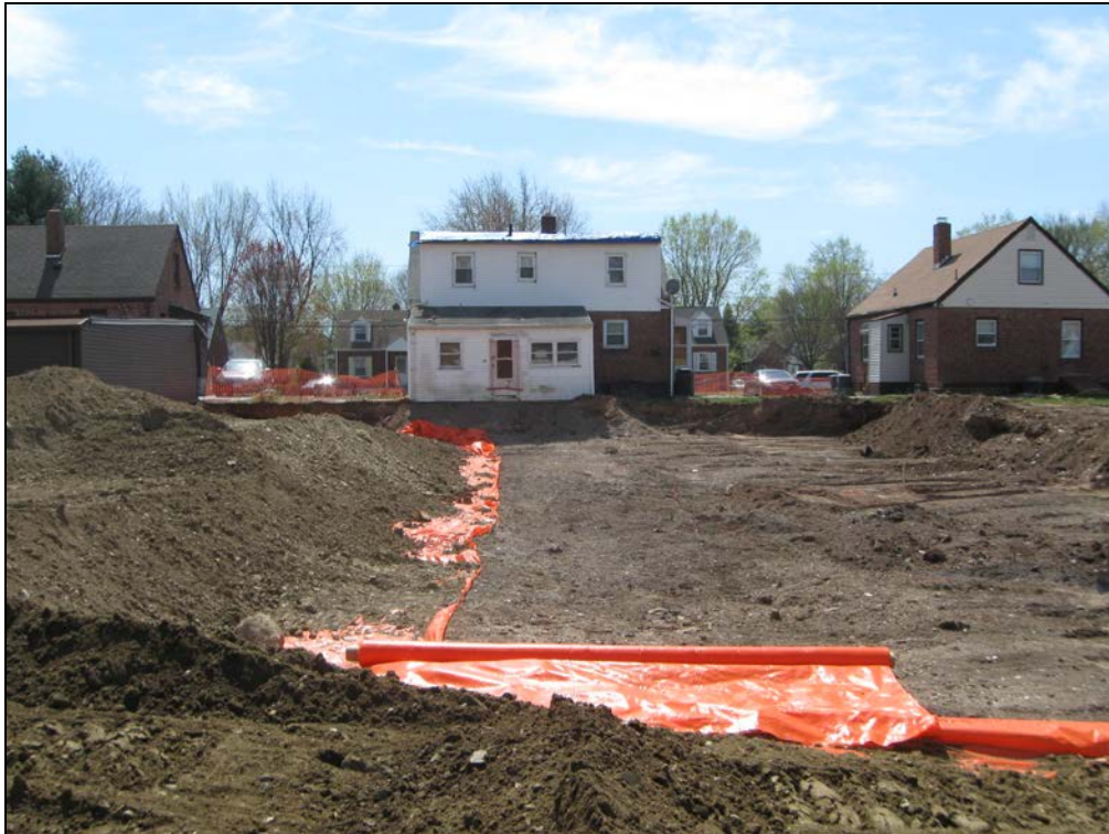
View looking south at partially backfilled back yard.