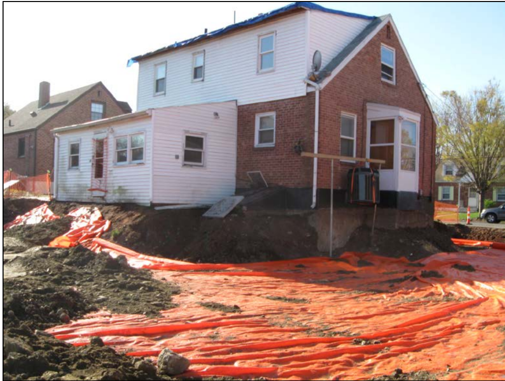
View looking southeast of at excavated back and side yard.