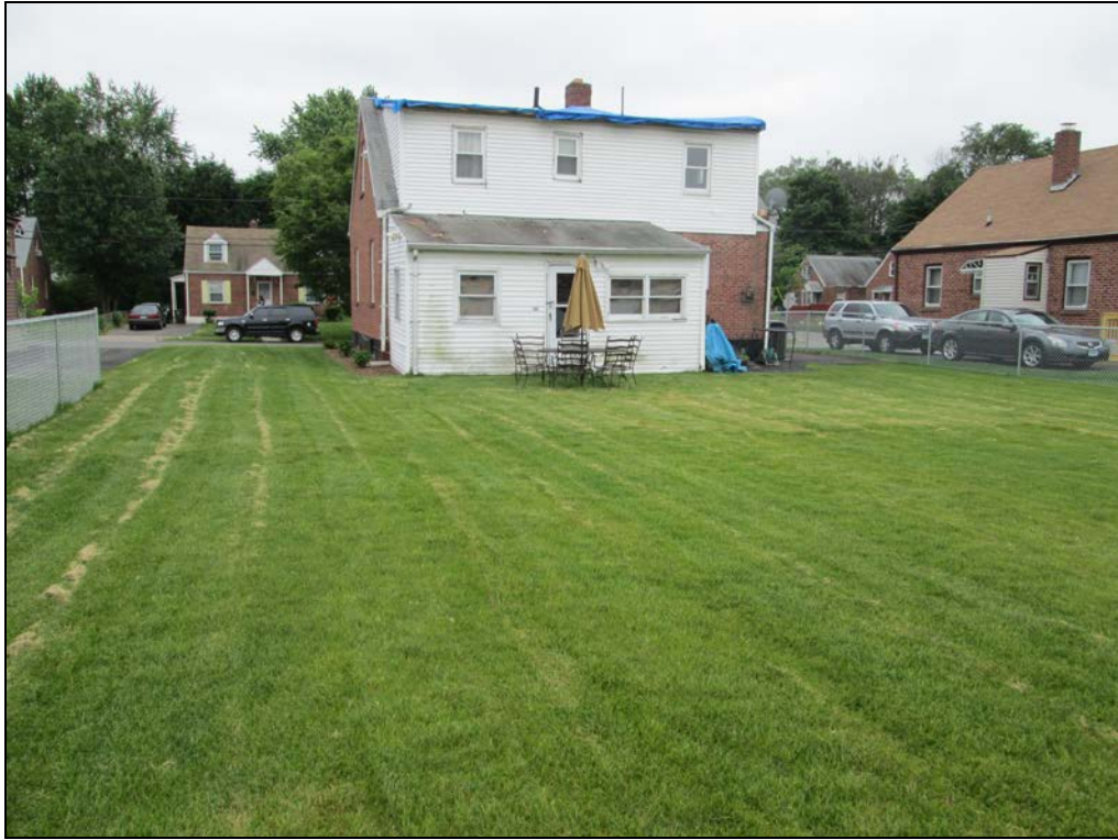
View looking south at restored back yard.