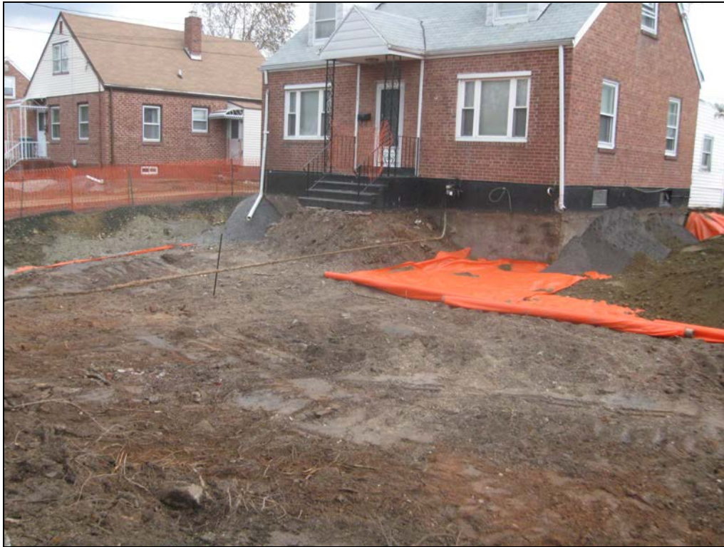
View facing northwest at marker barrier being installed in the front yard.