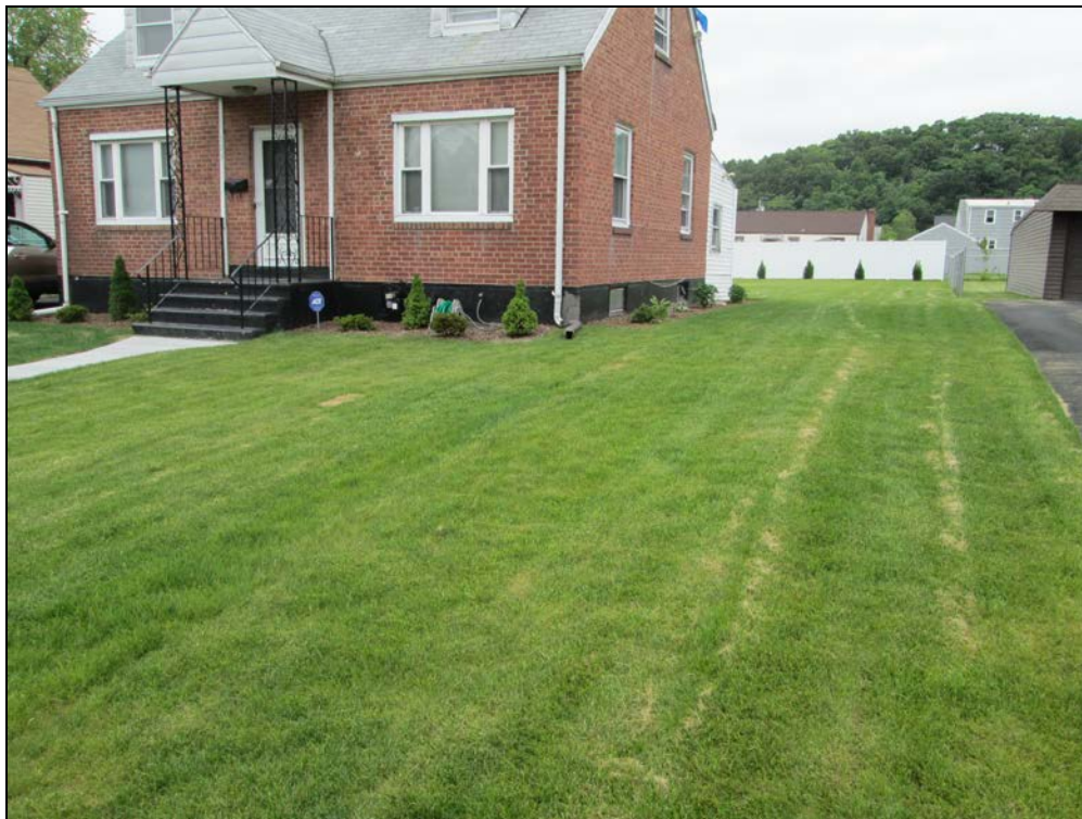
View looking northwest at restored front and side yard.