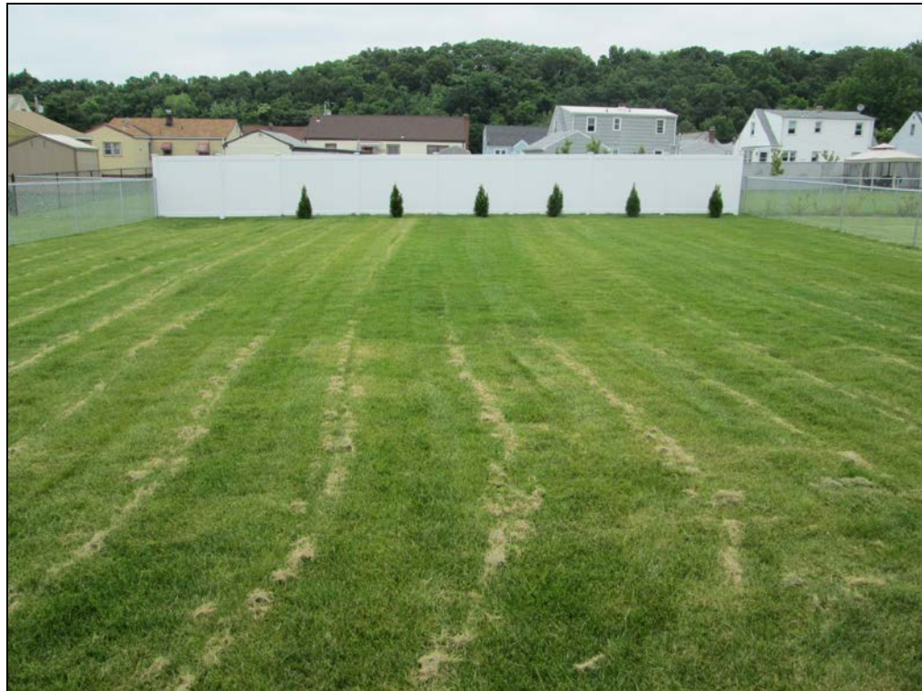
View looking north at restored back yard.