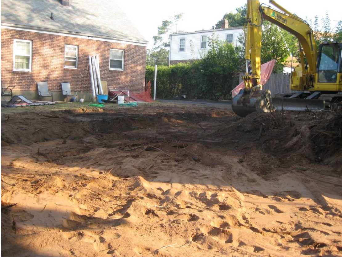
View looking southeast at excavation area in backyard.