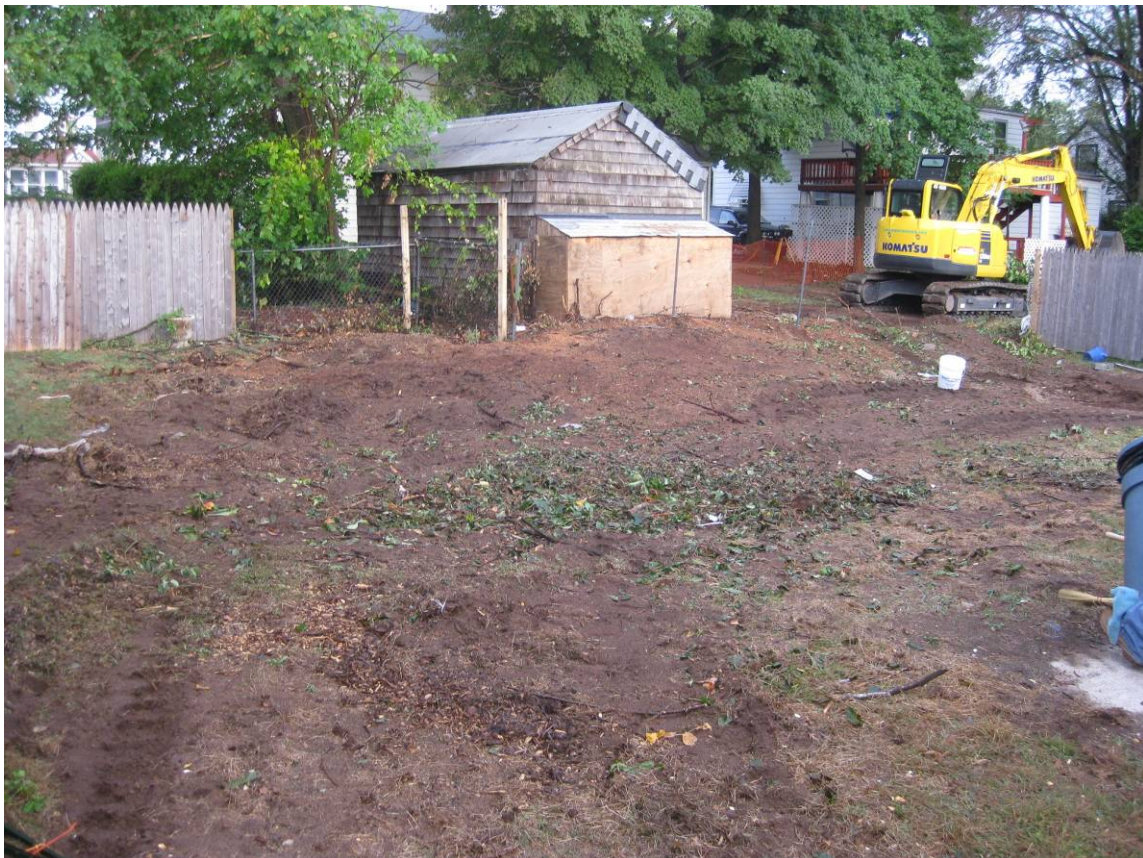
View looking northwest at excavation extending to back property line.