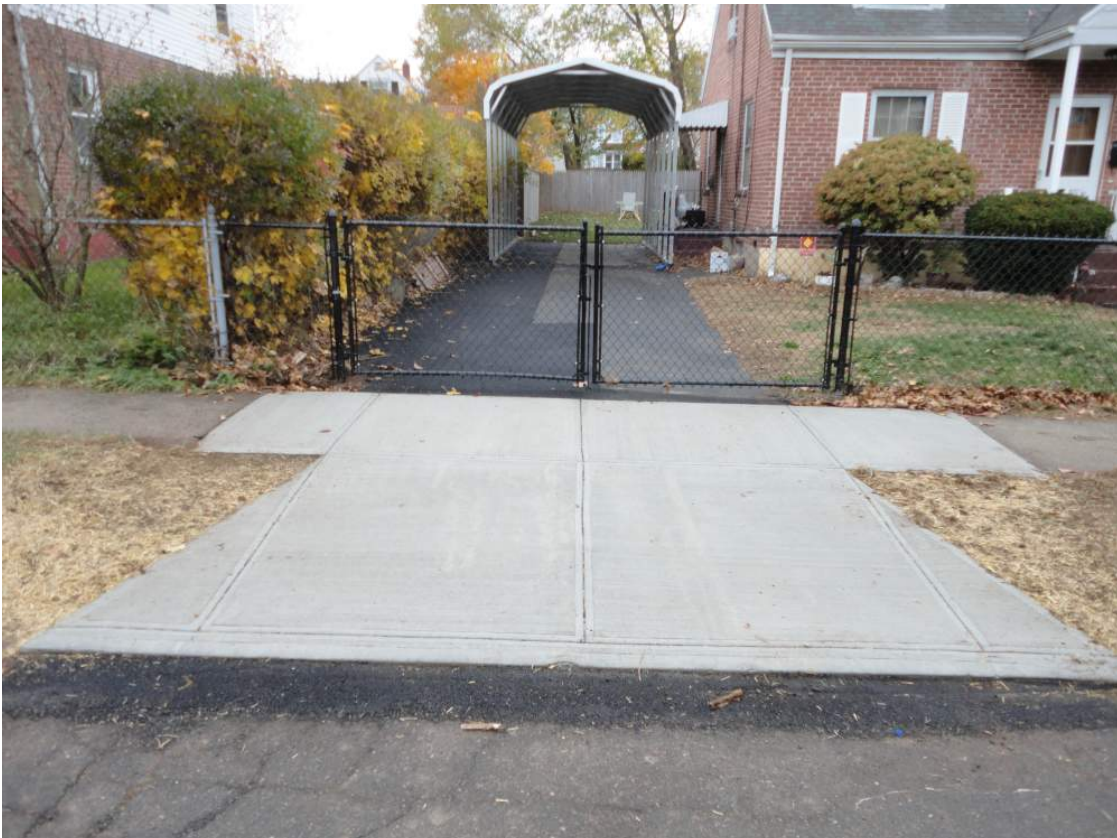
View looking west from North Sheffield Street at restored driveway and new carport.