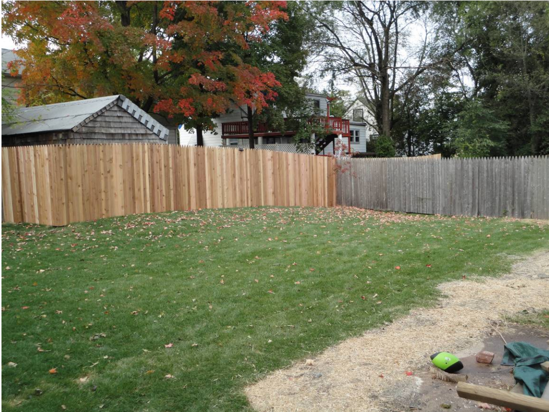
View looking northeast at restored backyard.