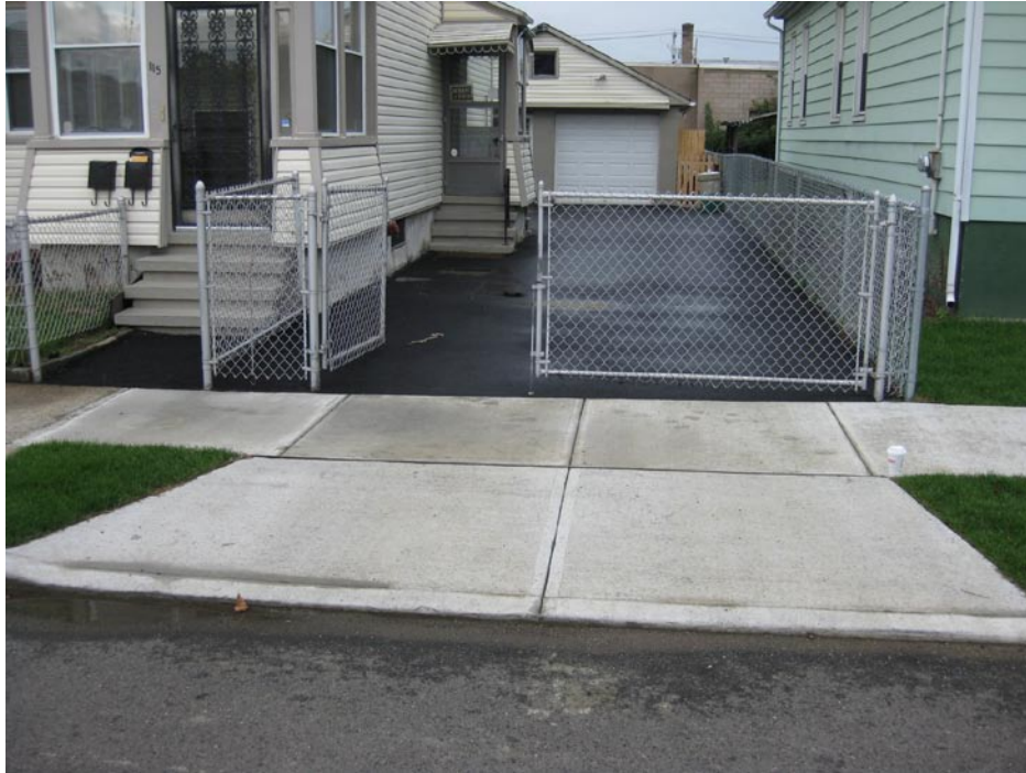
View looking North at restored driveway and sidewalk