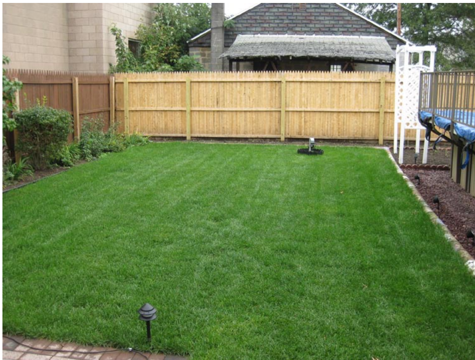
View looking East at partially restored lawn and fencing