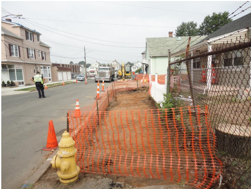
View looking West at excavation area in front yard