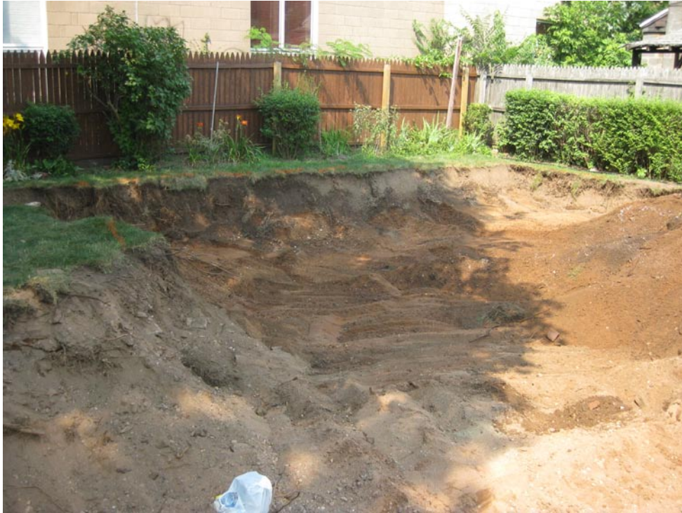
View looking Northwest at excavation area in back yard