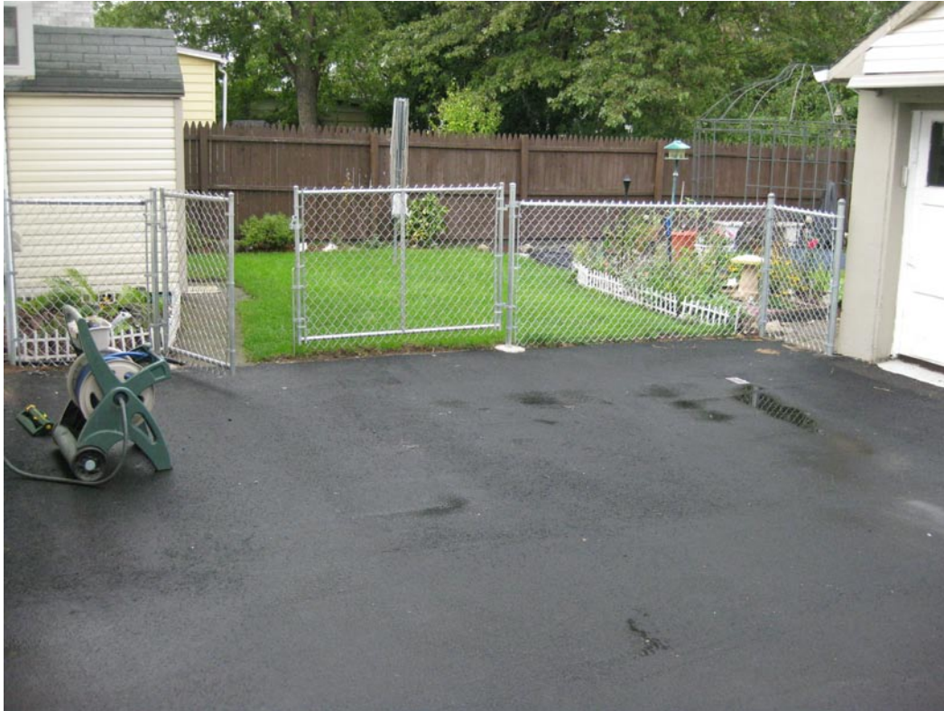
View looking West at restored driveway and landscape areas