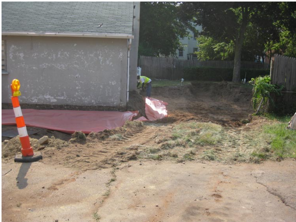
View looking East at excavation of back yard