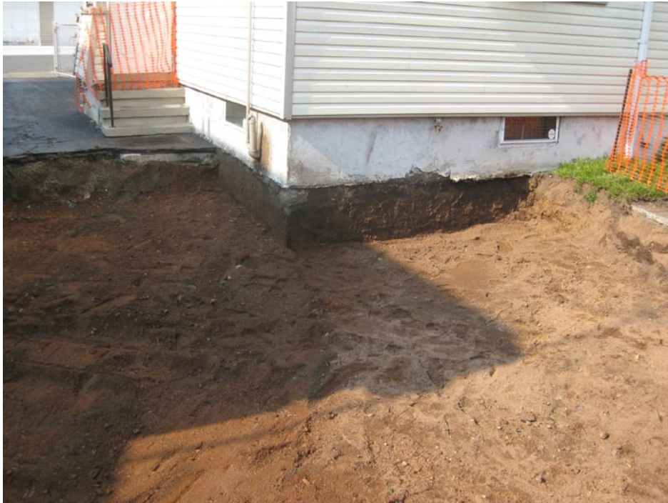
View looking Southwest at excavation behind house and in driveway