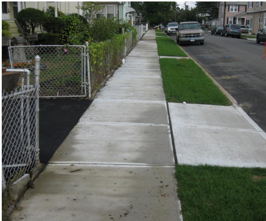
View looking East at restored sidewalk