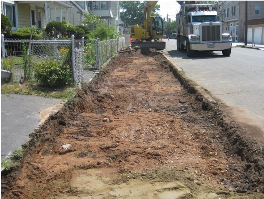
View looking East at excavation area in front sidewalk