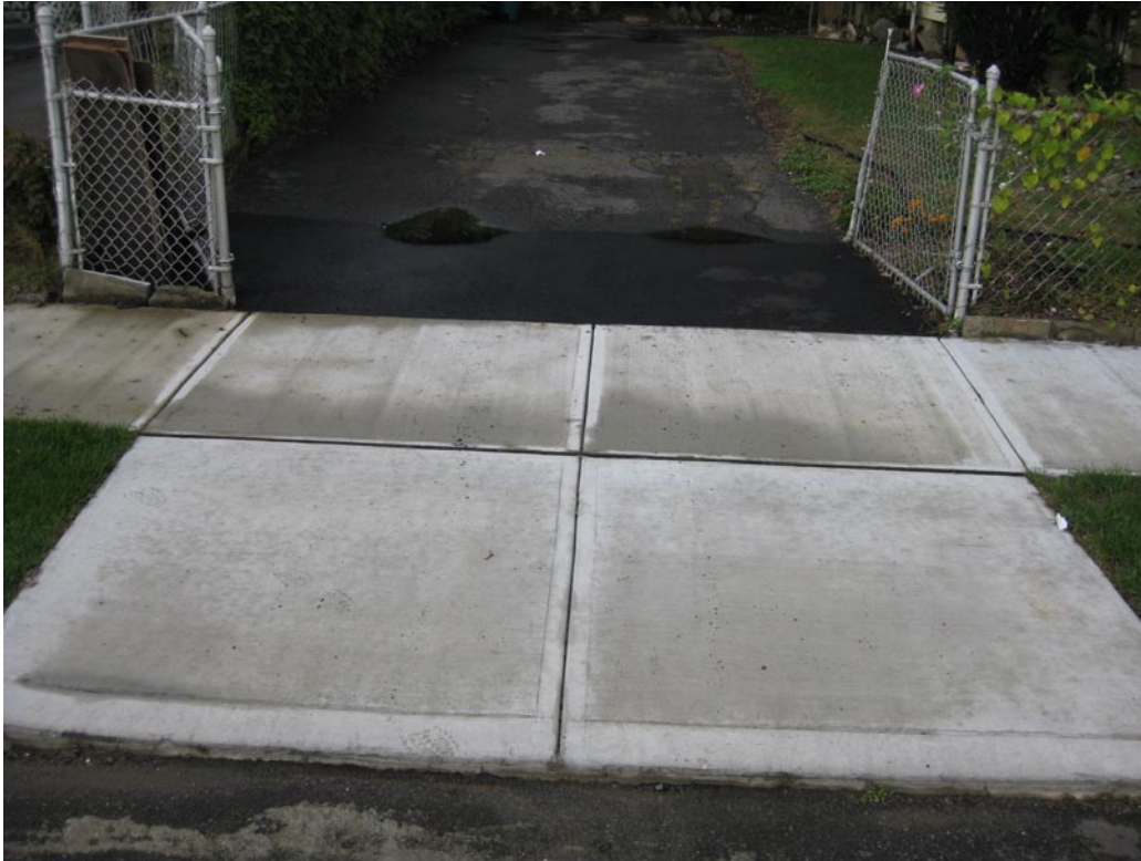
View looking North at restored driveway apron