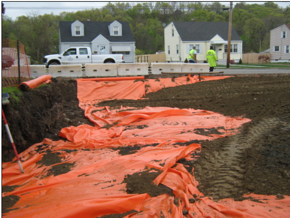
View looking north at excavated front yard towards Bryden Terrace.