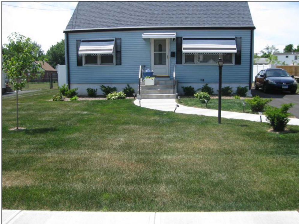
View looking south at restored front yard.