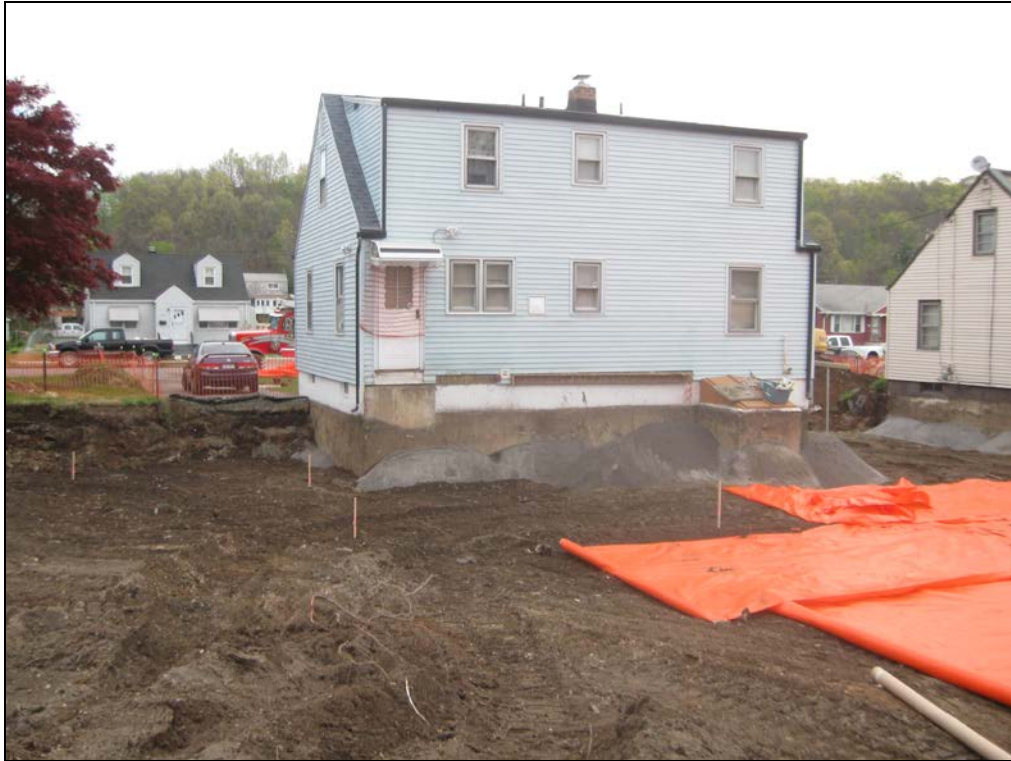
View looking north at excavated back yard.