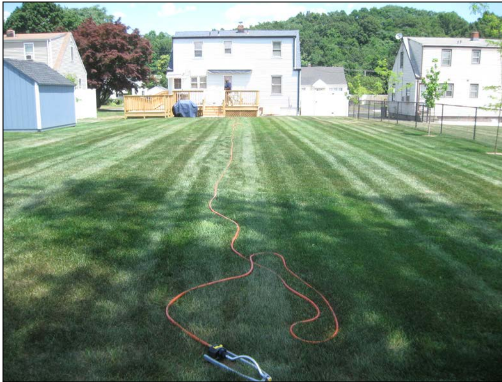
View looking north at restored back yard.