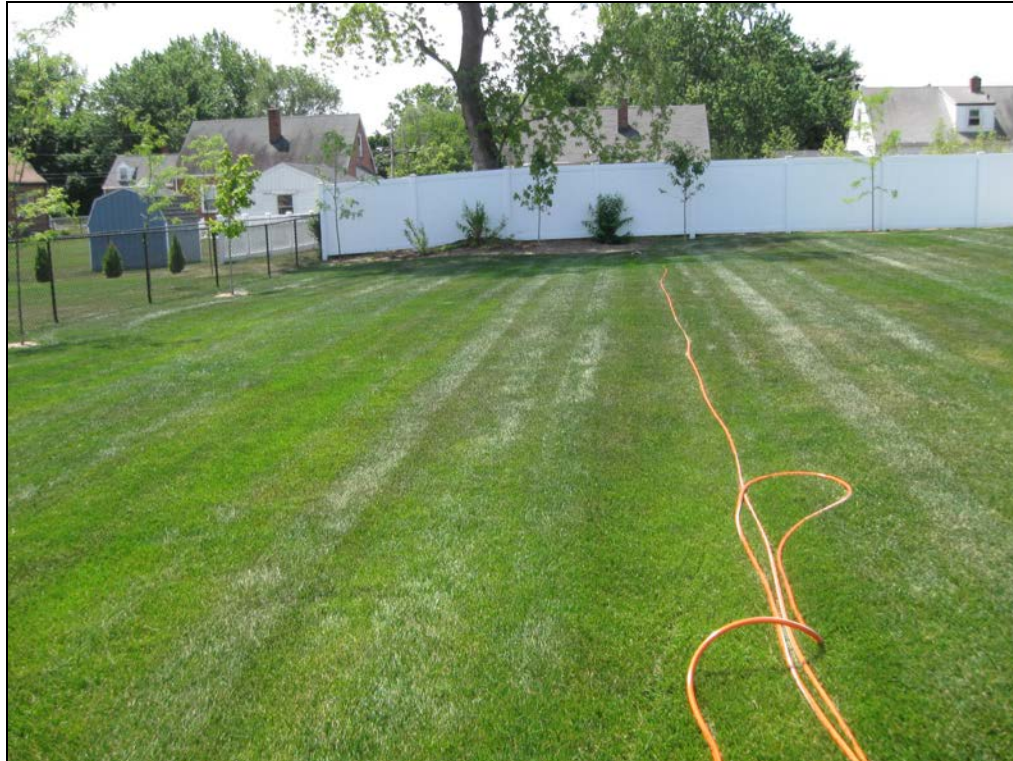
View looking south at restored back yard.