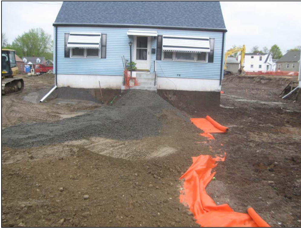
View facing south at partially backfilled front yard.