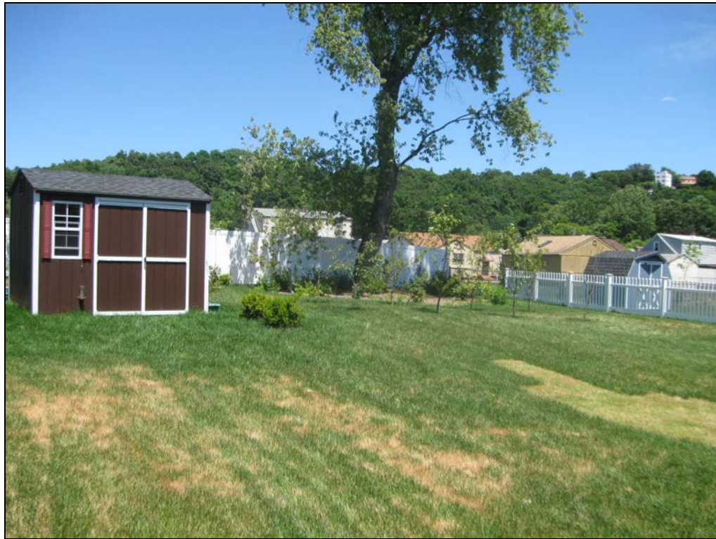
View looking north at restored back yard.