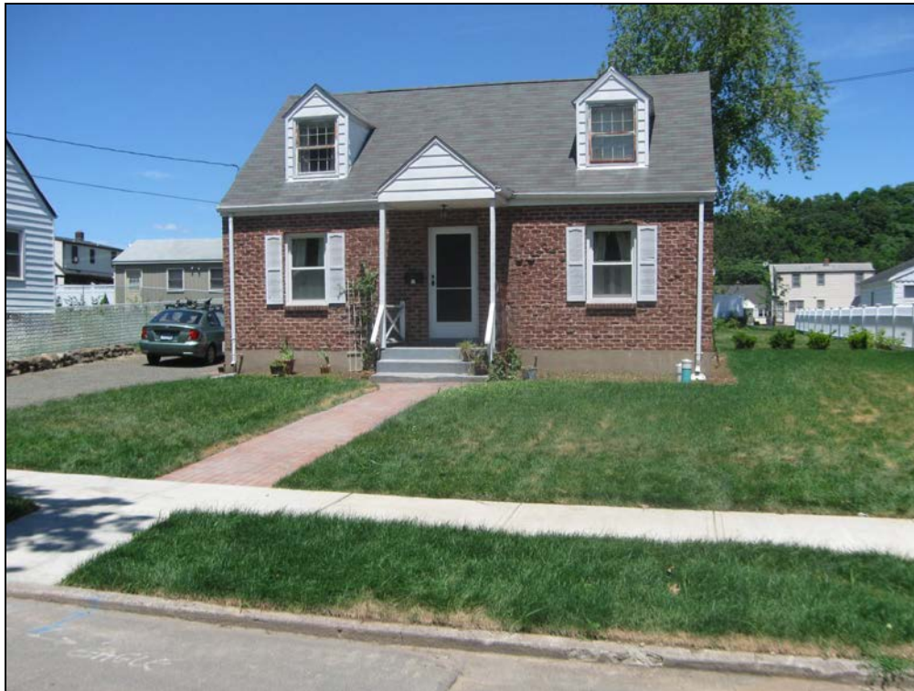
View looking north at restored front yard.