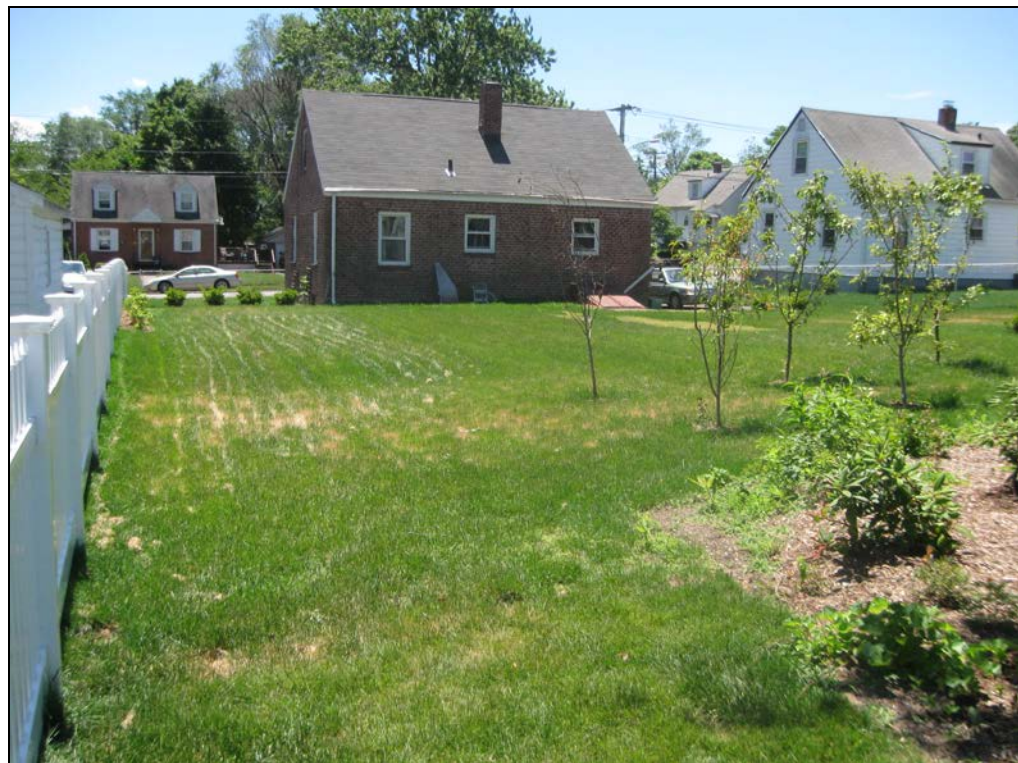
View looking south at restored back yard.