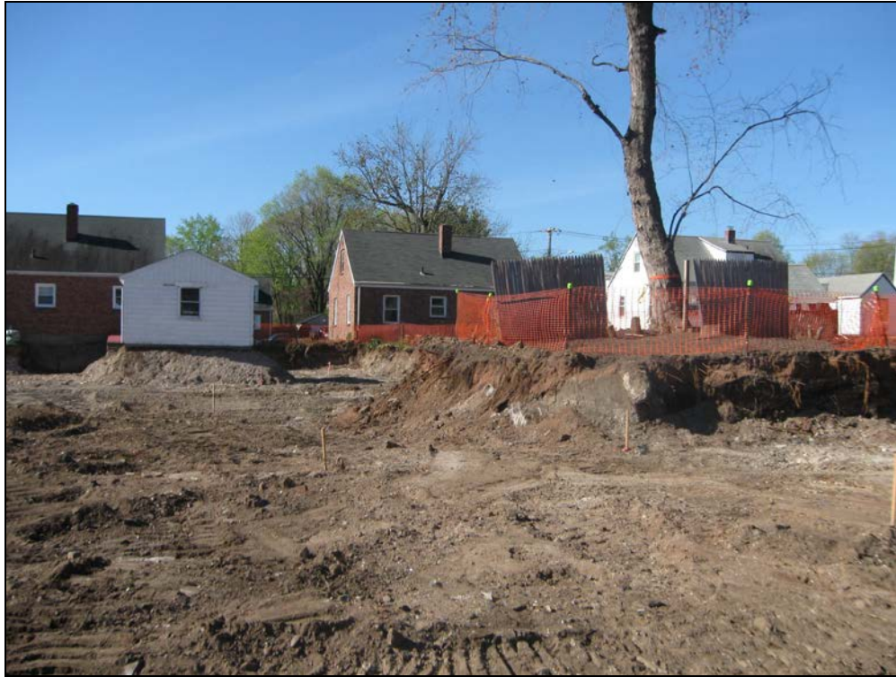
View looking south at excavation around a tree that was retained in accordance with the Tree Sampling Plan.