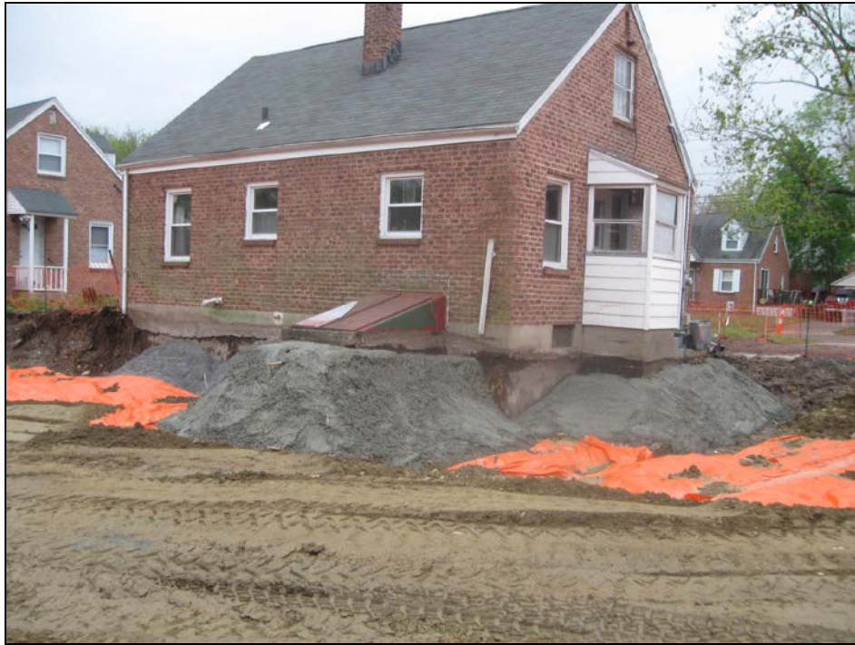
View facing southeast at partially backfilled back yard.