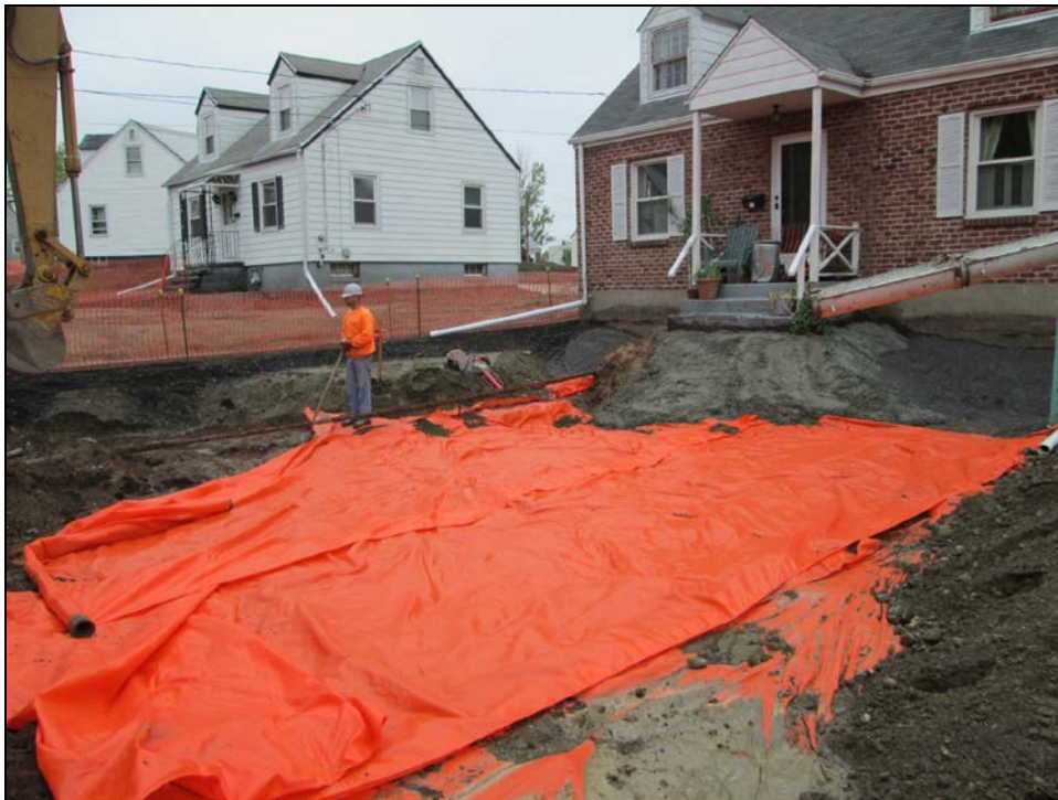
View looking northwest at marker barrier being installed in front yard.