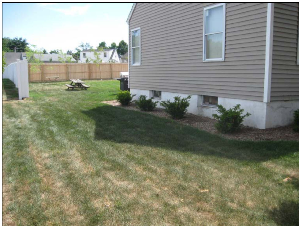
View looking south at restored side and back yard.