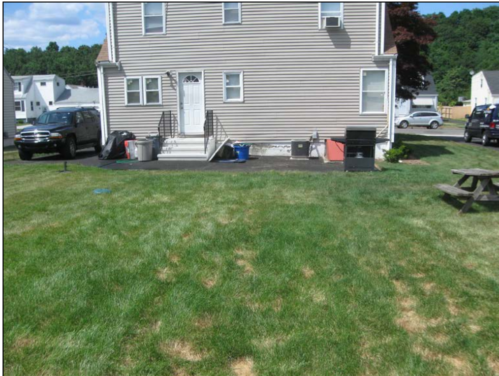
View looking north at restored back yard.