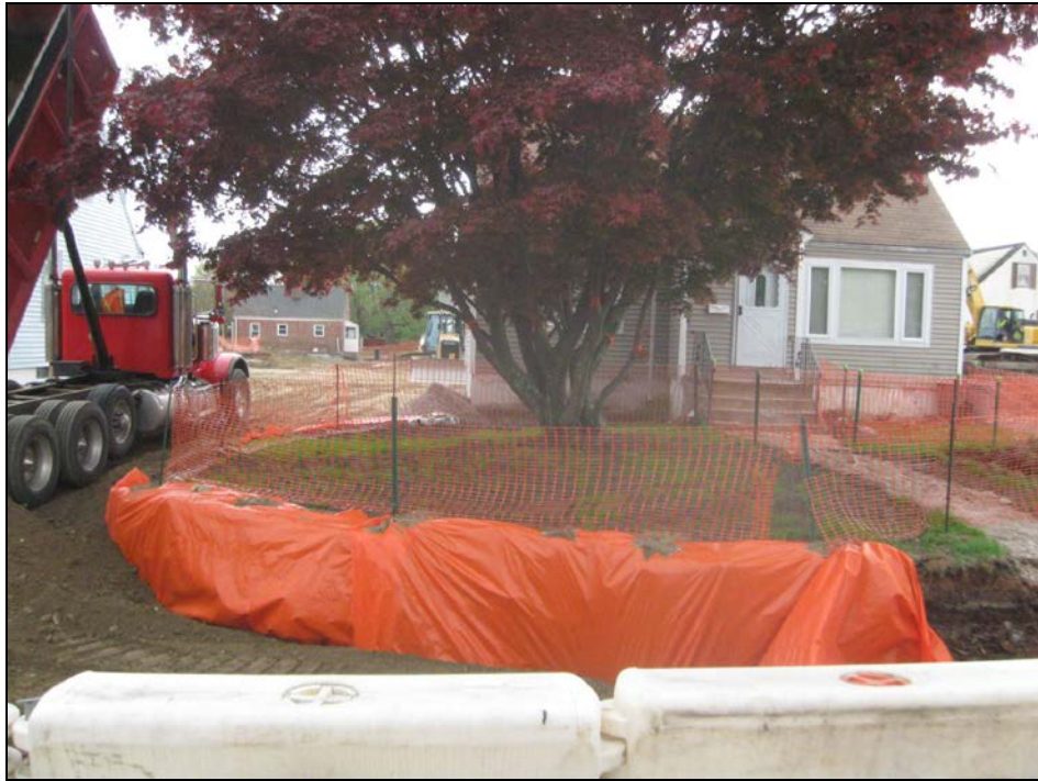
View facing south at the marker barrier surrounding the tree that was retained in accordance with the Tree Sampling Plan