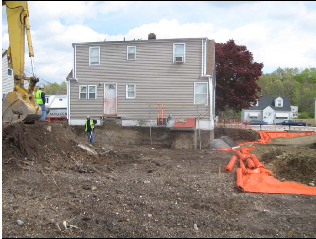
View looking north at excavated back yard.