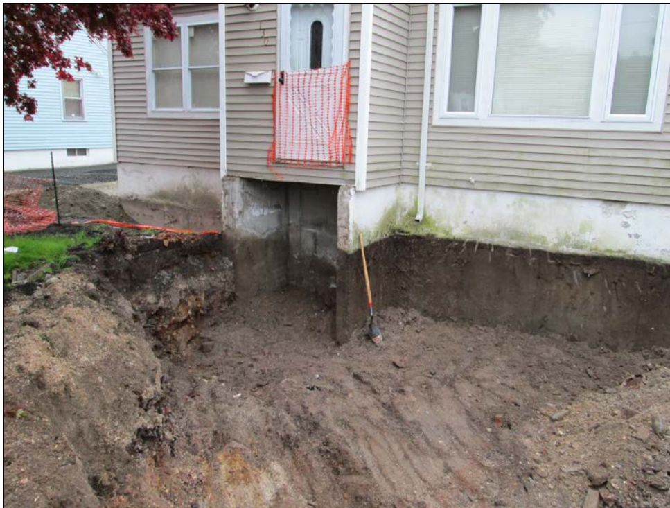
View looking north at excavated front of the house prior to marker barrier being installed.