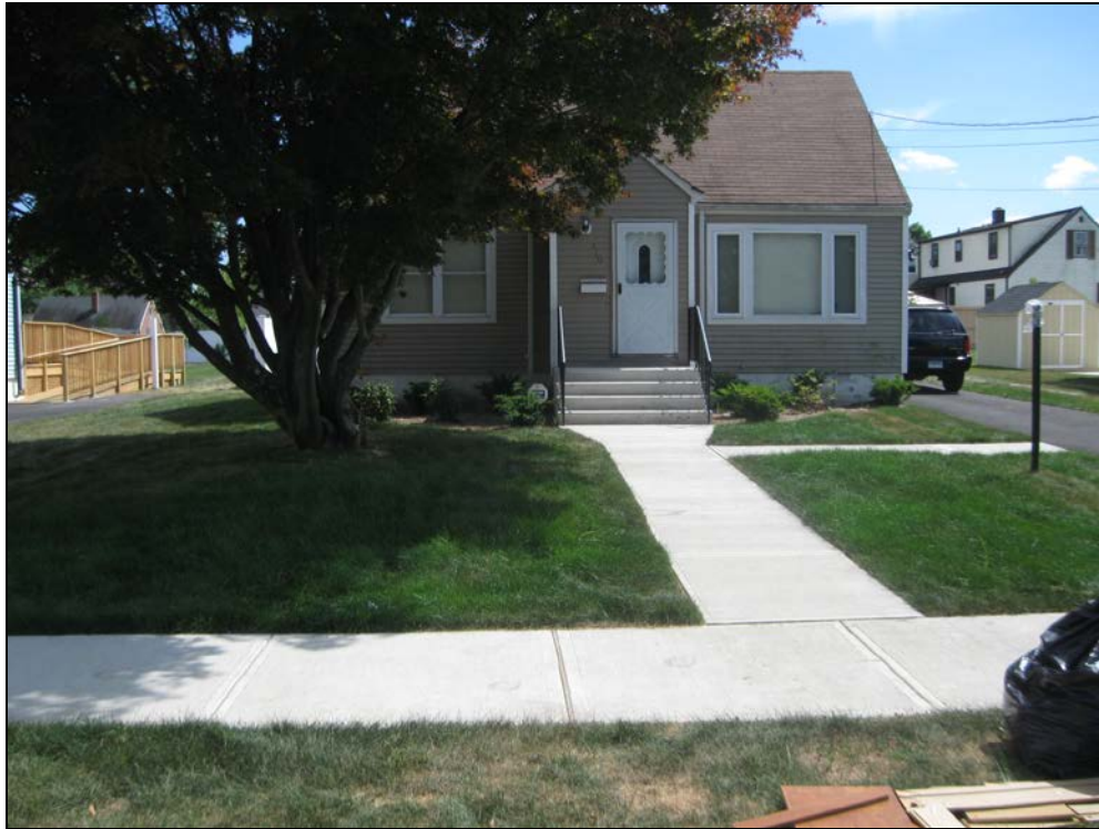
View looking south at restored front yard.