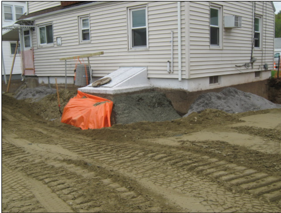
View looking northwest at the partially backfilled back and side yard.