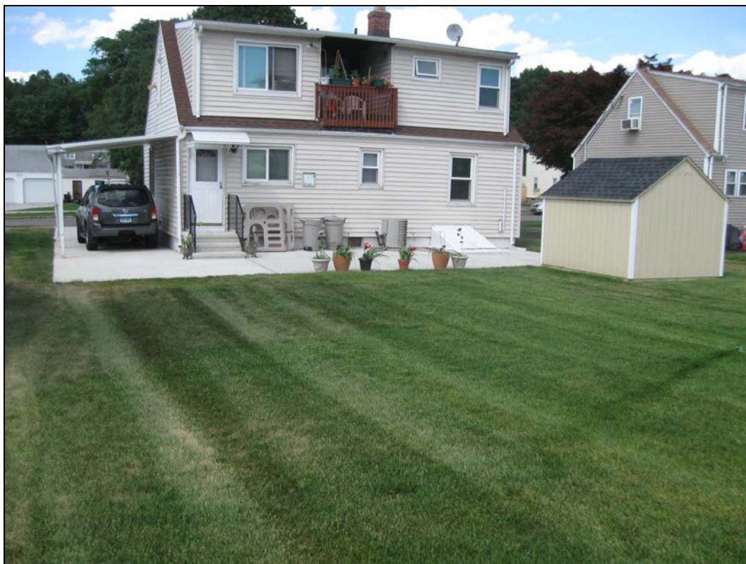
View looking north at restored back yard.