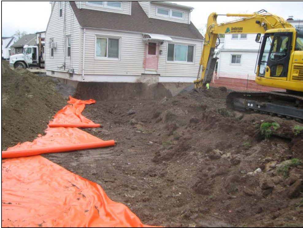
View facing southwest at the excavation and marker barrier installation in the front yard.