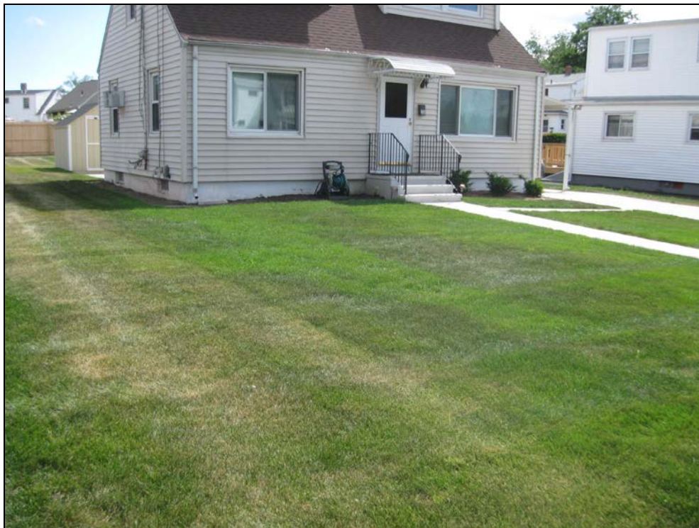
View looking southwest at restored front yard.