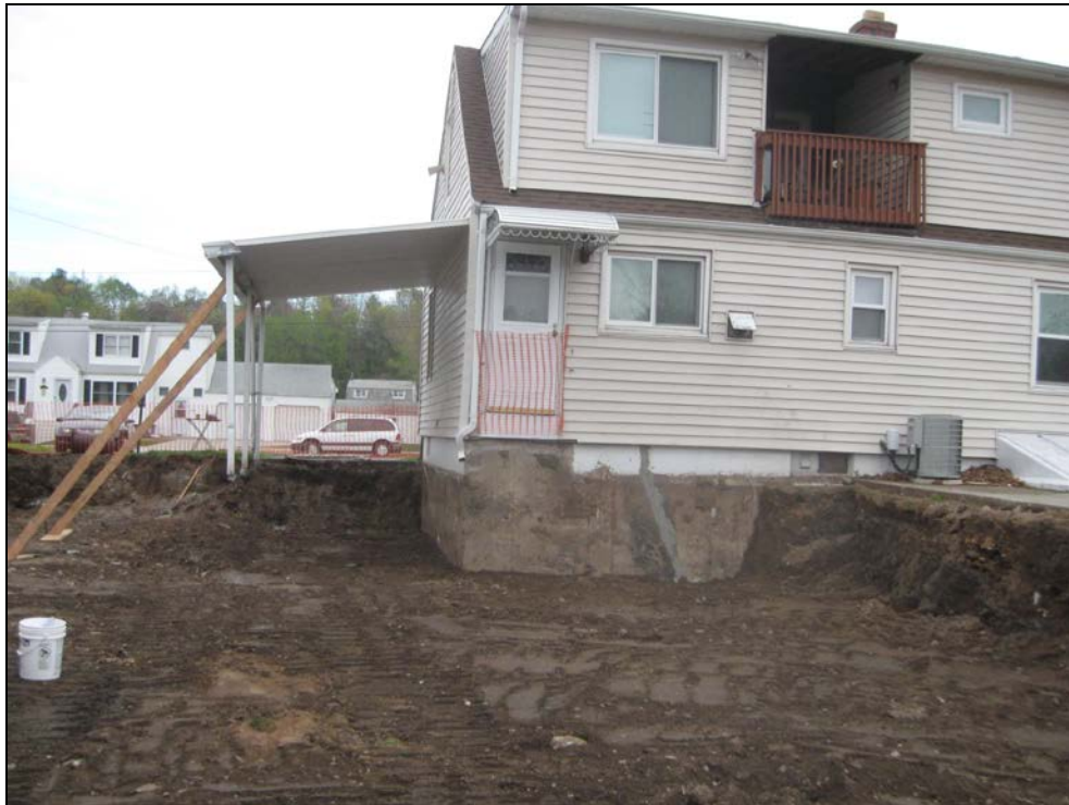
View looking north at excavated back of the house prior to marker barrier being installed.