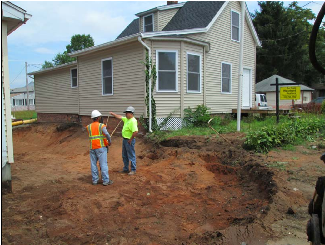
View looking northeast at excavated side yard.