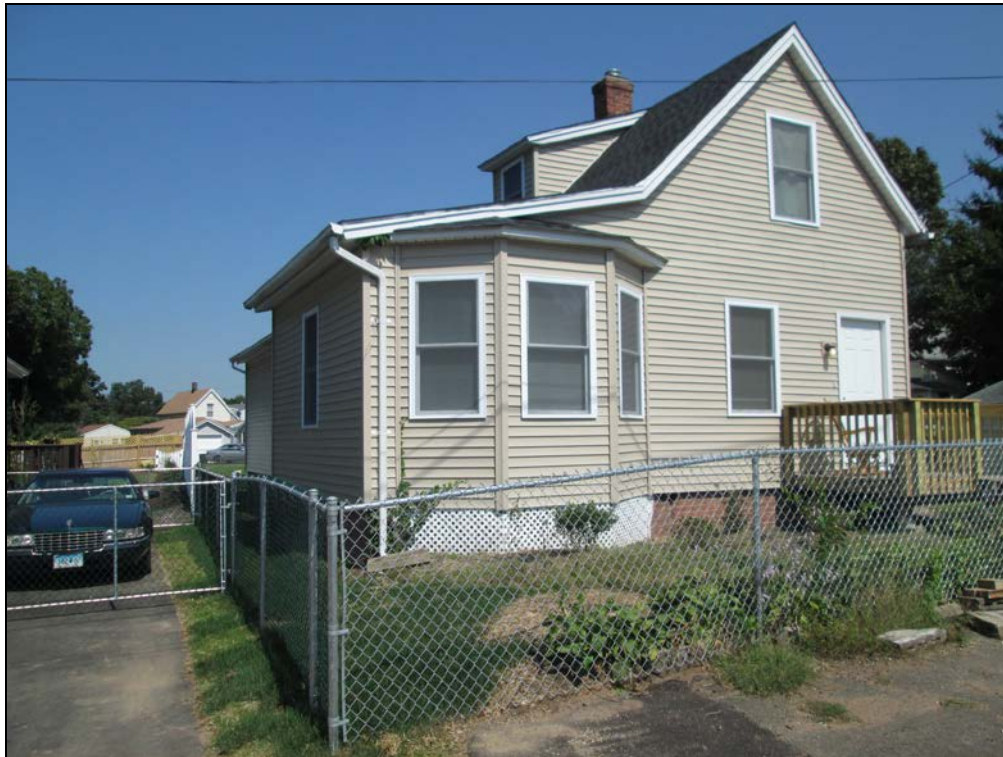
View looking north at restored front and side yards.