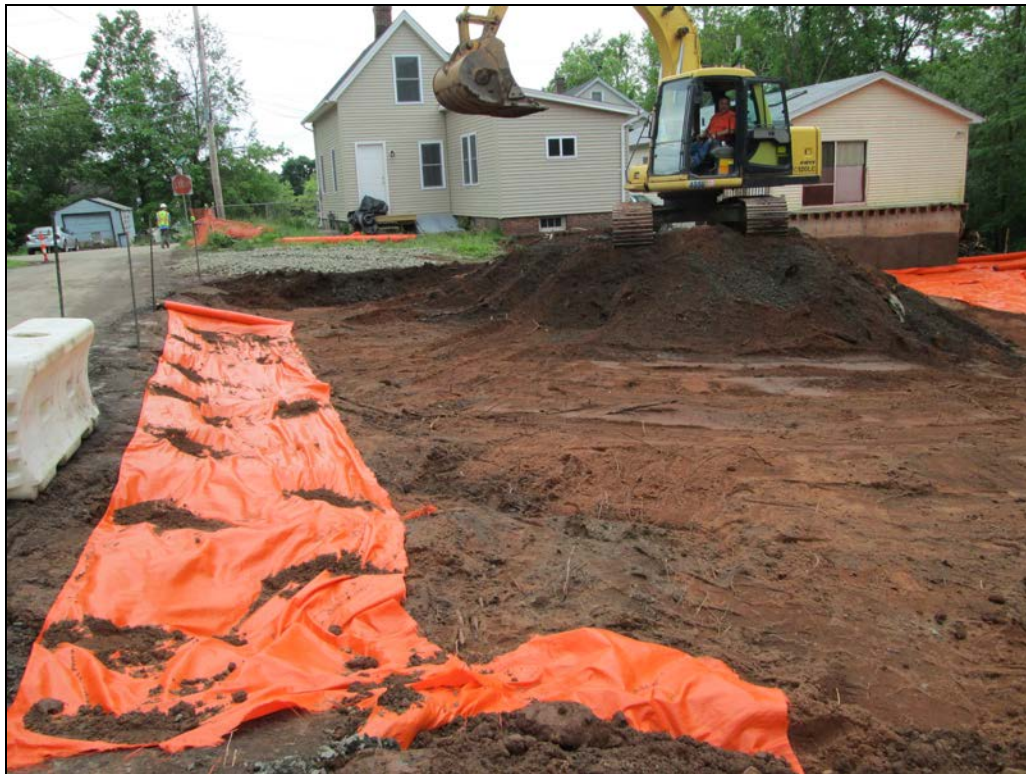
View looking south at excavation in back yard during placement of marker barrier.