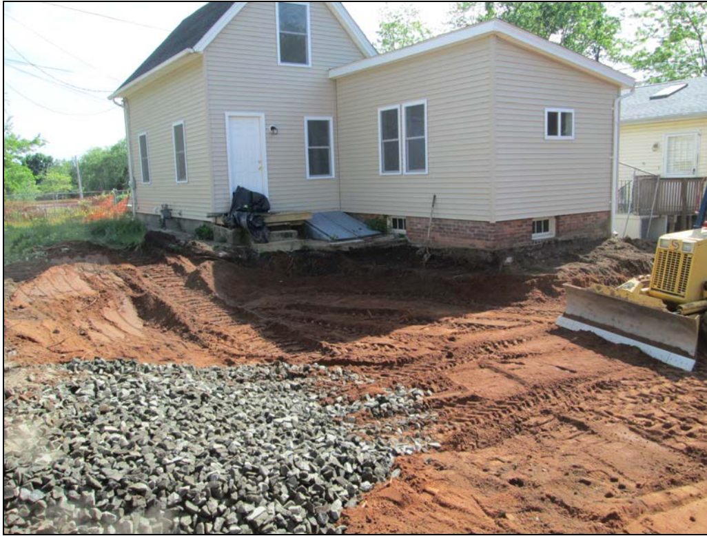
View looking south at excavated back yard.