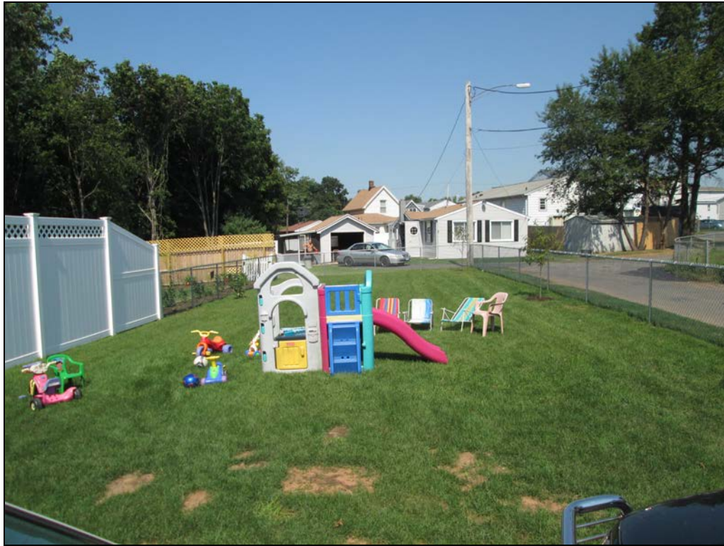
View looking north at restored back yard.