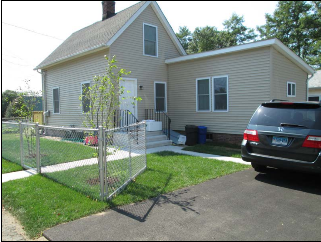
View looking southwest at restored back yard.