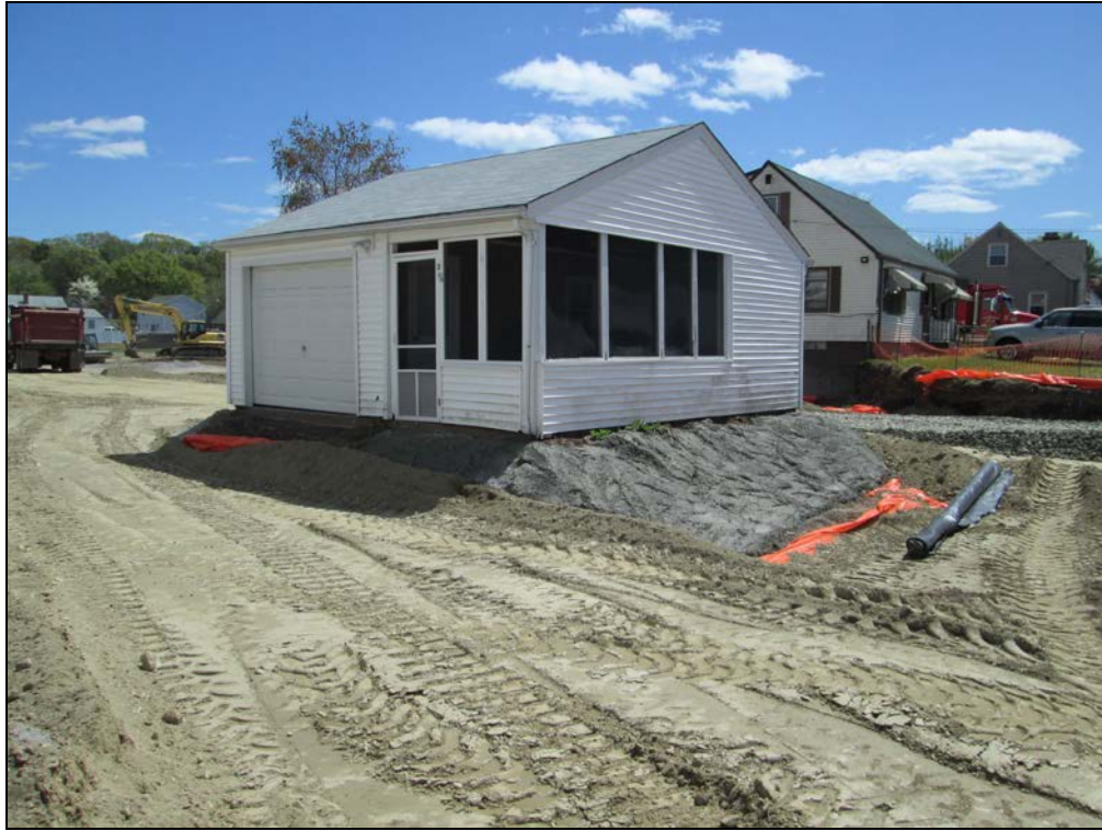
View looking southeast at the partially backfilled area around the garage.