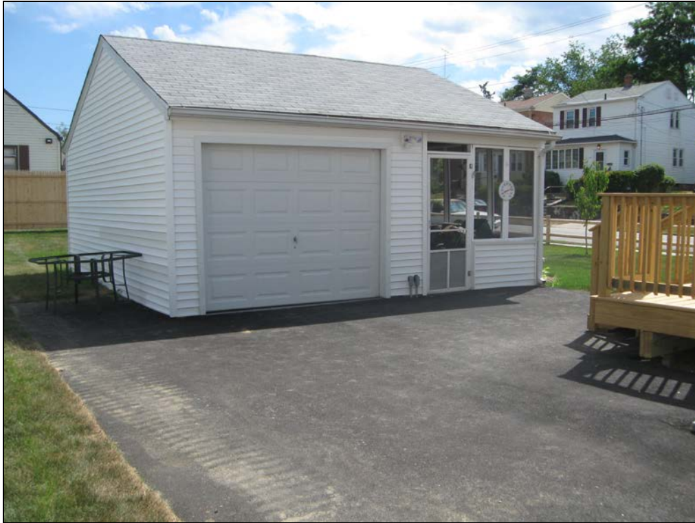
View looking southwest at restored driveway.