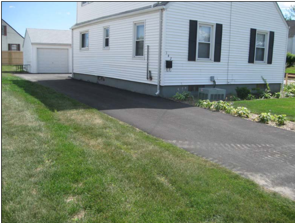
View looking south at restored back and side yard.