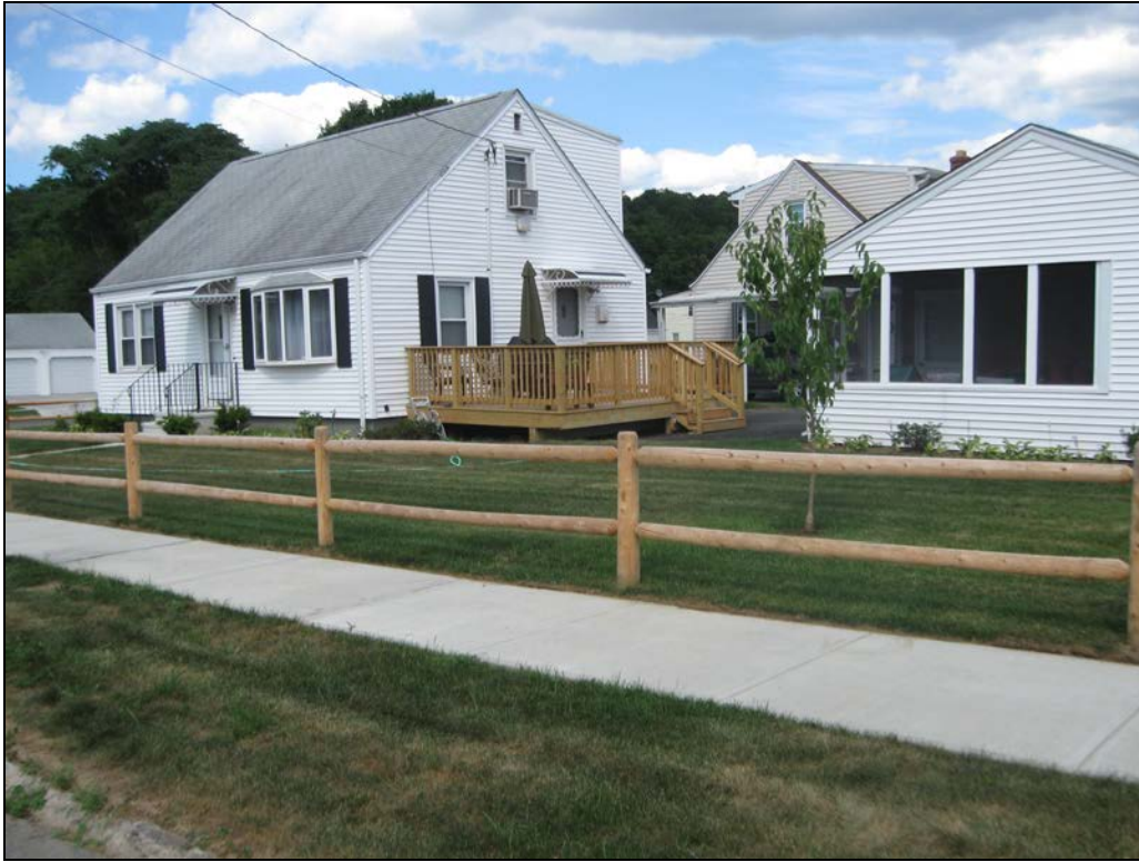
View looking northeast at restored front yard.