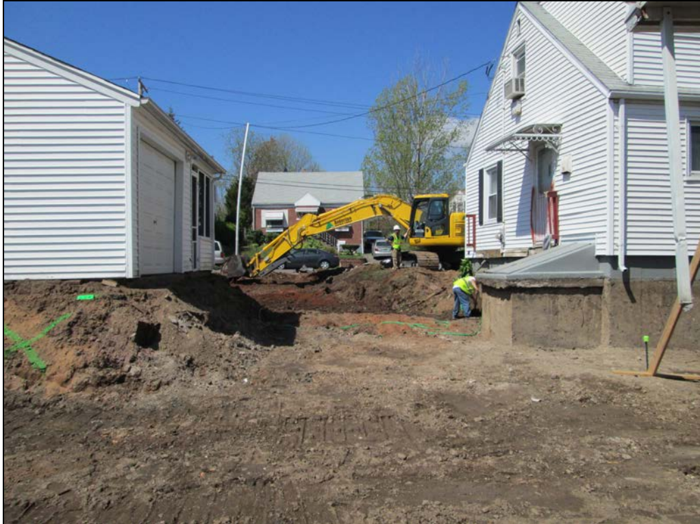
View looking west at excavated back yard.