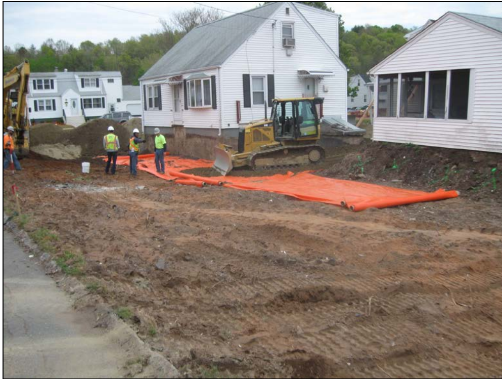
View facing northeast at excavated front yard.