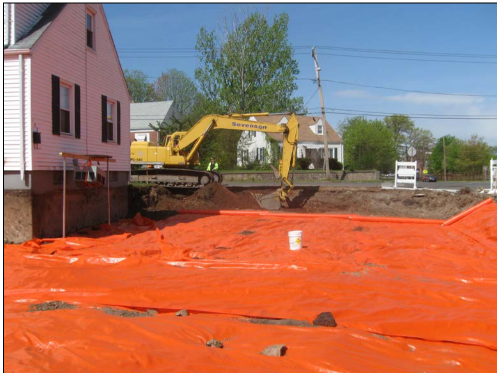
View looking west at excavated side yard.