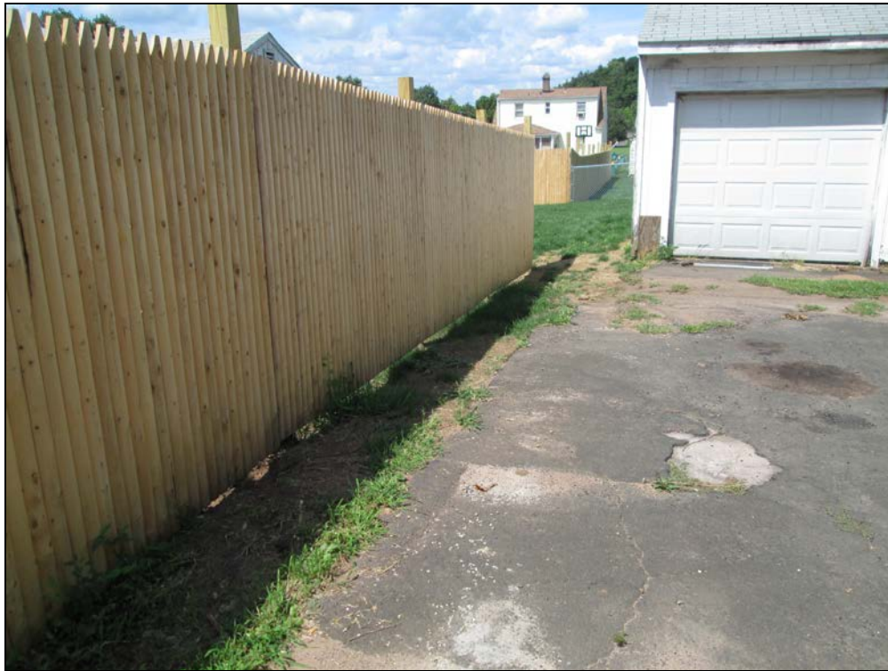
View looking north at restored fence along property boundary.