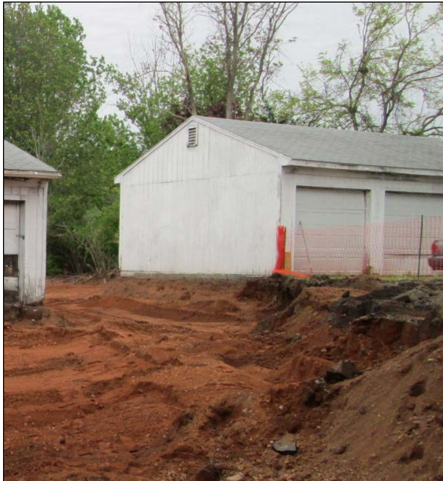
View looking northeast at excavation along west side of garage.