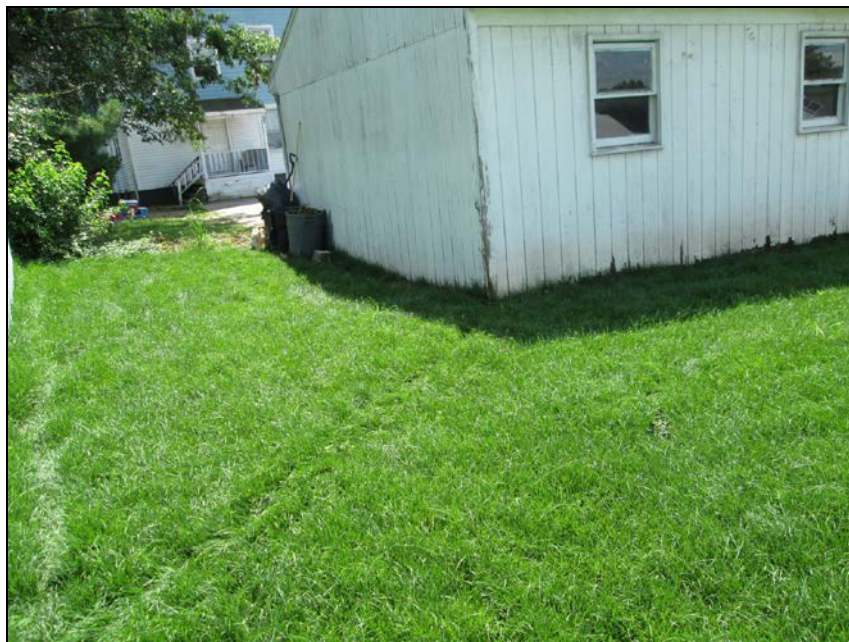
View looking north at restored area behind garage.