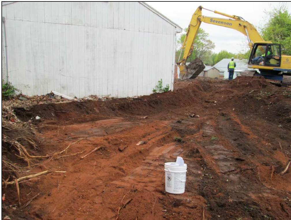
View looking northwest at excavation along east side of the garage.