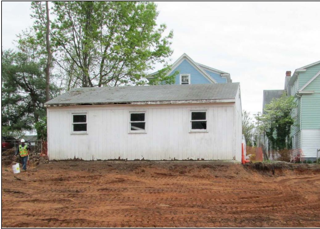
View looking south at excavation area behind garage.