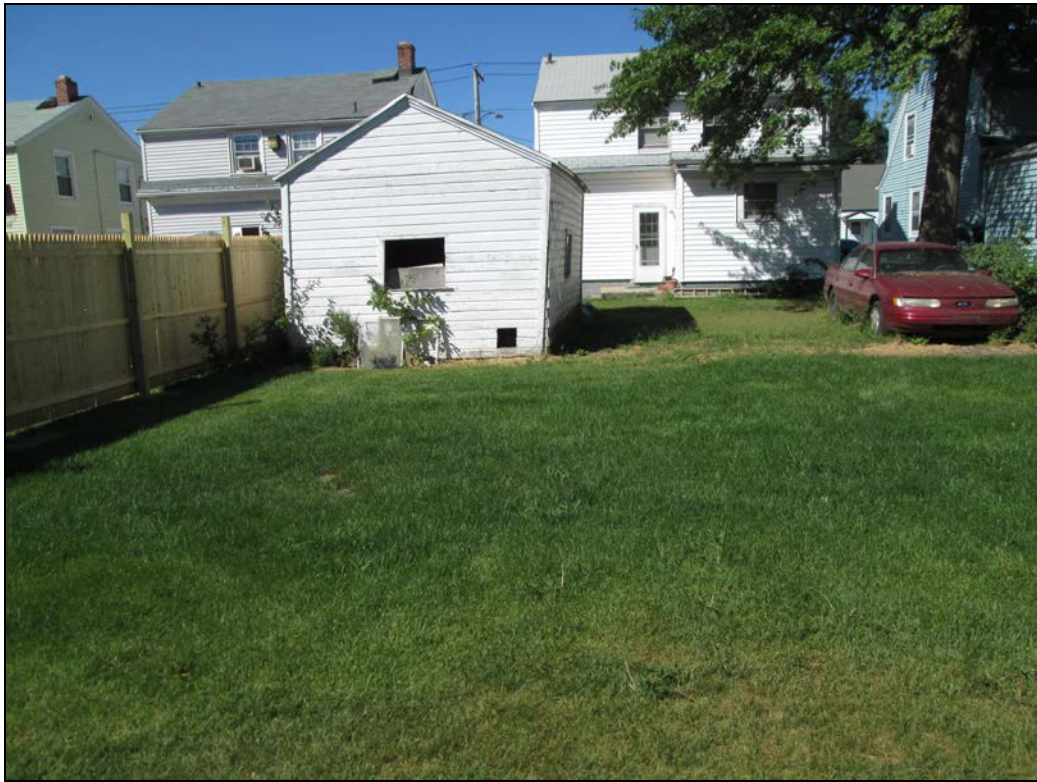
View looking north at restored back yard..