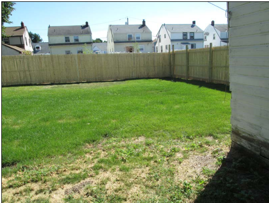
View looking south at restored back yard prior to sod/seed repair.