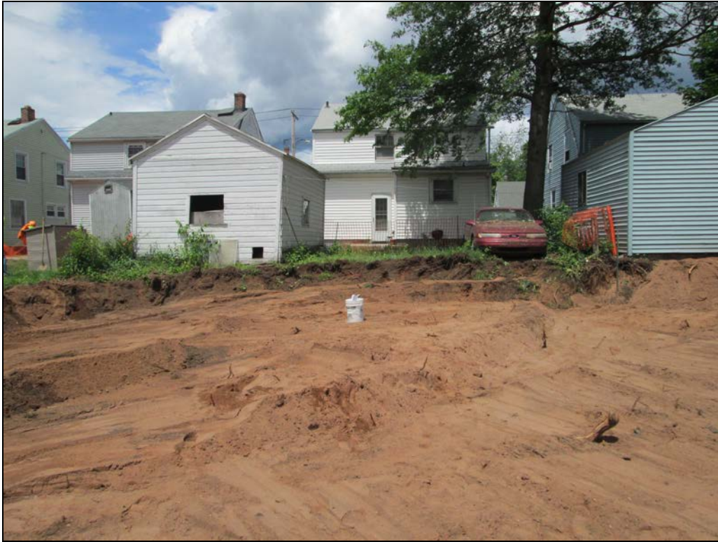
View looking north at extent of excavation in back yard.