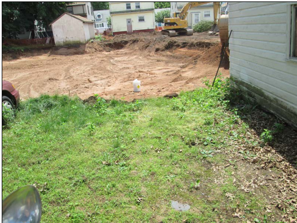
View looking south at excavated back yard.