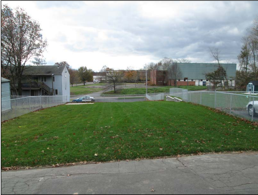
View looking south at restored property.