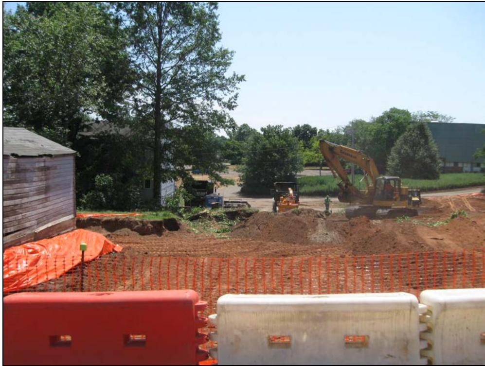
View looking south at excavated property.