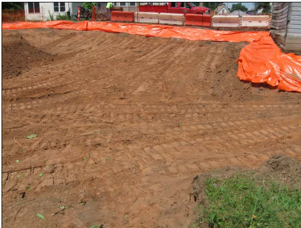
View looking north at excavated property with marker barrier at edge of Harris St.