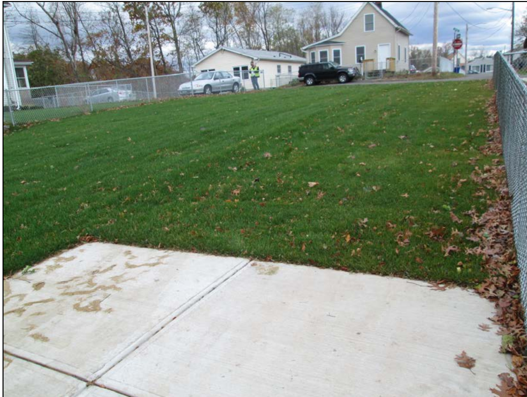
View looking north at restored property.