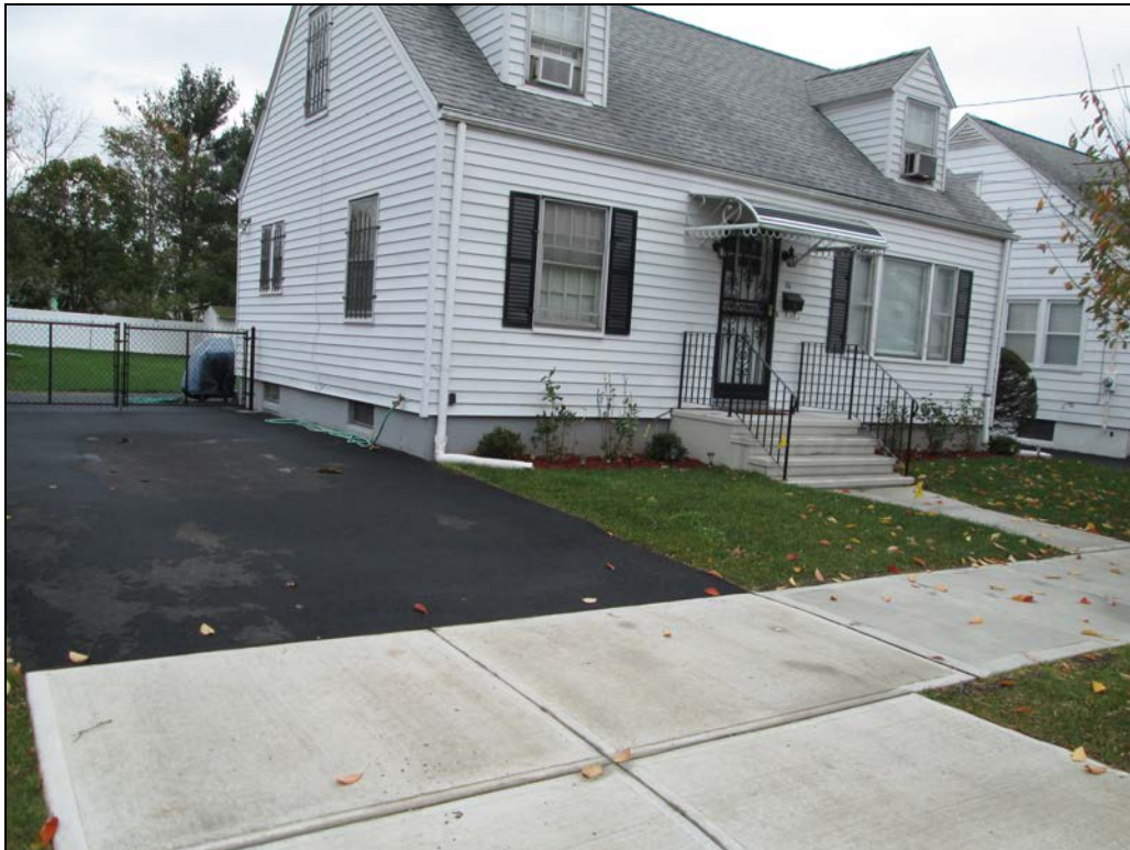
View looking southwest at restored front yard.