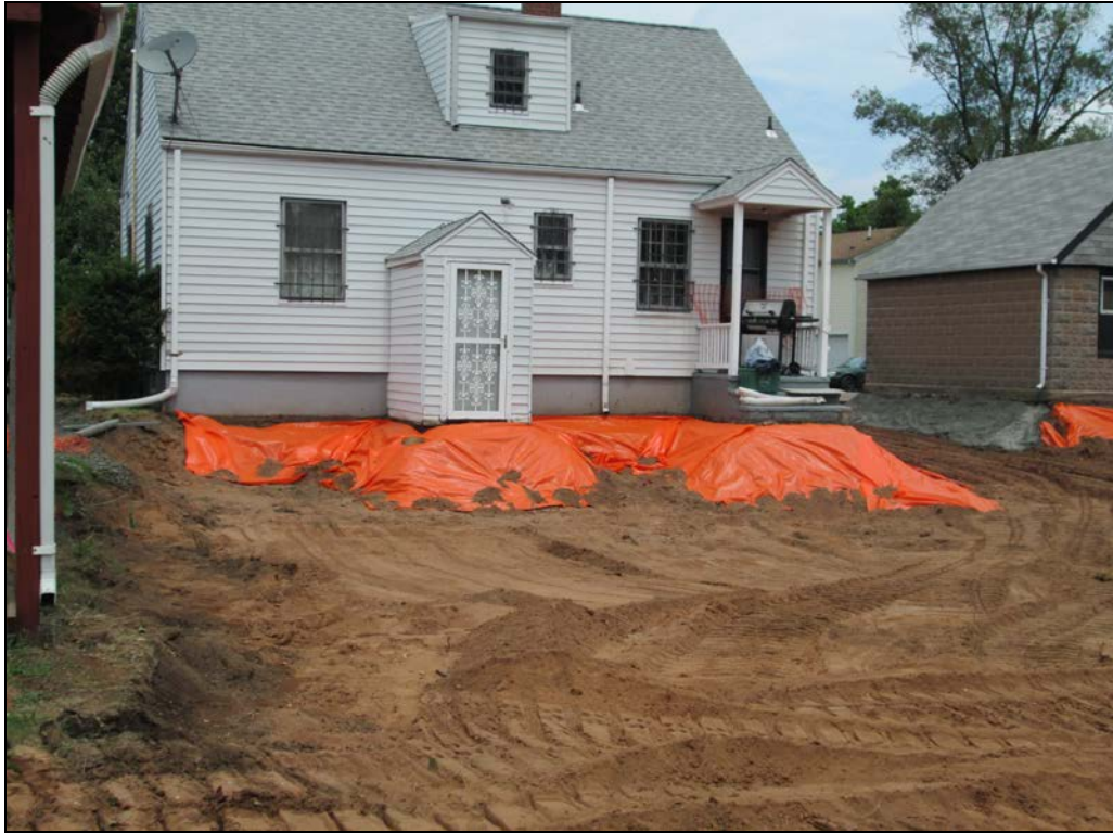
View looking north at excavated back yard.