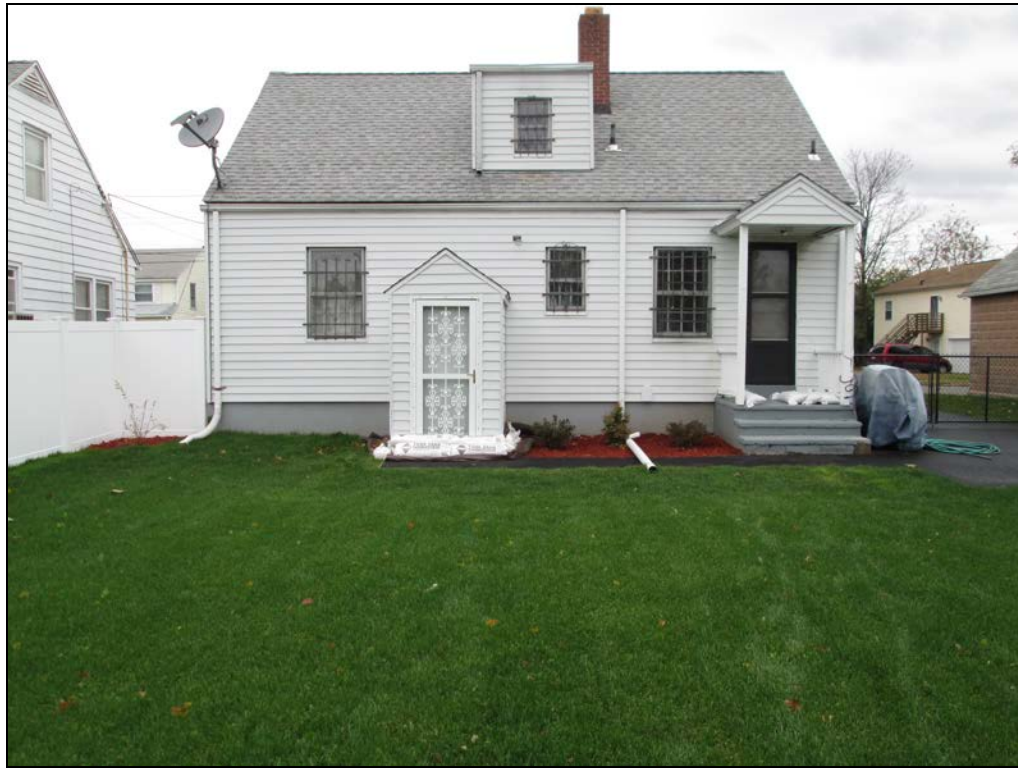
View looking north at restored back yard.