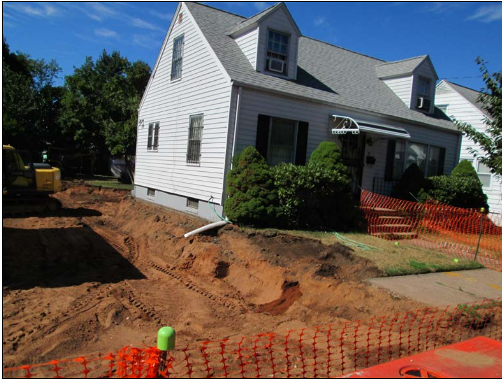
View looking southwest at excavated driveway area.