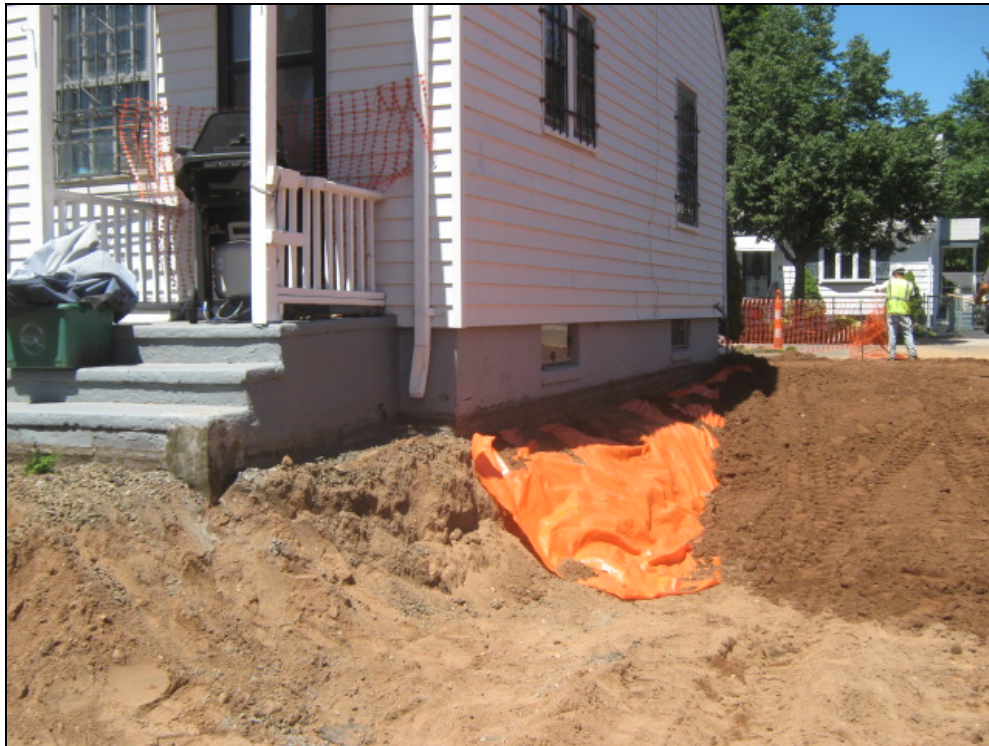
View looking northwest at excavated side yard following placement of marker barrier.