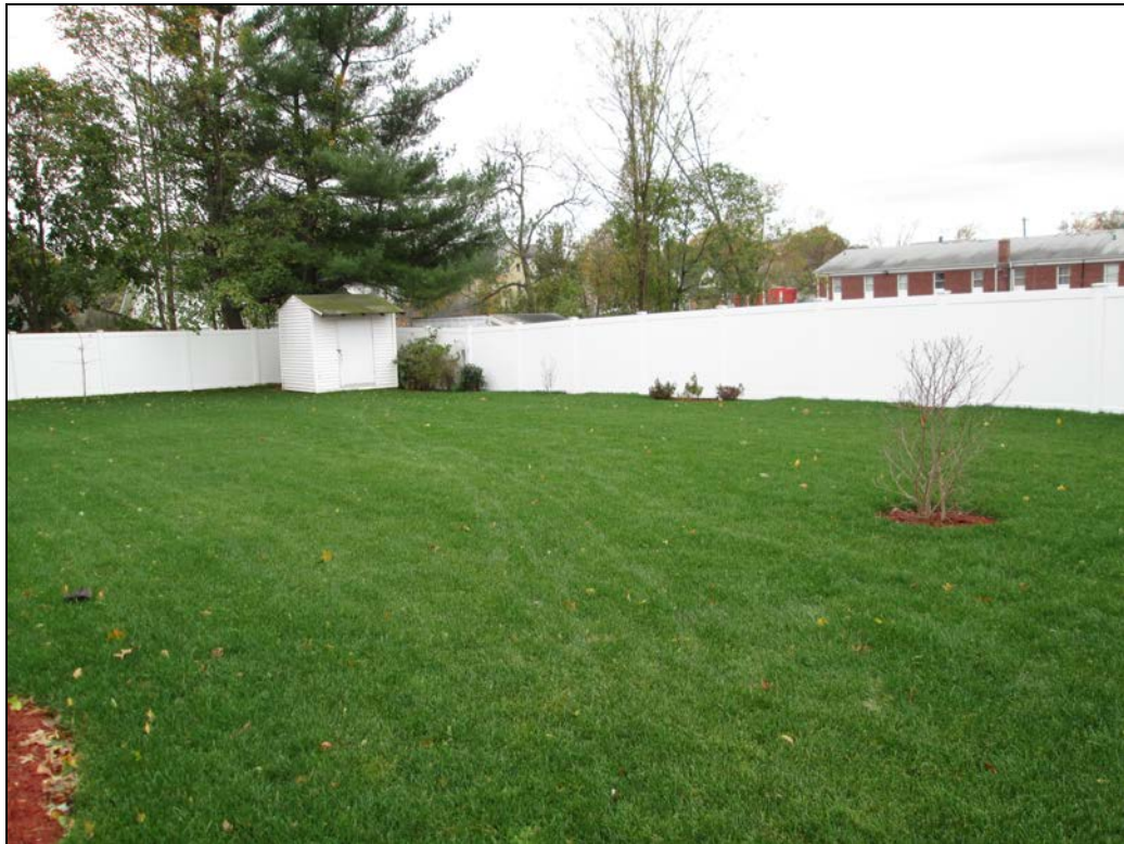
View looking south at restored back yard.