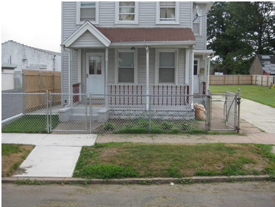
View looking East at restored property