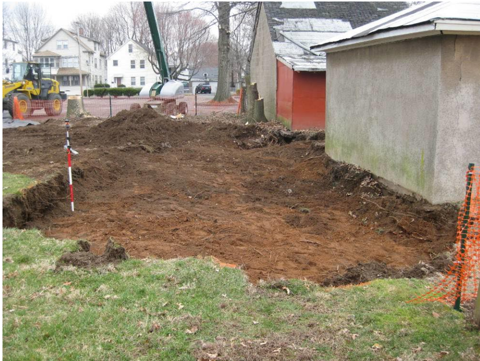
View looking east at excavation area adjacent to 319 and 321 Goodrich Street