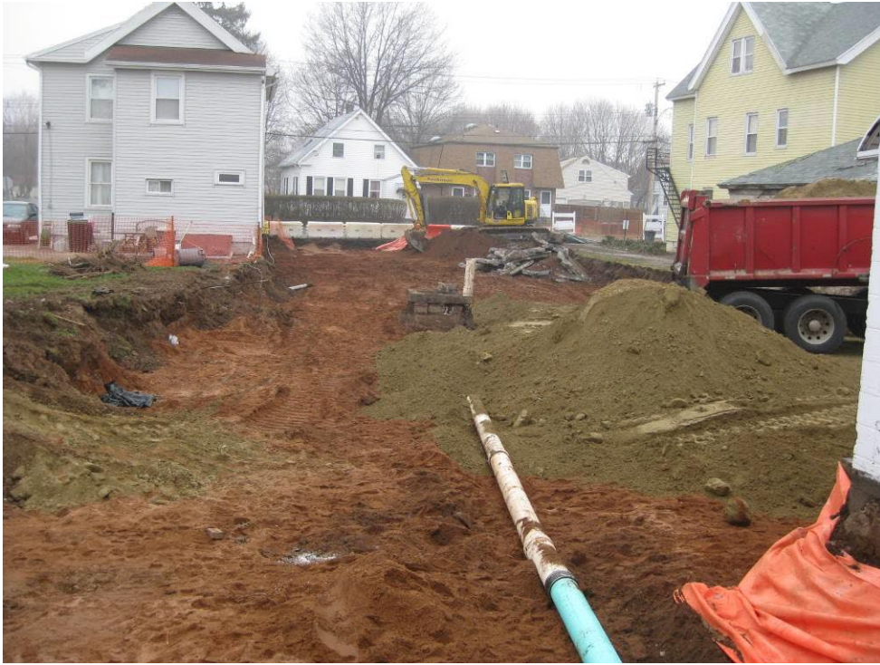
View looking West at excavation in back of 17-19 St Mary and adjacent property