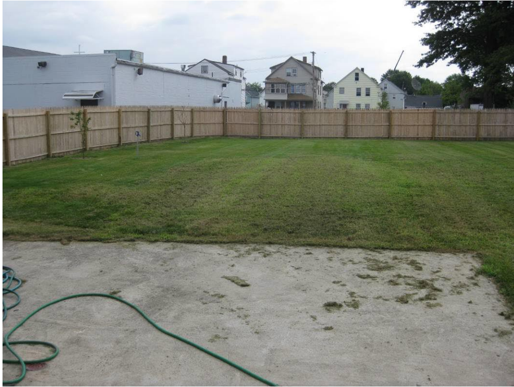
View looking East at partially restored yard