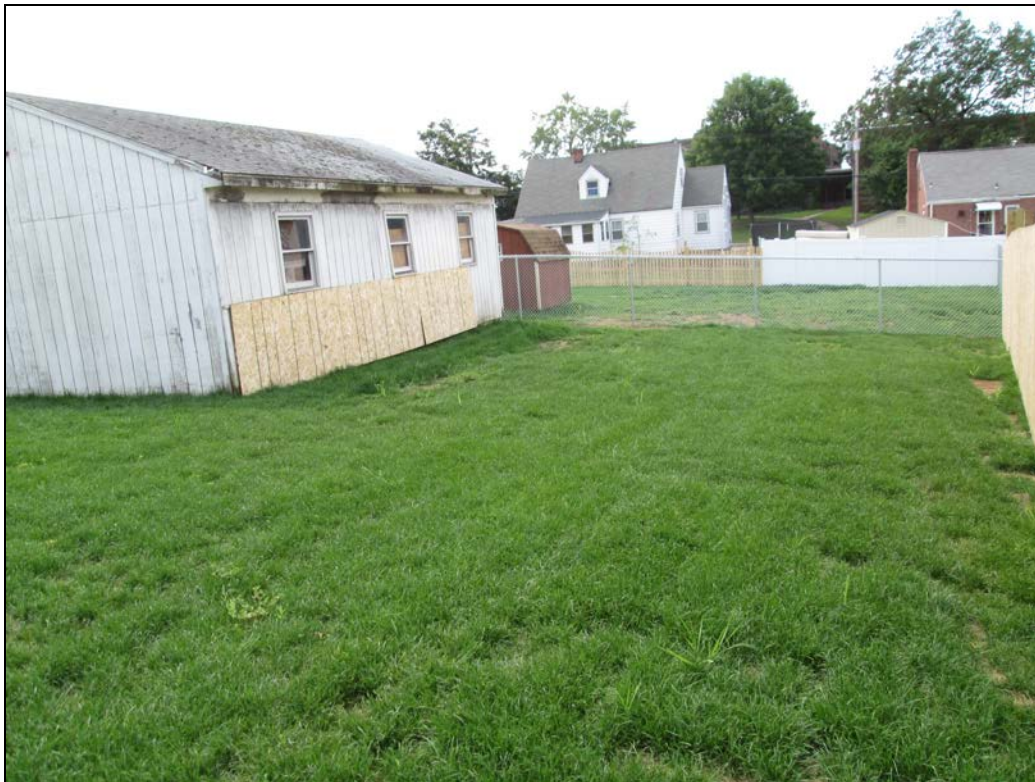
View looking west at restored back yard behind garage.