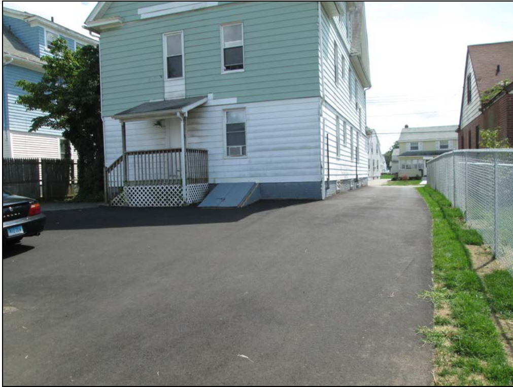
View looking south at restored back yard and parking area.