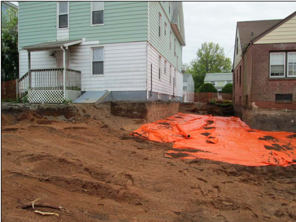
View looking south at excavated back yard.