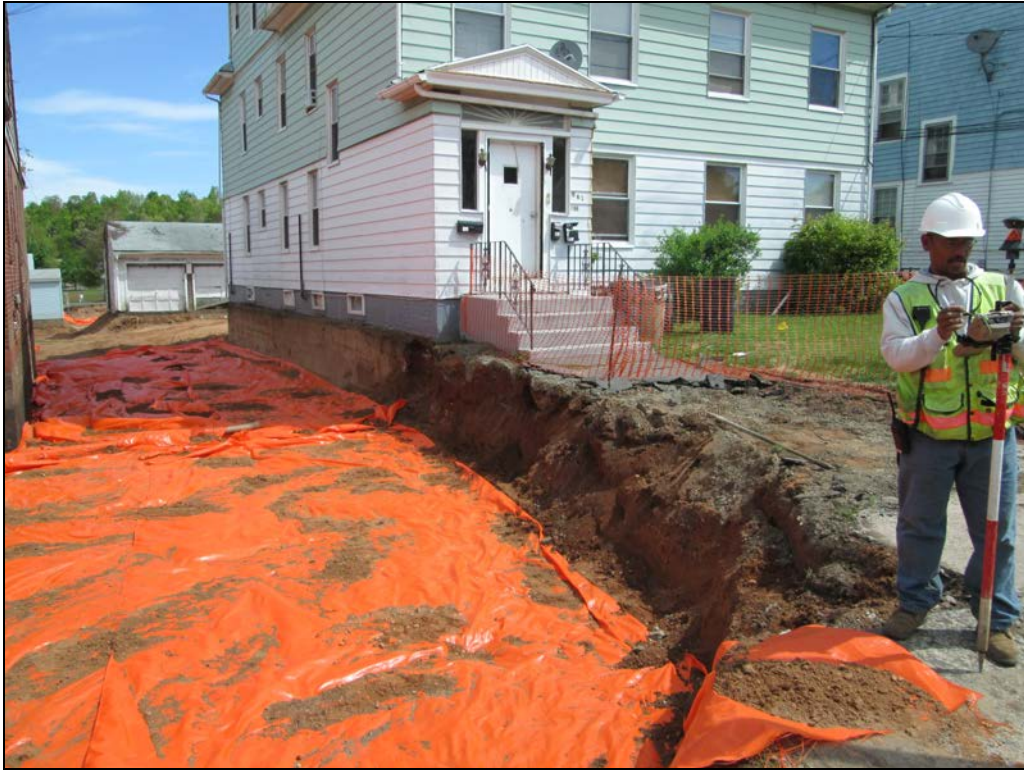
View looking north at excavated driveway area after placement of marker barrier.