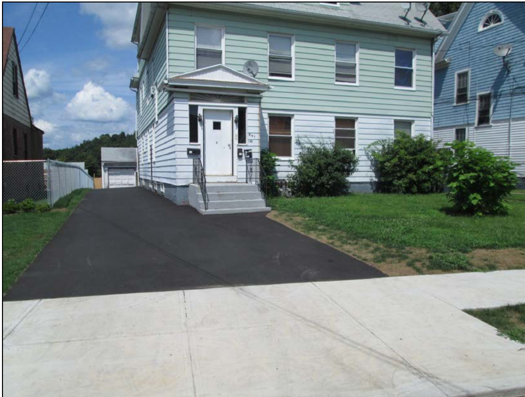
View looking north at restored driveway.