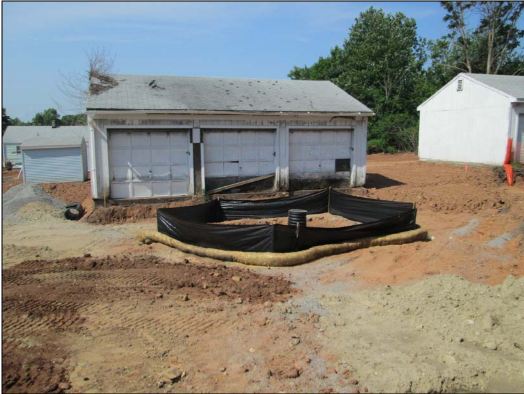
View looking north at partially backfilled back yard with new drywell.