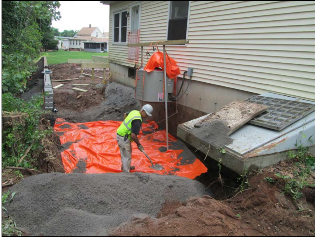
View looking north at excavated side yard.