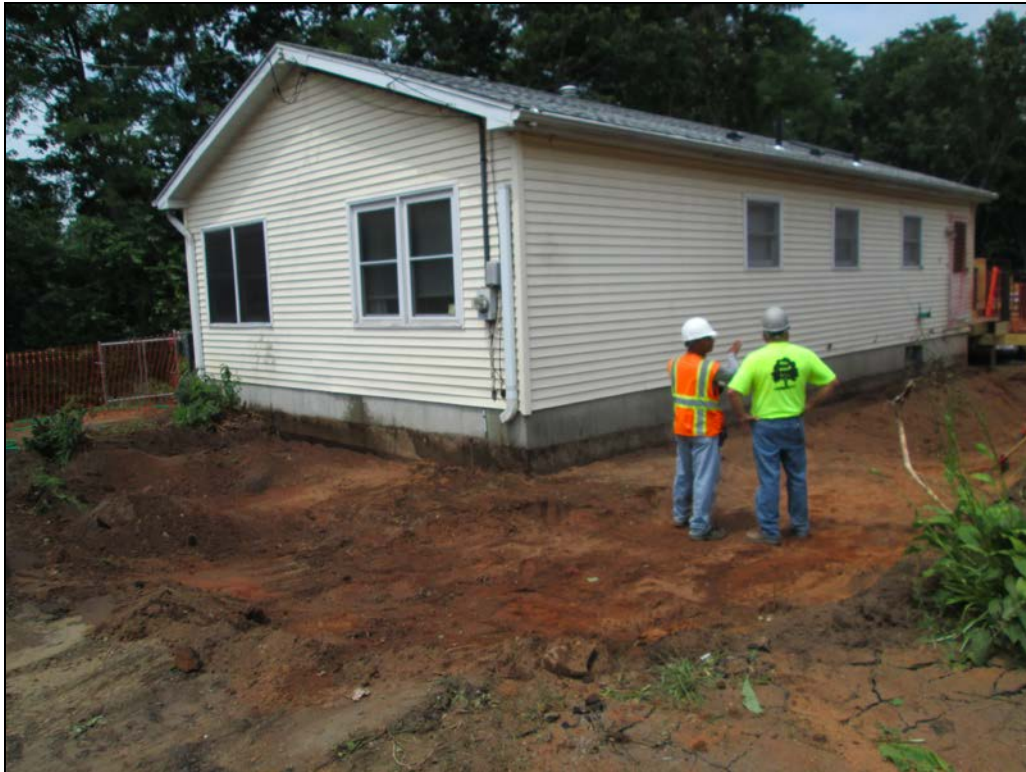
View looking northwest at excavated front yard.