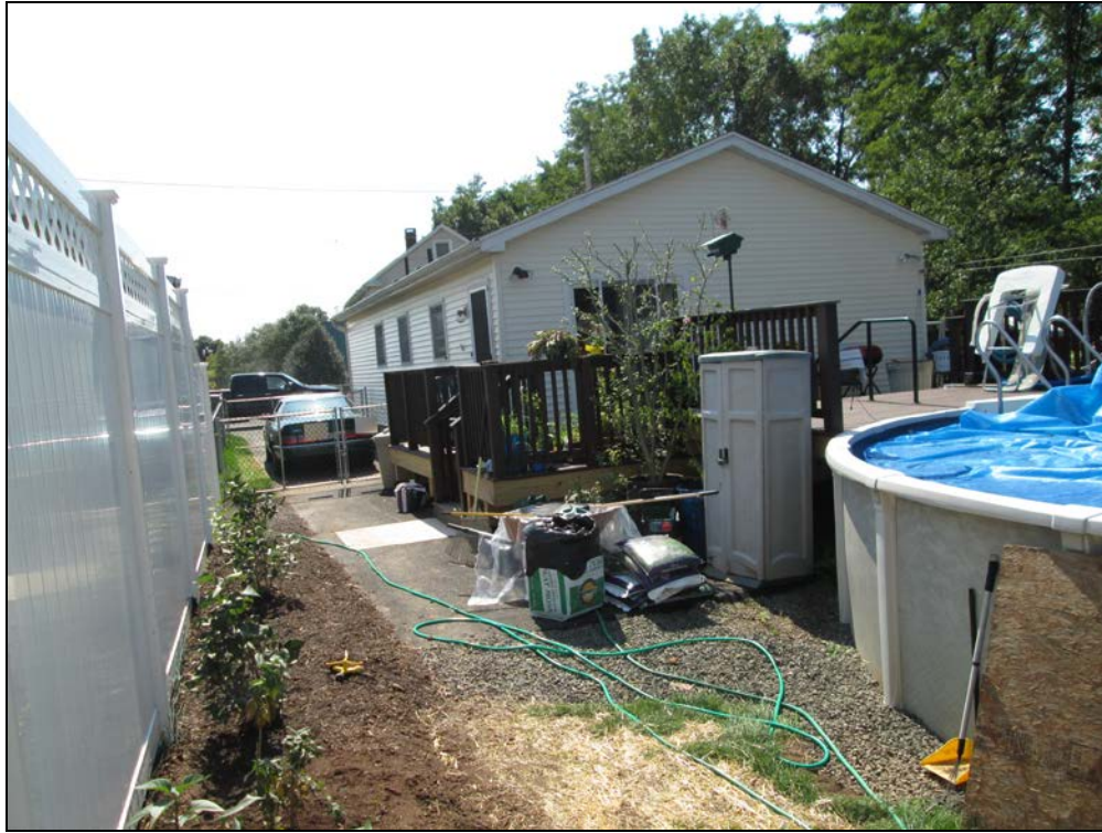
View looking south at restored back yard.