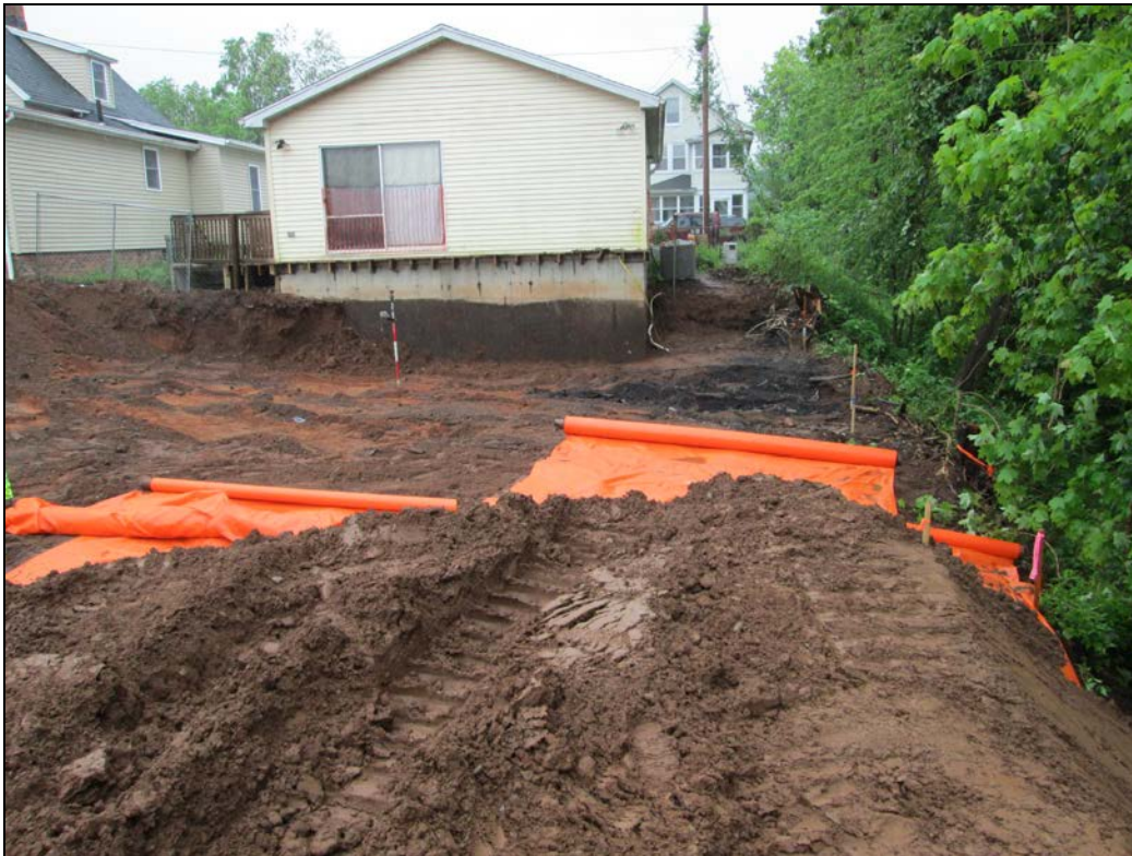
View looking south at excavated back yard.