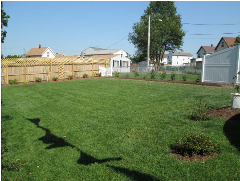
View looking northeast at restored back yard.