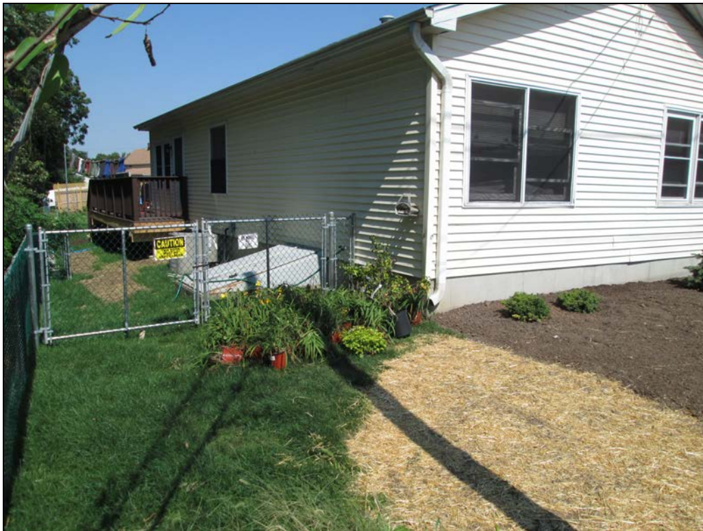
View looking north at restored front and side yards.