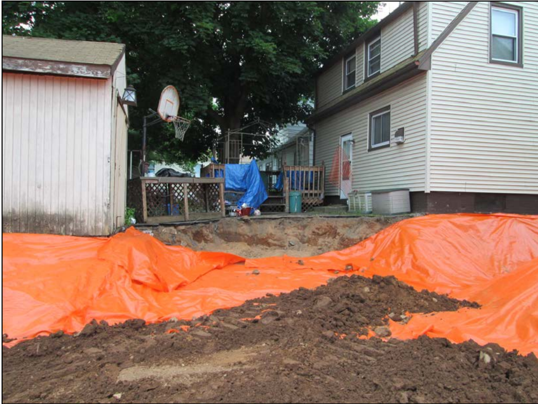
View looking east at excavated back yard with marker barrier over remaining fill.