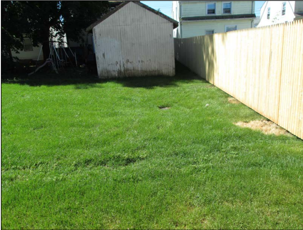
View looking south at restored back yard.