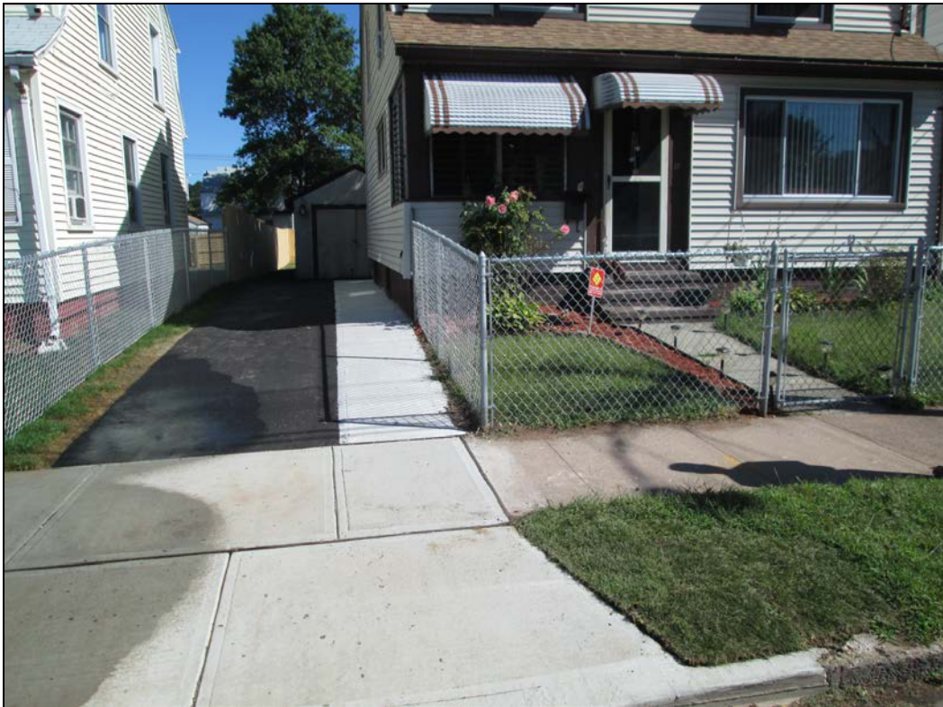
View looking north at restored front yard.