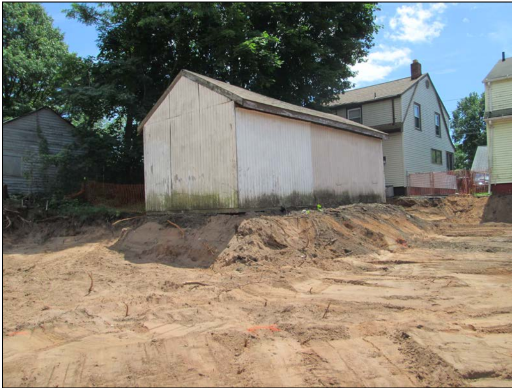
View looking southeast at excavated back yard.