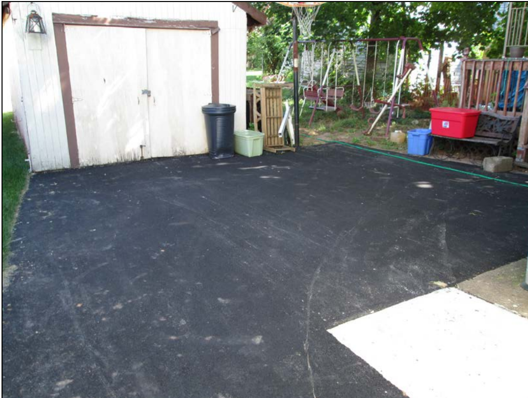
View looking north at restored parking area.