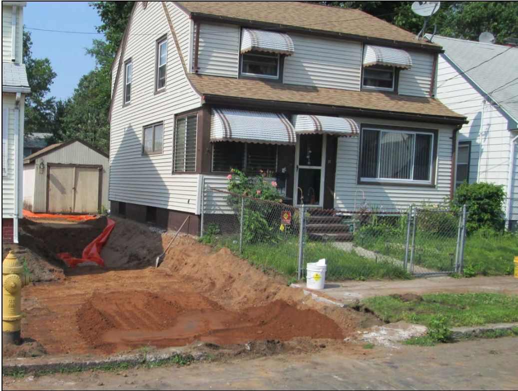
View looking north at excavation in driveway area.