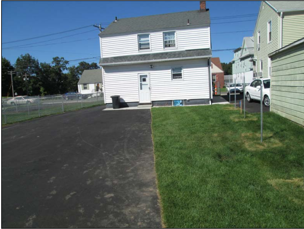
View looking north at restored back yard.