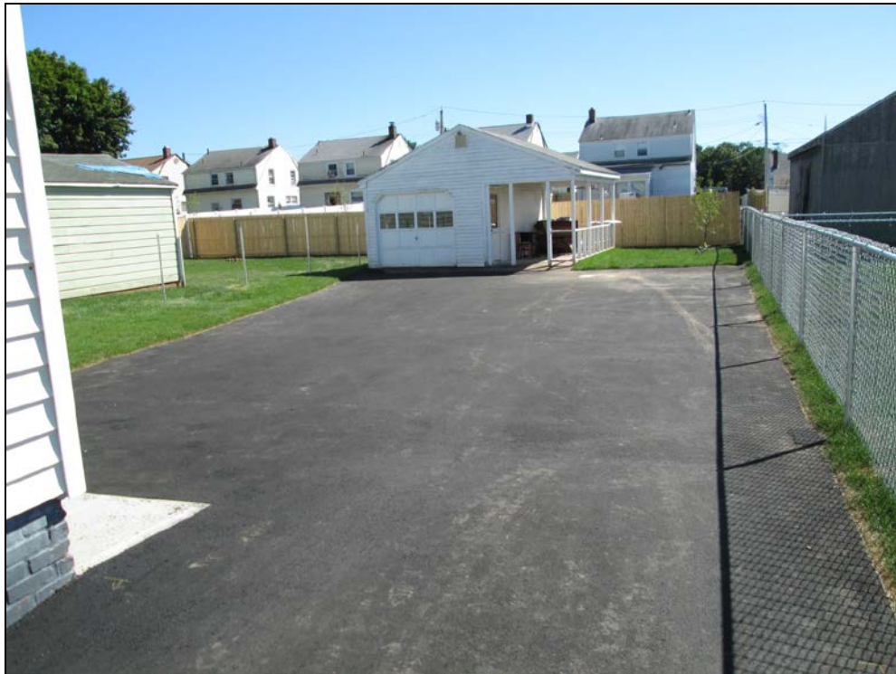
View looking south at restored driveway.