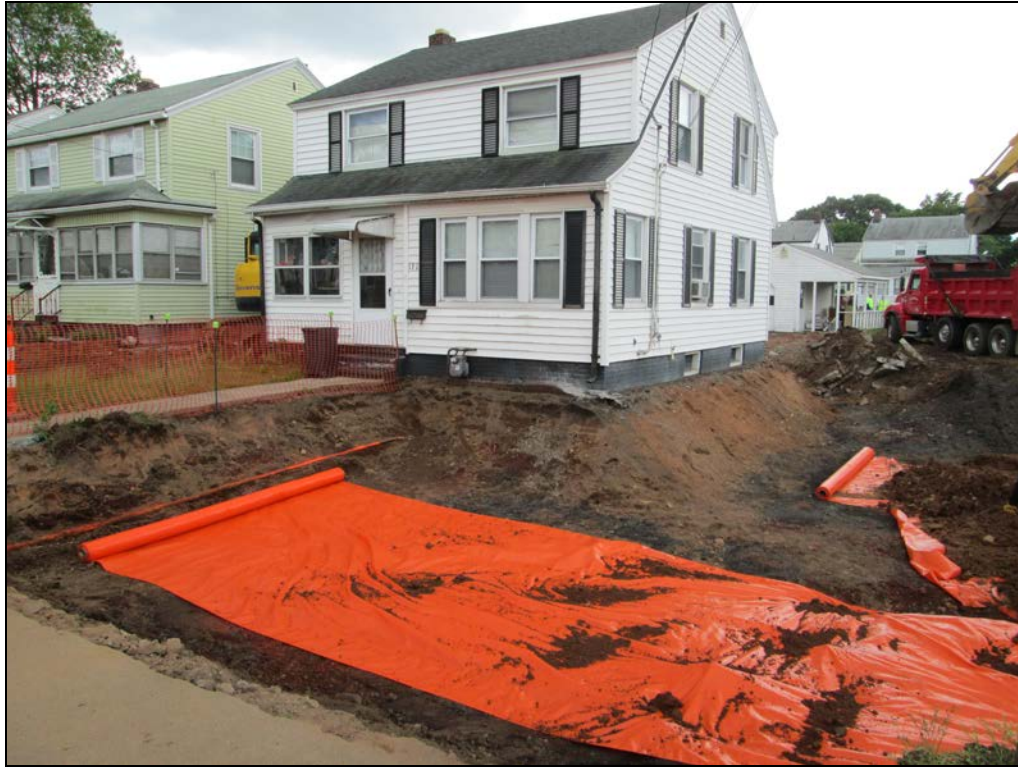
View looking southeast at excavated front and side yard during placement of marker barrier.