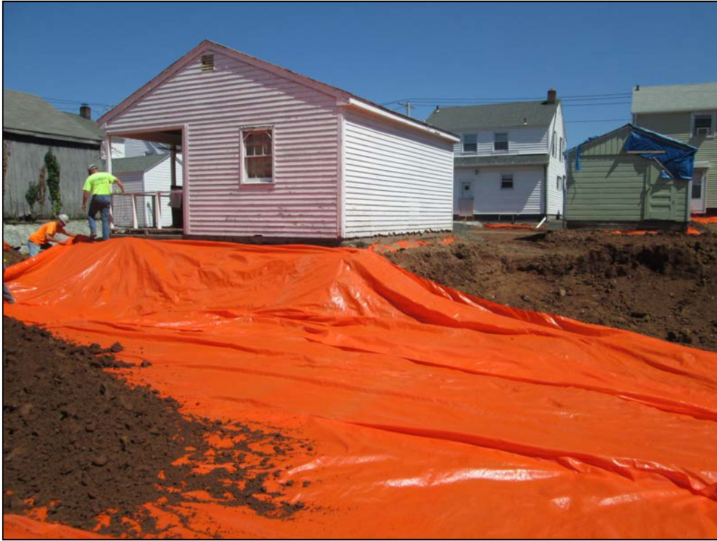
View looking north at marker barrier being installed in back yard.