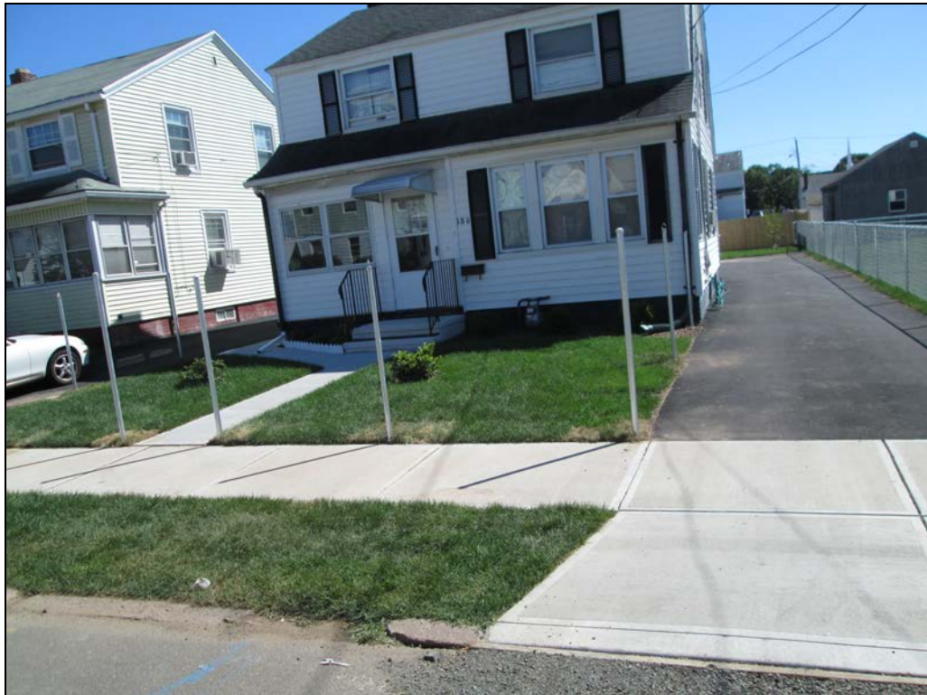
View looking south at partially restored front yard.