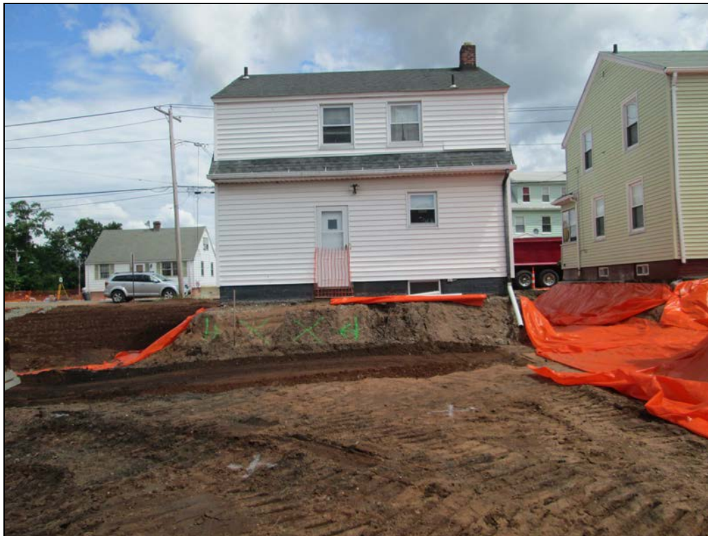
View looking north at excavated back yard.