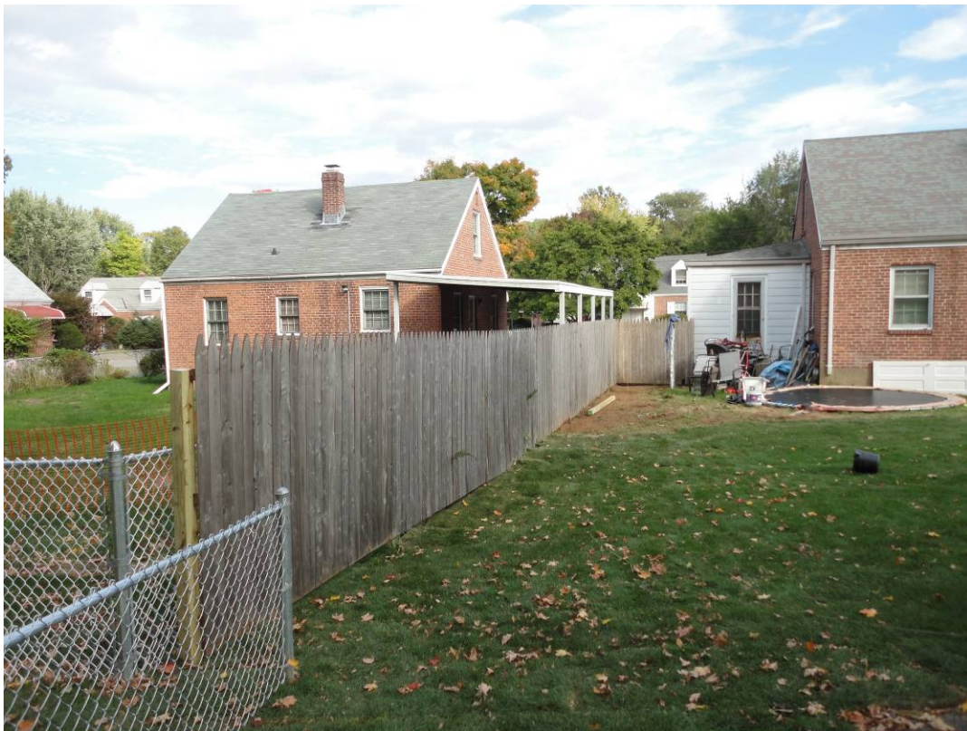
View looking northeast at back corner of 18 North Sheffield St. Excavation was limited to area of new fencing.