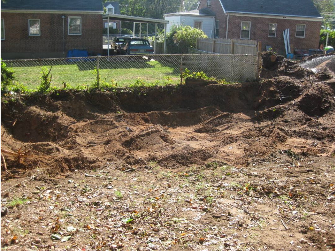
View looking east at excavation extending to back portion of backyard at 18 North Sheffield Street.