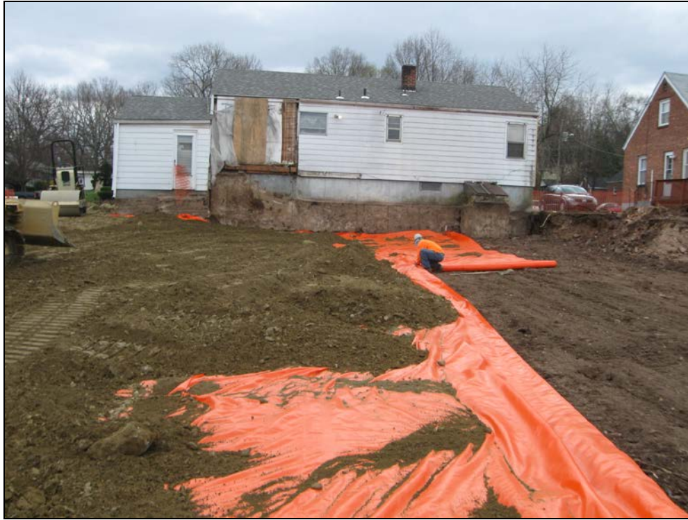
View looking east at marker barrier being installed in the back yard.