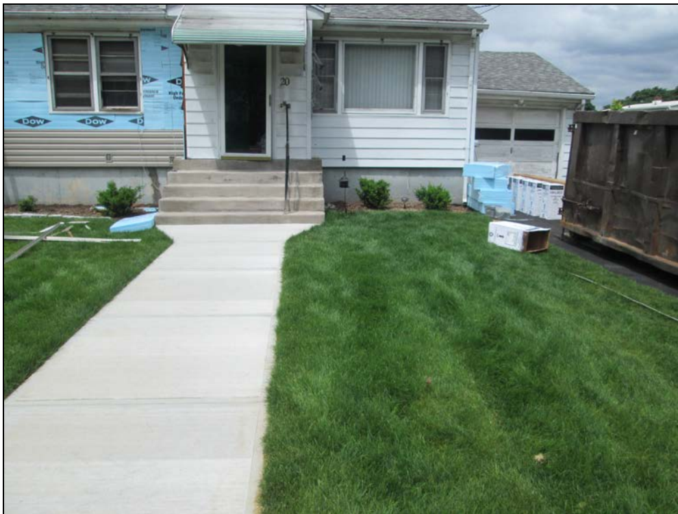
View looking west at restored front yard.