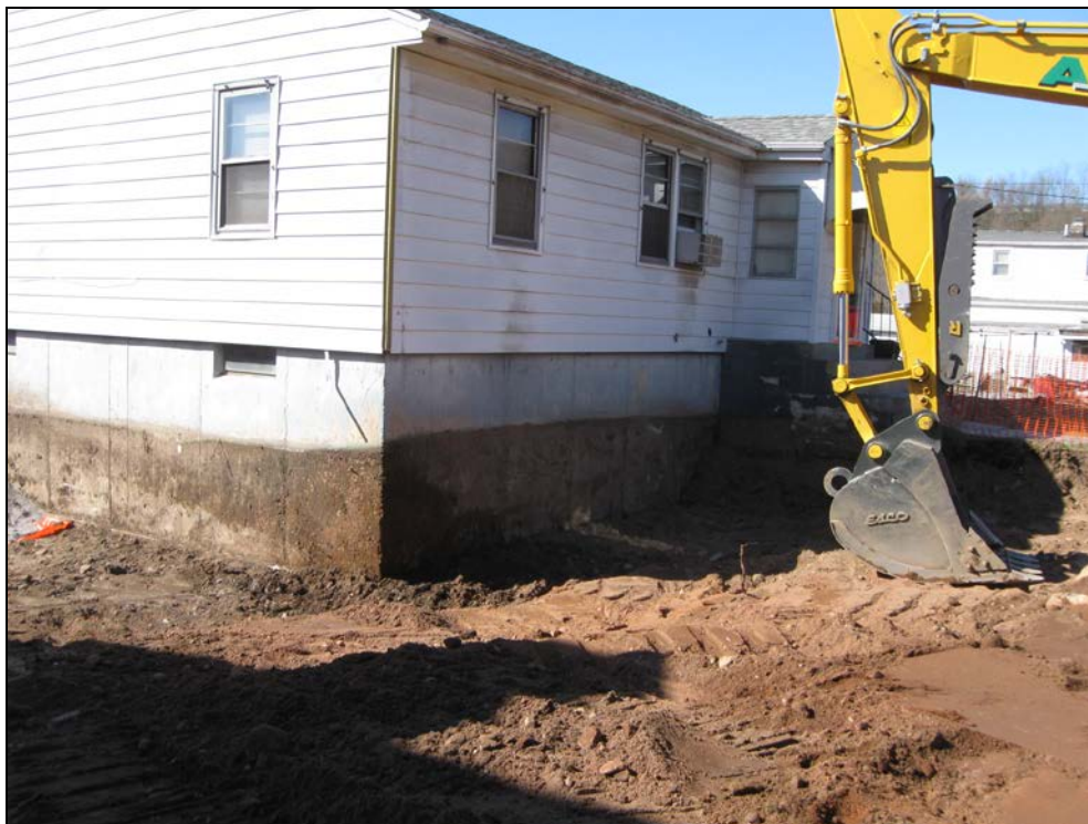
View looking northwest at excavated front yard prior to marker barrier being installed.