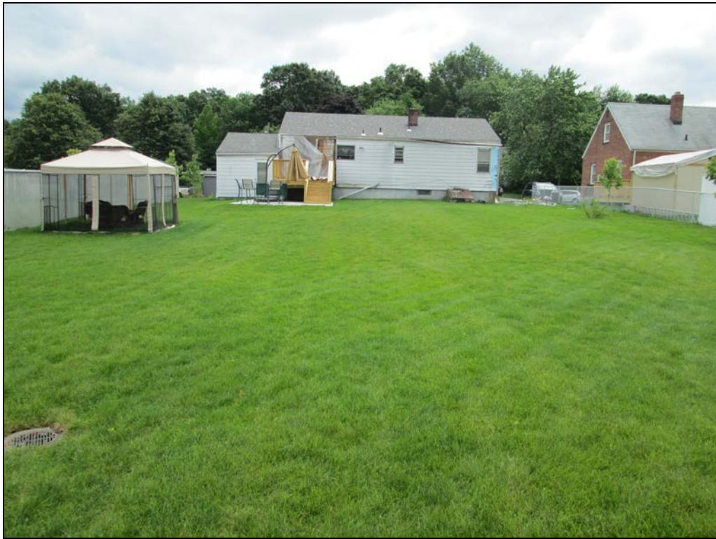
View looking east at restored back yard.