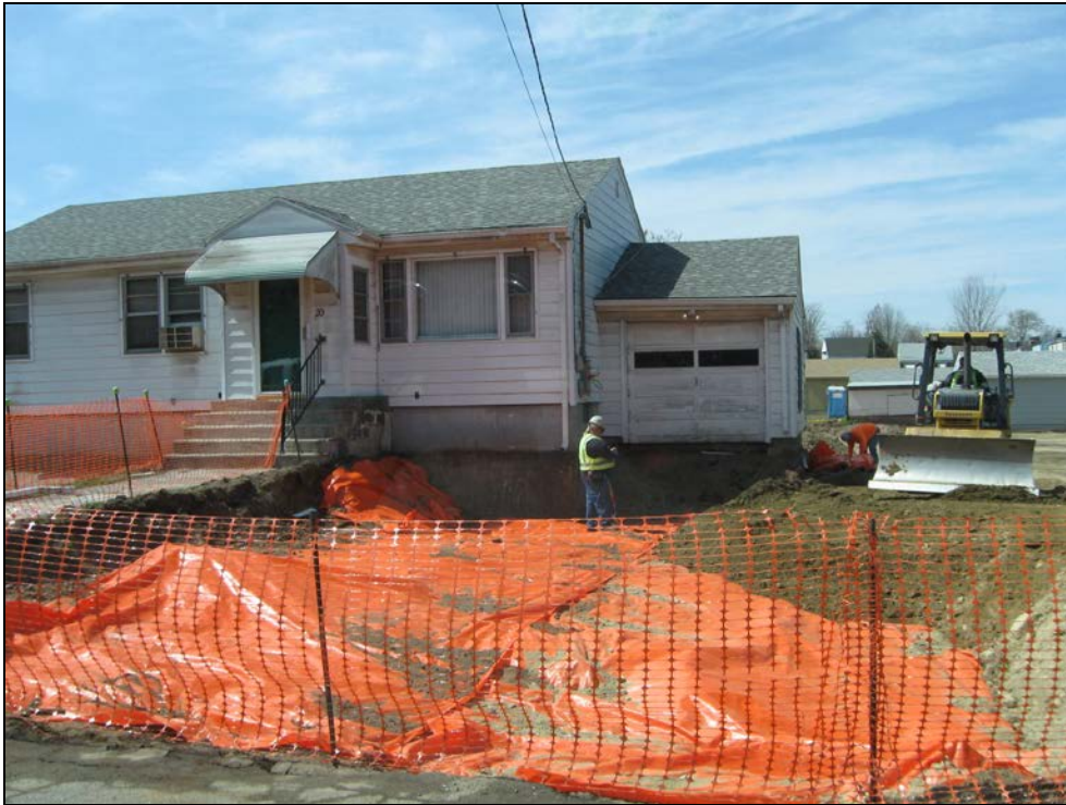
View looking west at excavation of front yard.