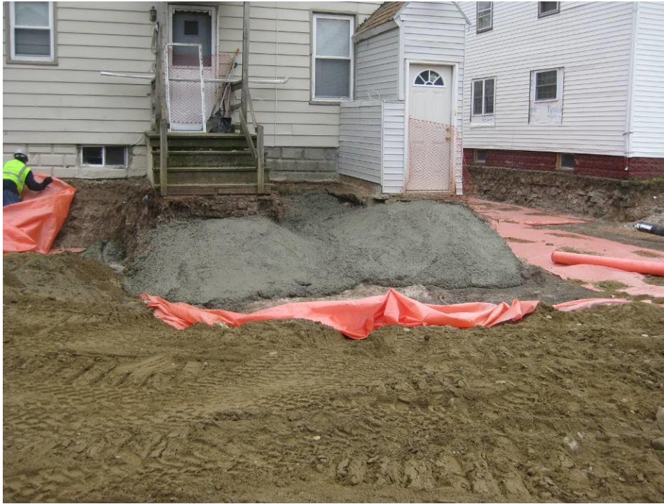
View looking West at excavated back yard following placement of marker barrier