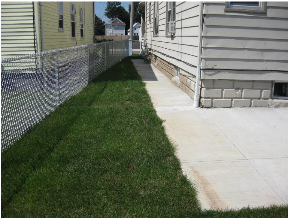
View looking West at restored side yard on South side of house