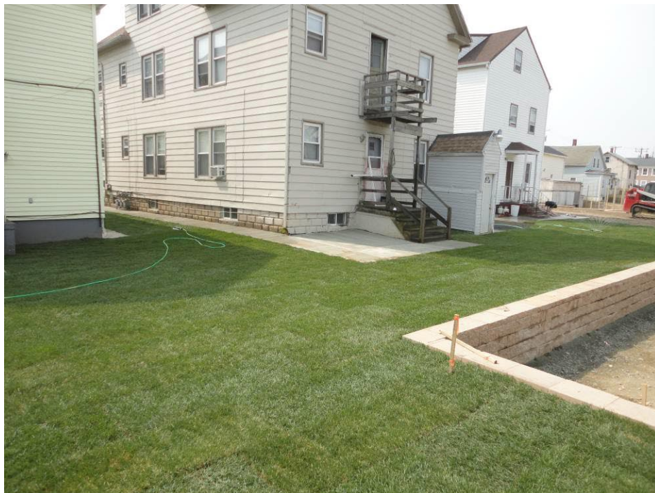
View looking Northwest at restored back yard