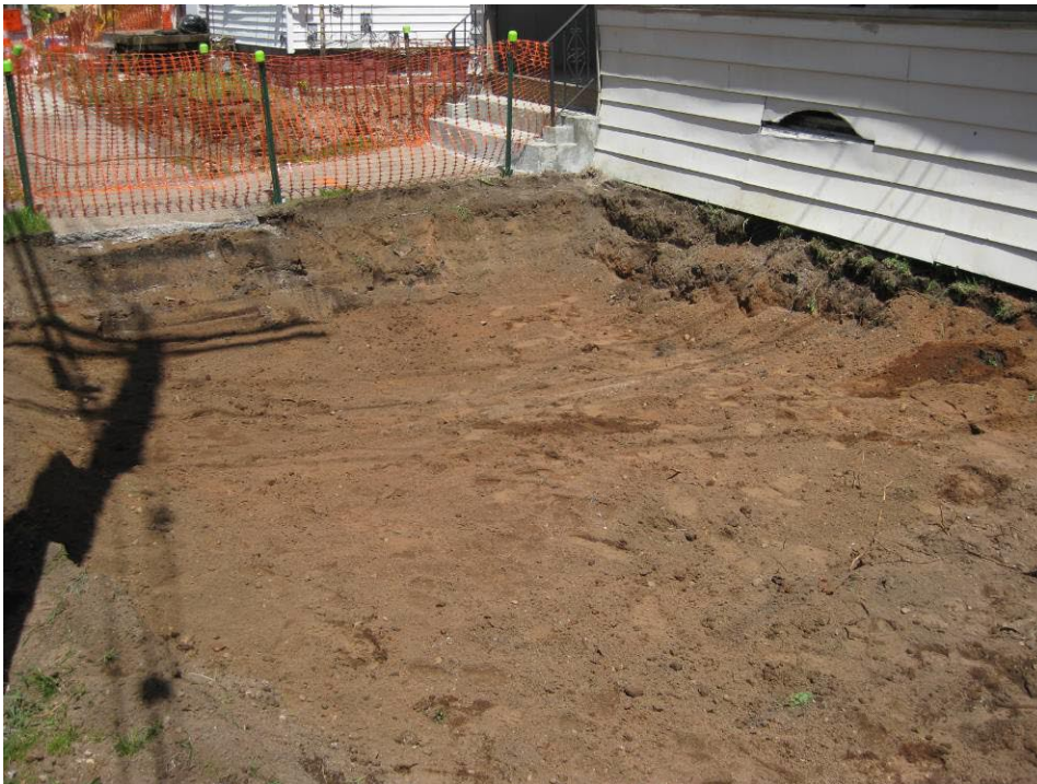
View looking North at excavated front yard