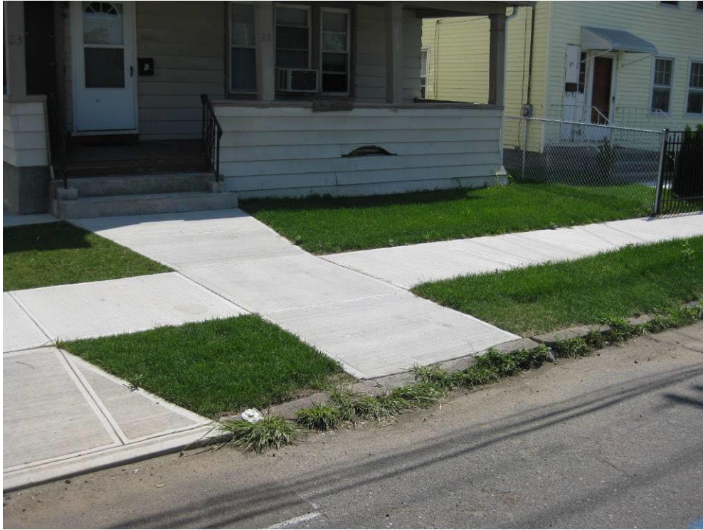
View looking Southeast at restored front yard