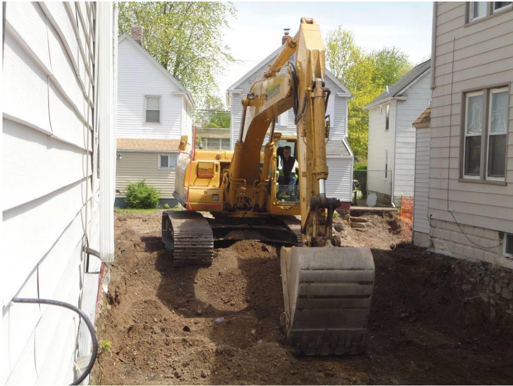
View looking East at excavation of side yard on North side of house