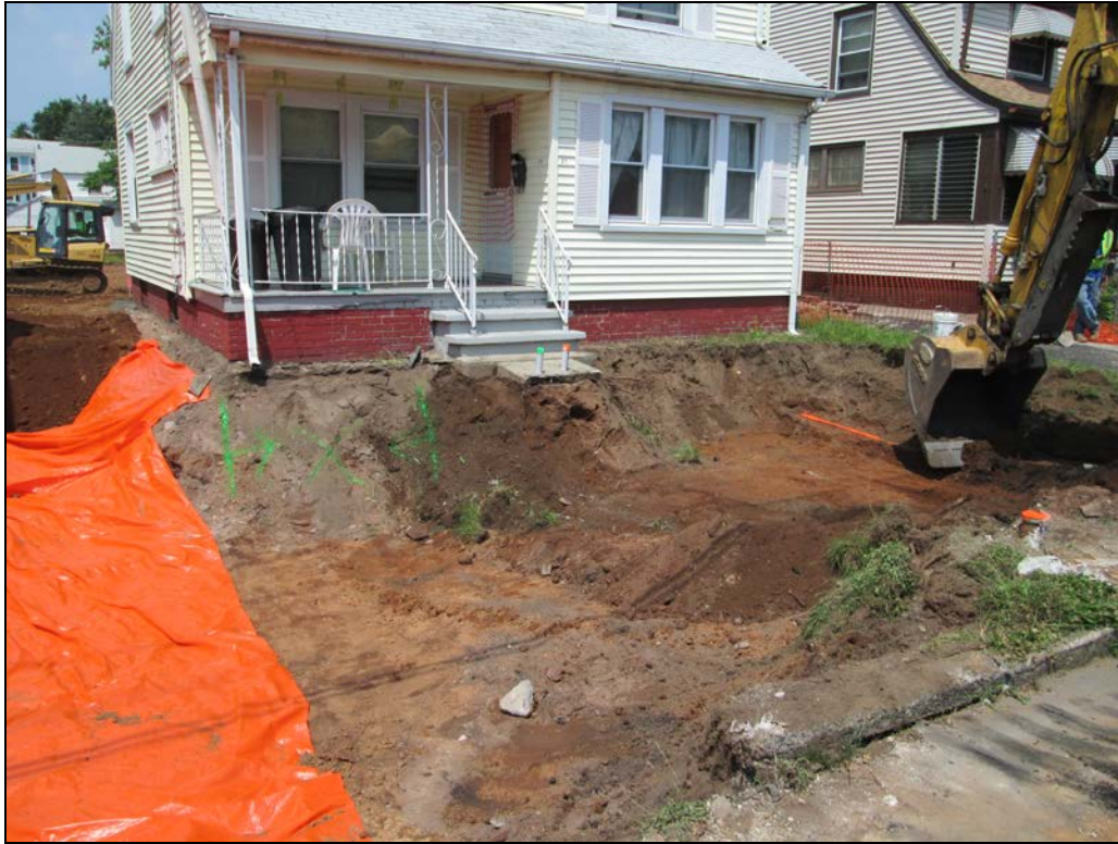
View looking north at excavated front yard prior to placement of marker barrier.