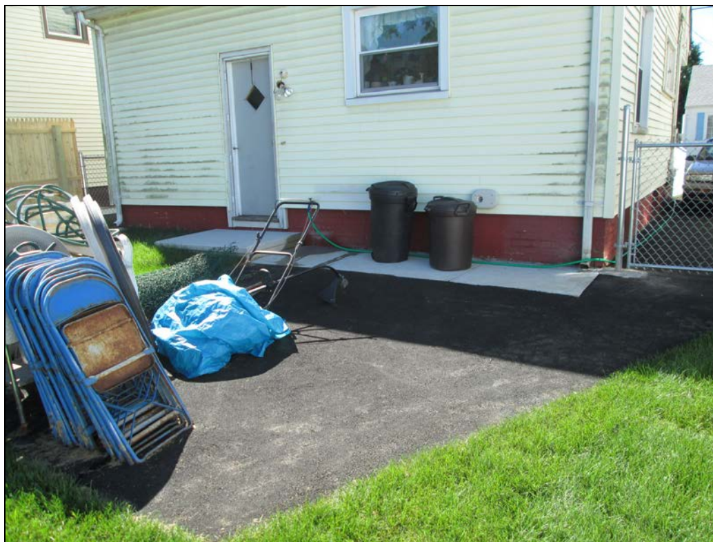
View looking southeast at restored back parking area.