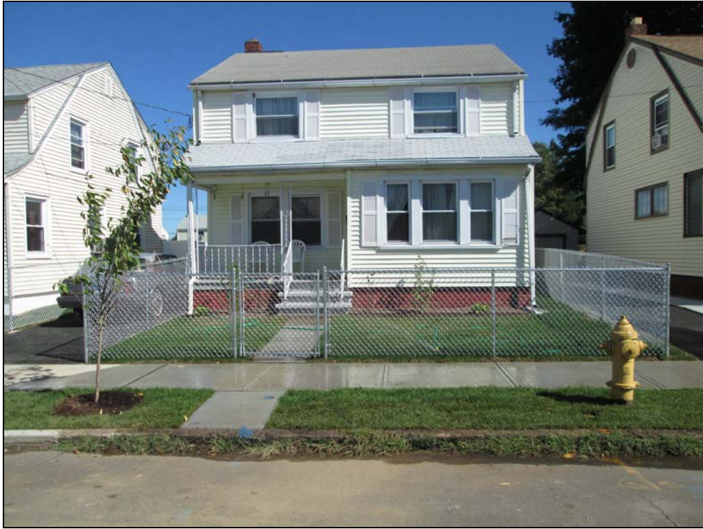
View looking north at restored front yard.