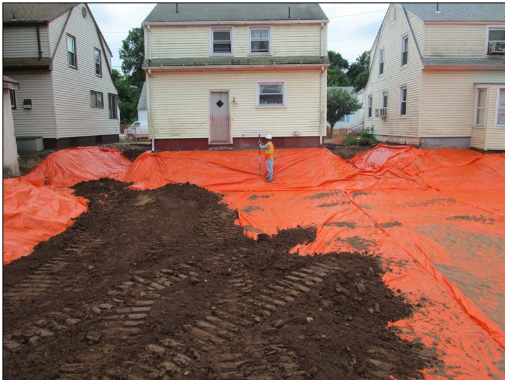
View looking south at partially backfilled yard with marker barrier covering fill left in place.