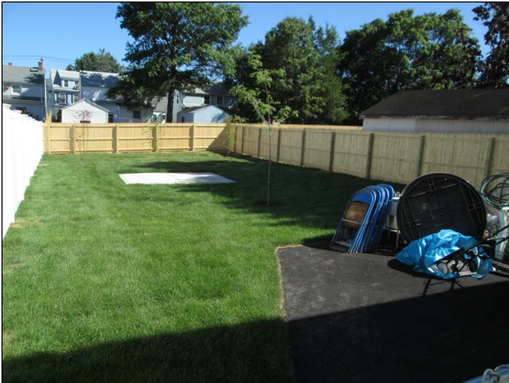
View looking north at restored back yard.