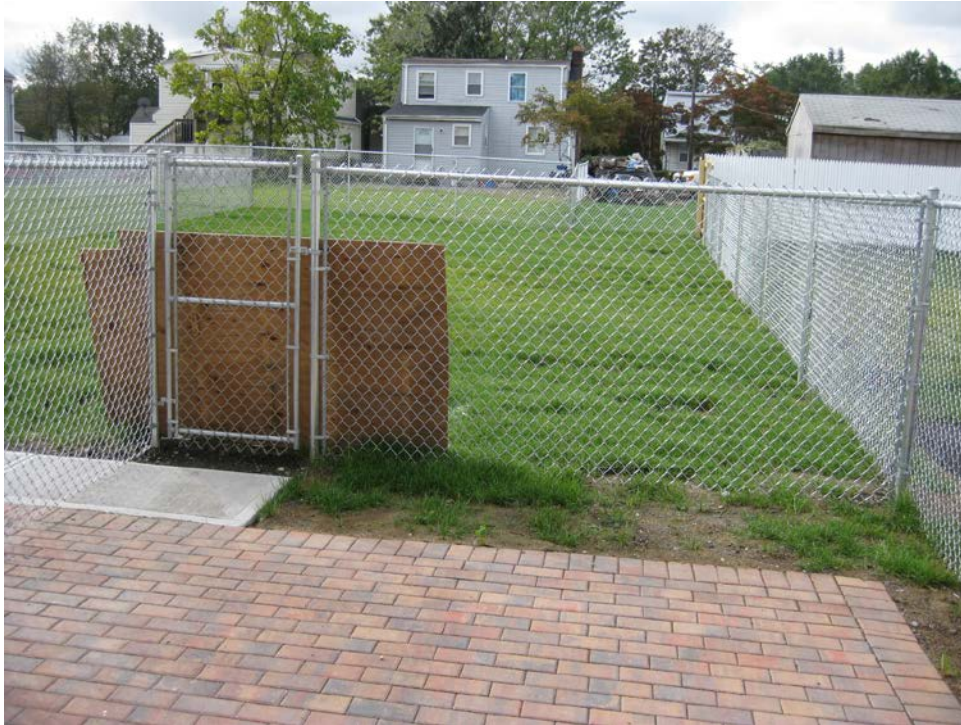
View looking South at partially restored back yard