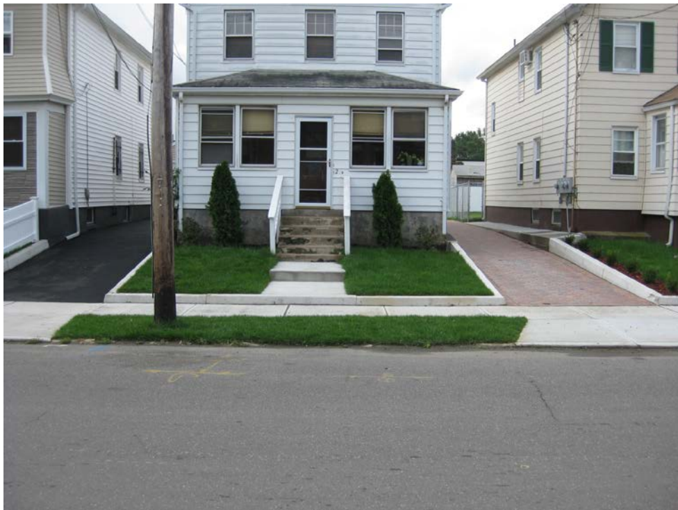
View looking Southeast at restored front of property