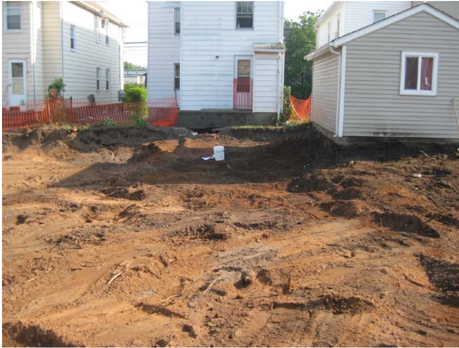
View looking North at excavated back yard