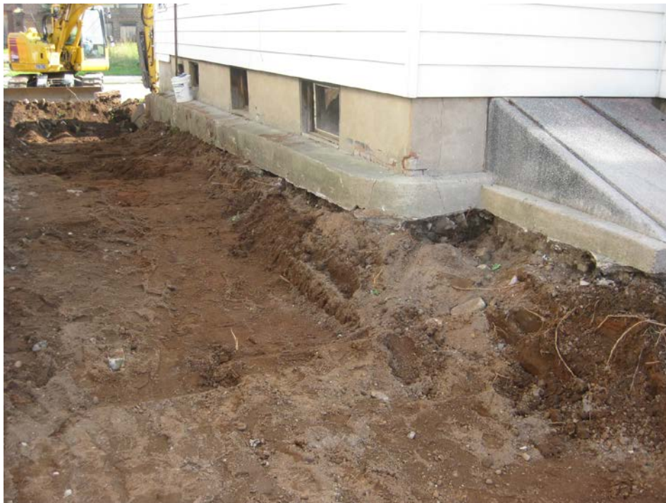
View looking Northeast at excavation along side of house