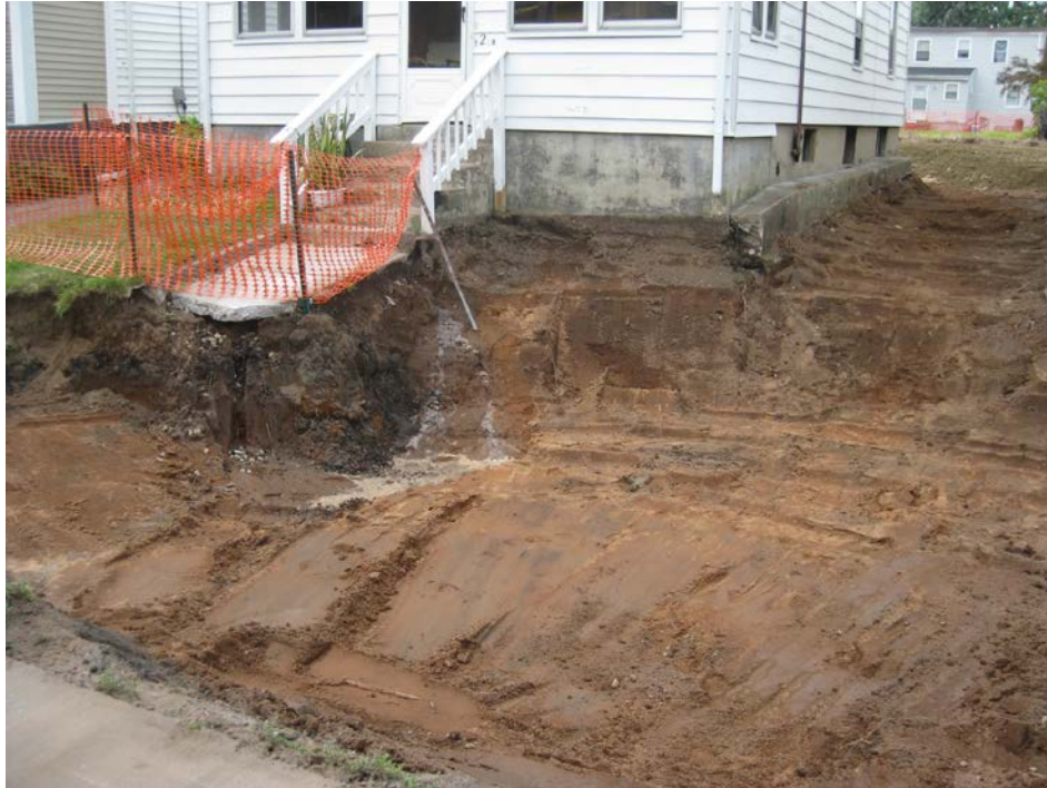
View looking Southeast at excavation along front and side of house