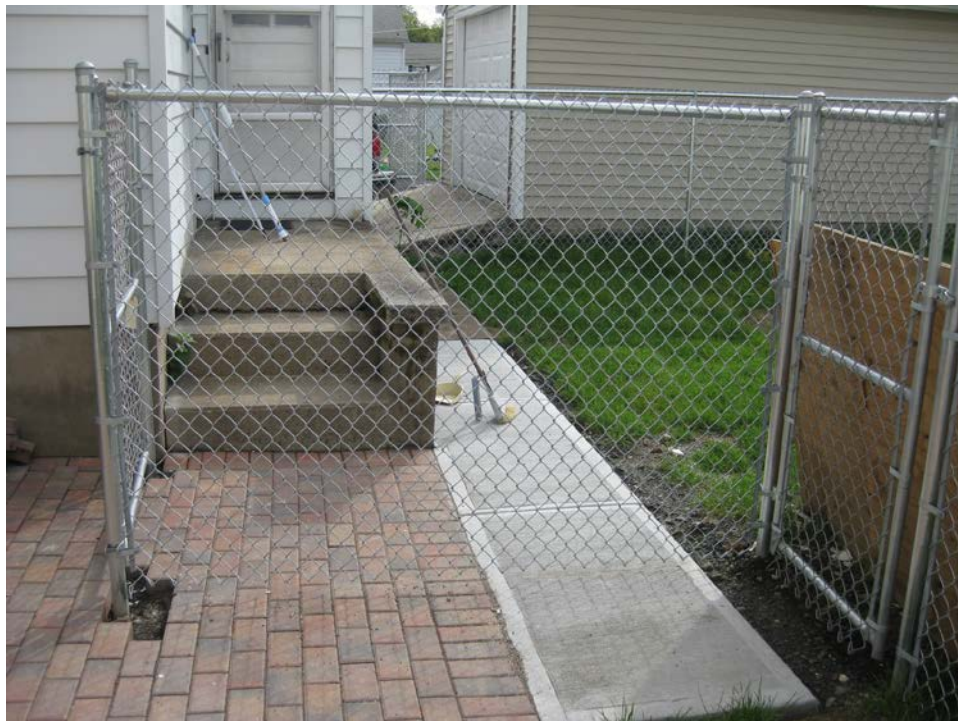
View looking East at partially restored back of house