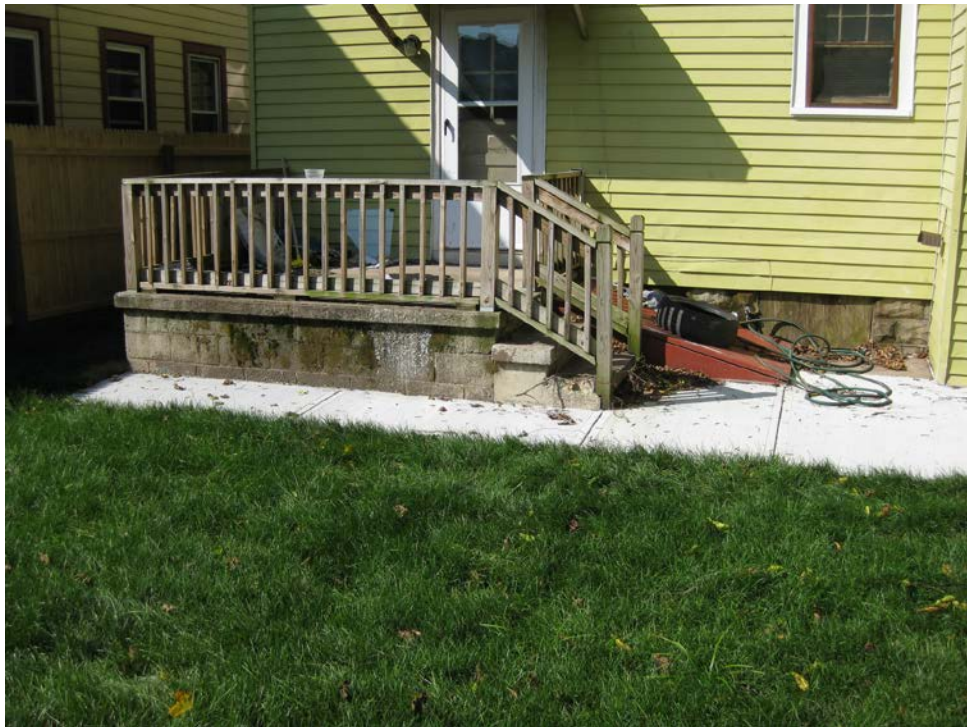
View looking West at restored back of property