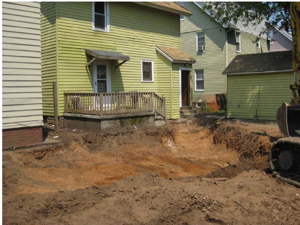
View looking Northwest towards back of house