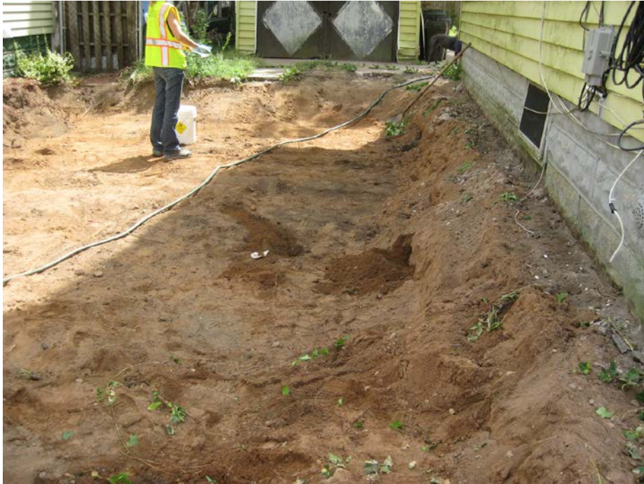
View looking East at excavated side yard