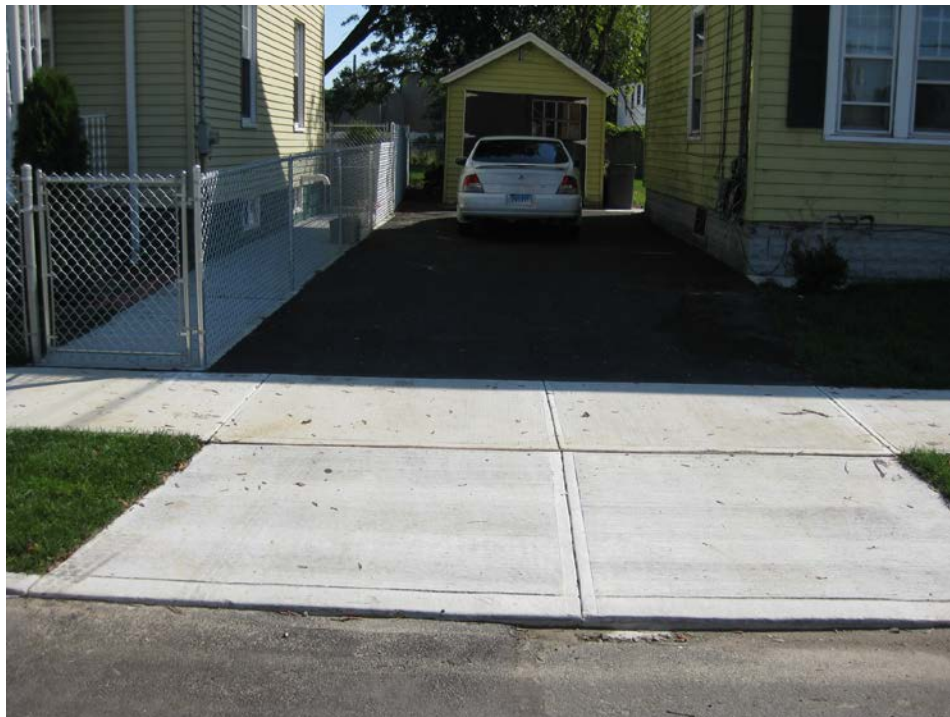
View looking East at restored driveway