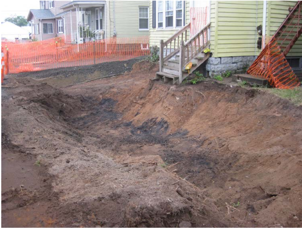
View looking Northeast at excavated front yard