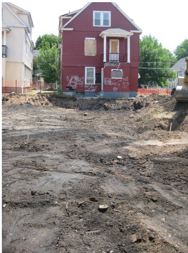
View looking East at at excavated back yard