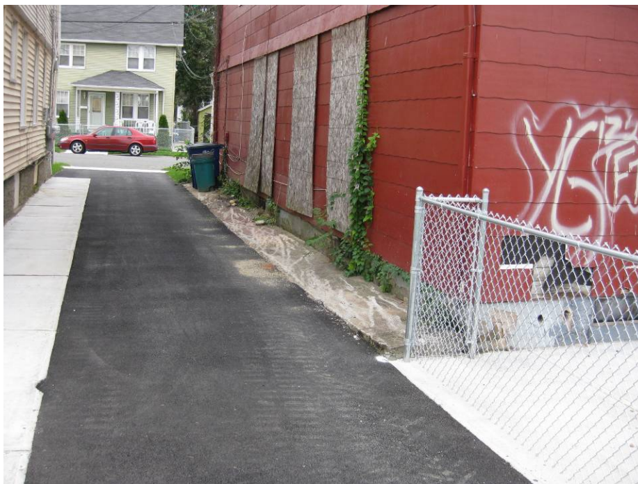
View looking East at restored driveway