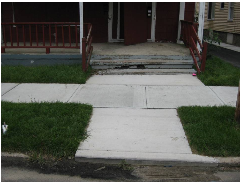
View looking West at restored front yard