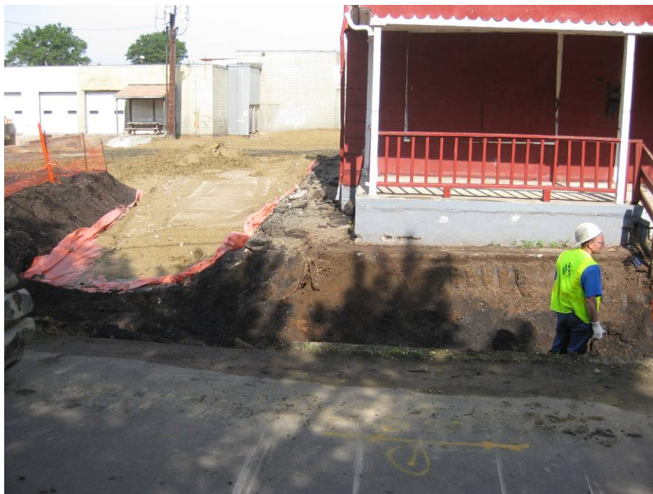
View looking West at excavated front yard