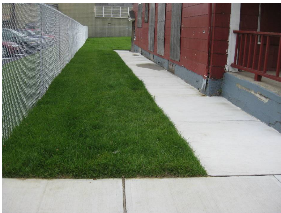
View looking West at restored side yard