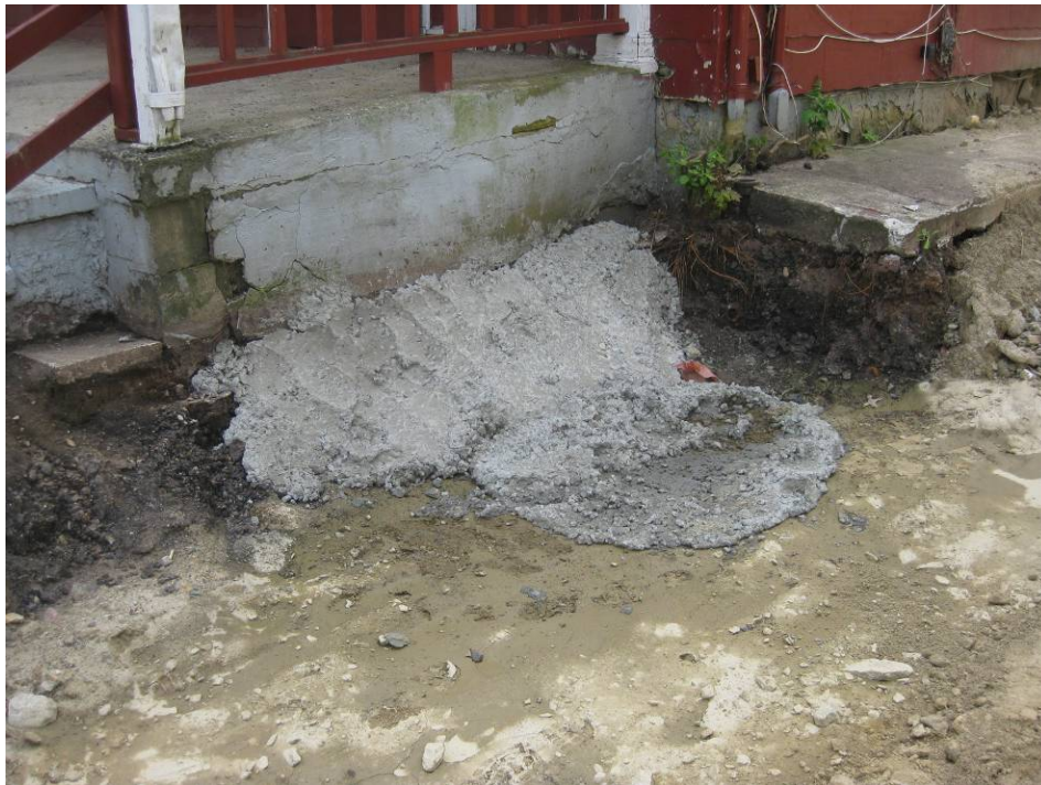
View looking Southwest at concrete along front porch