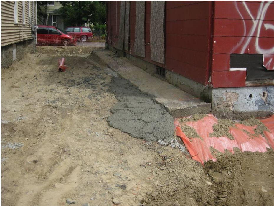
View looking East at backfilled side of house after placement of concrete and fabric