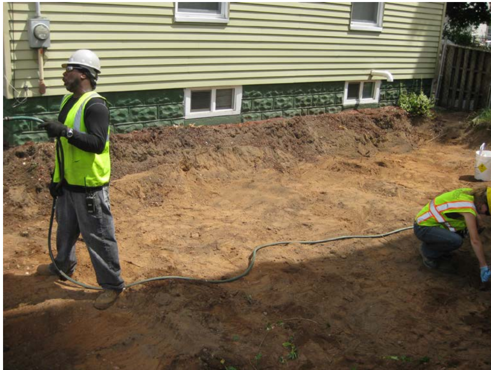
View looking Northeast at excavated side yard