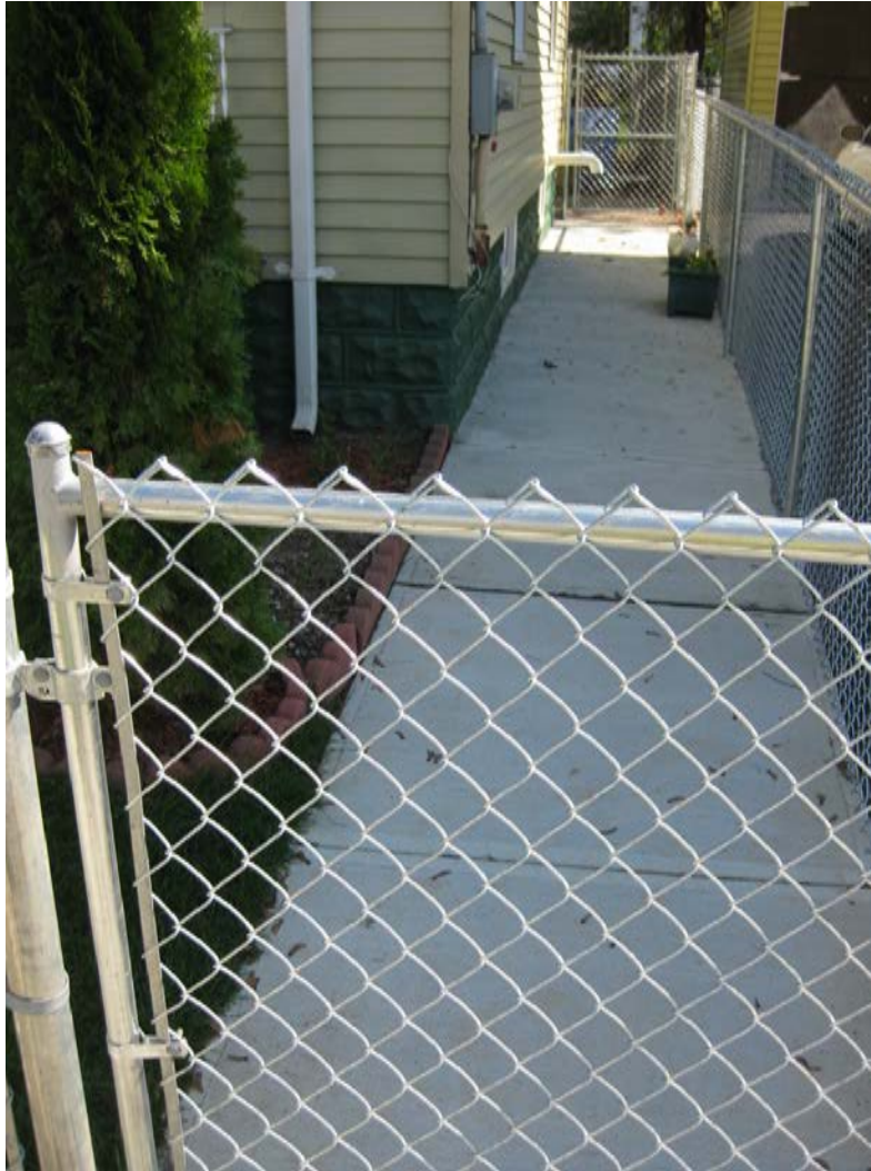
View looking East at restored side yard