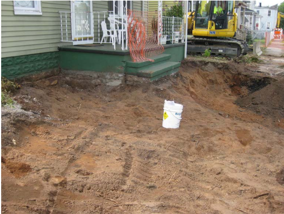
View looking South at excavated front yard