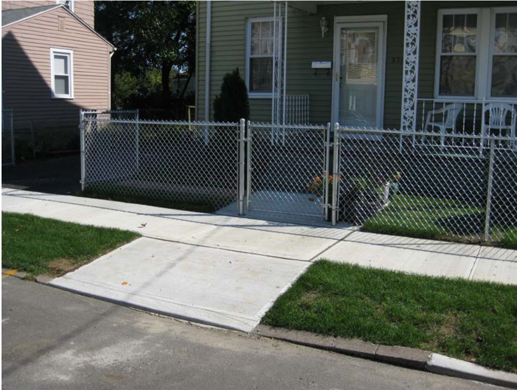
View looking East at restored front yard