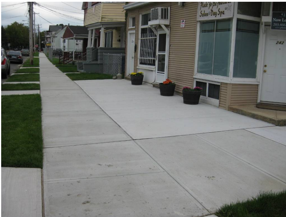
View looking South restored front of property along Butler Street