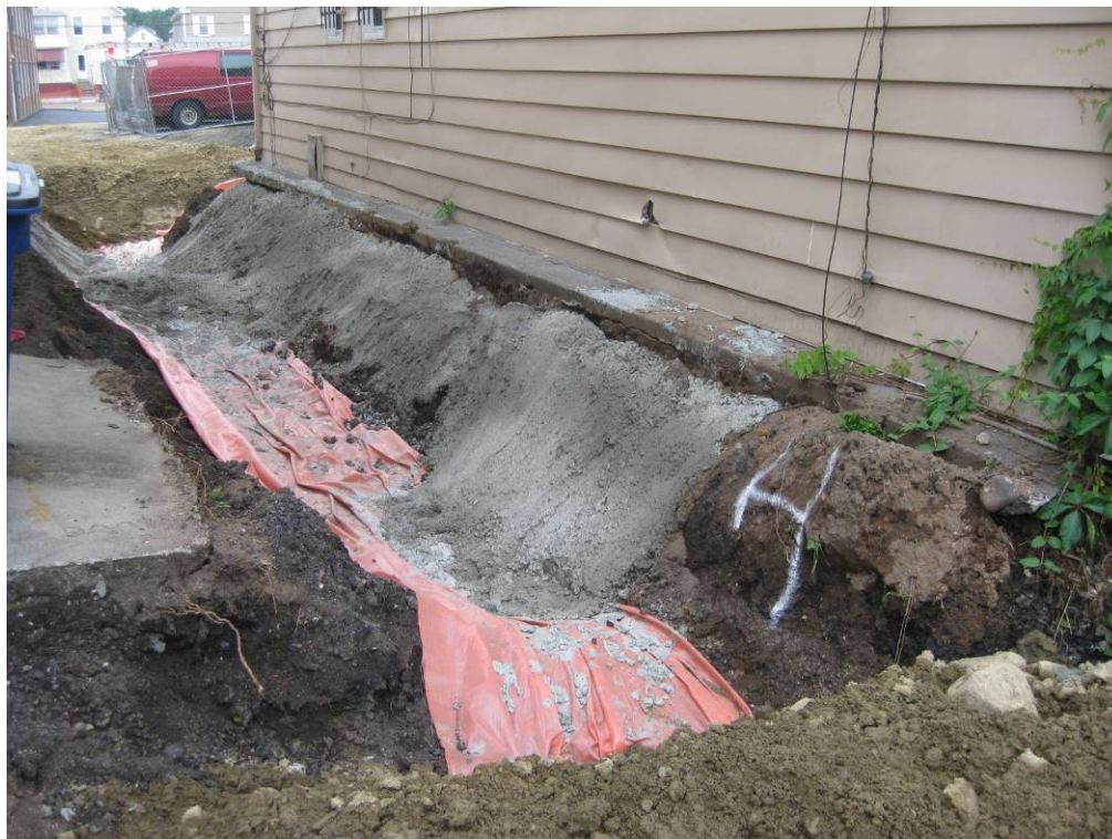
View looking Northwest at side yard following placement of marker barrier