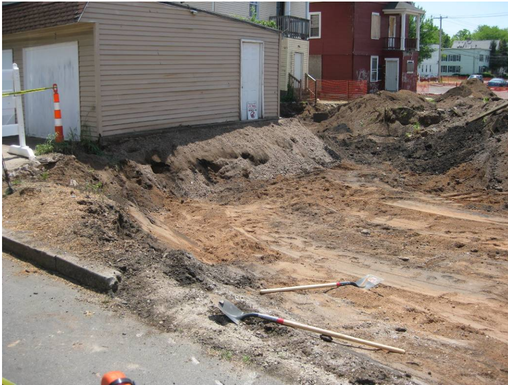
View looking Southeast at excavated parking area in the western portion of the property