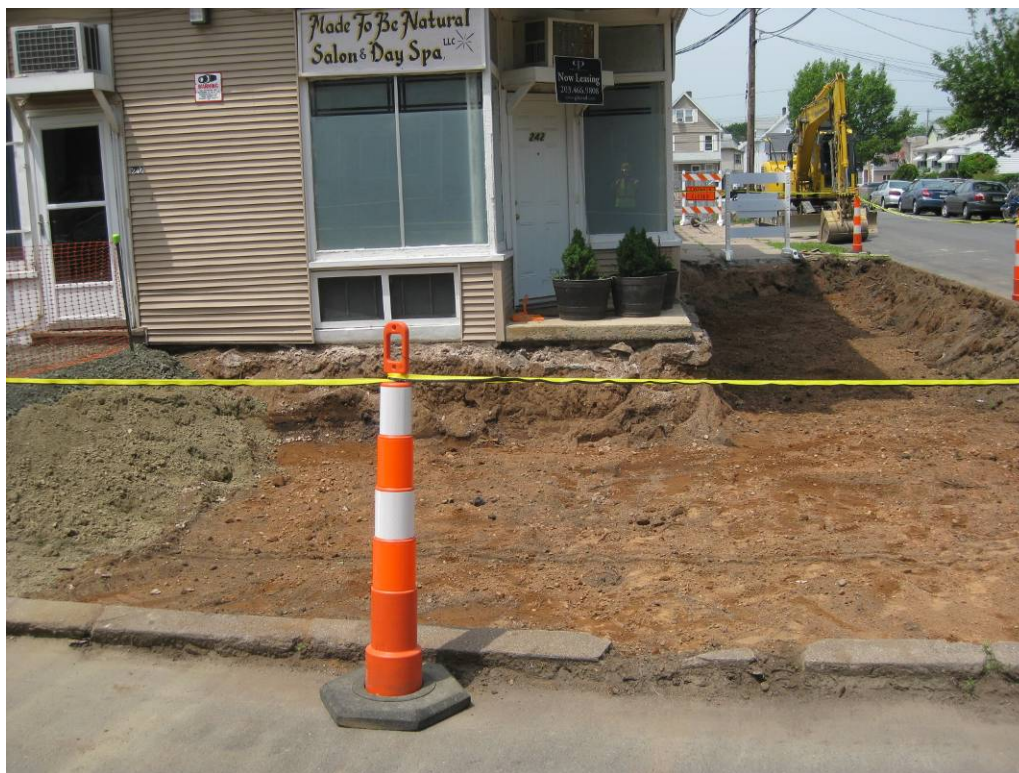
View looking Northwest at partially backfilled property