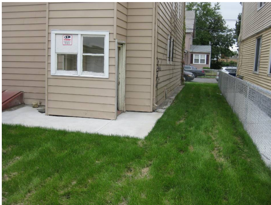
View looking East at partially restored side yard