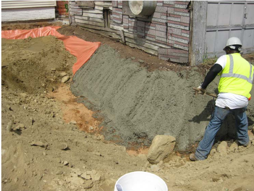
View looking Northeast at concrete along garage