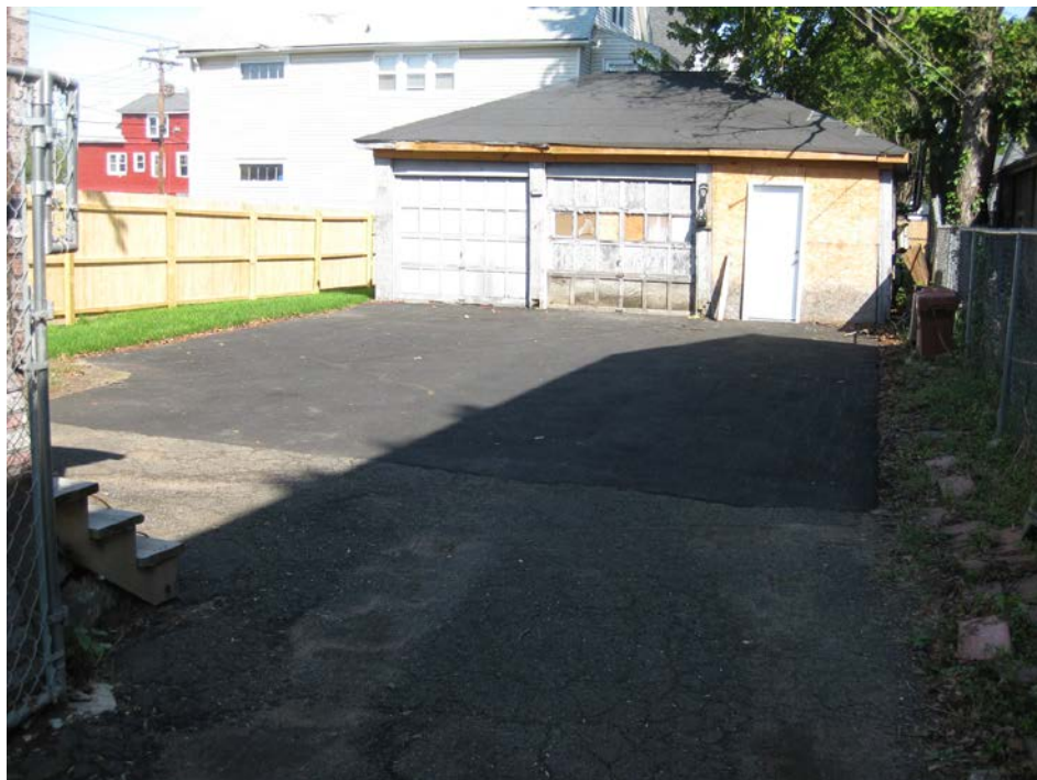
View looking North at restored parking area