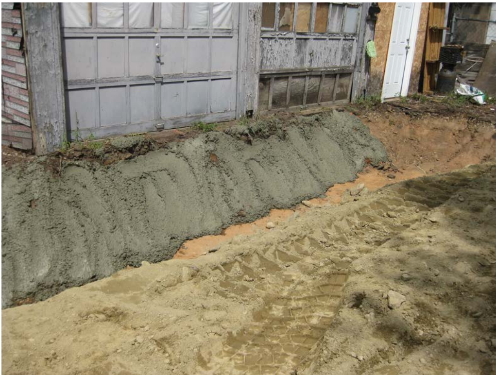
View looking Northeast at concrete along garage