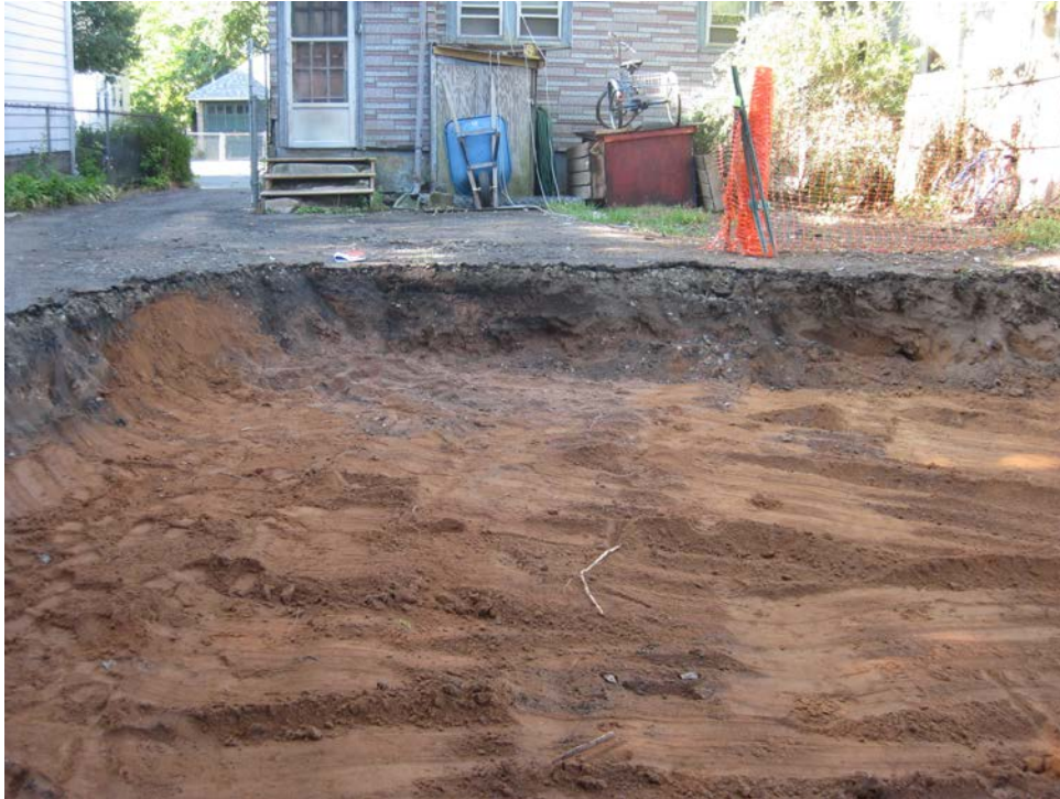
View looking South towards back of house