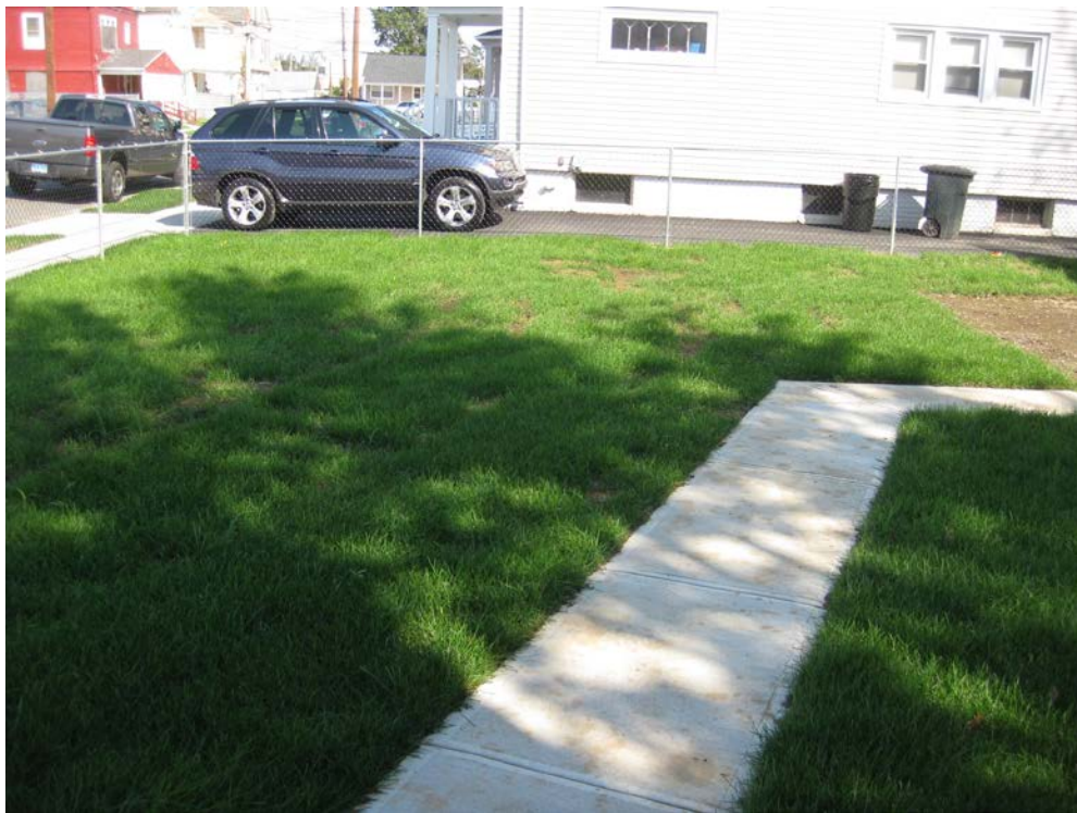
View looking North at restored yard