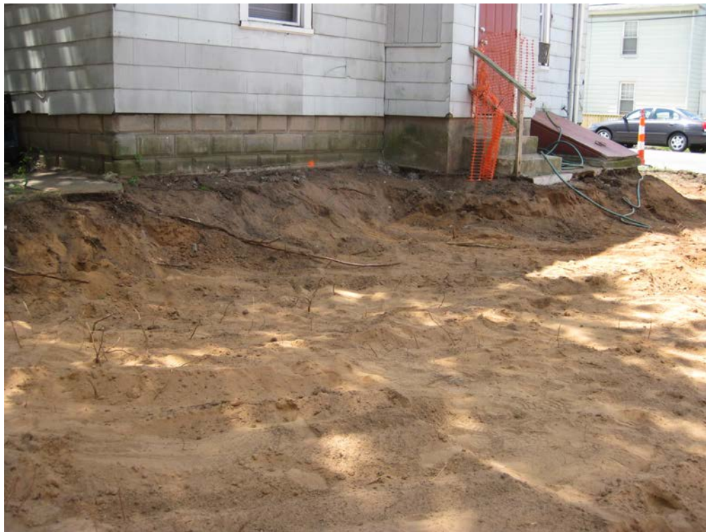
View looking Southwest at excavation along side of house