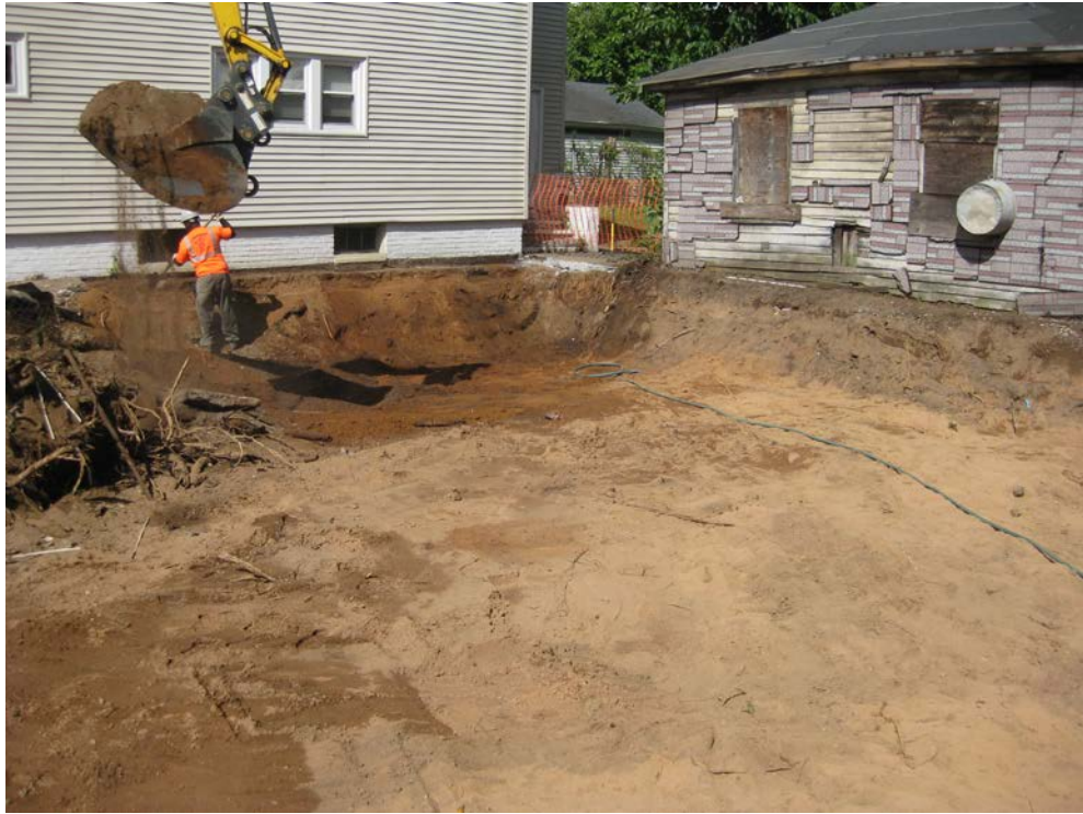
View looking Northeast at excavated yard