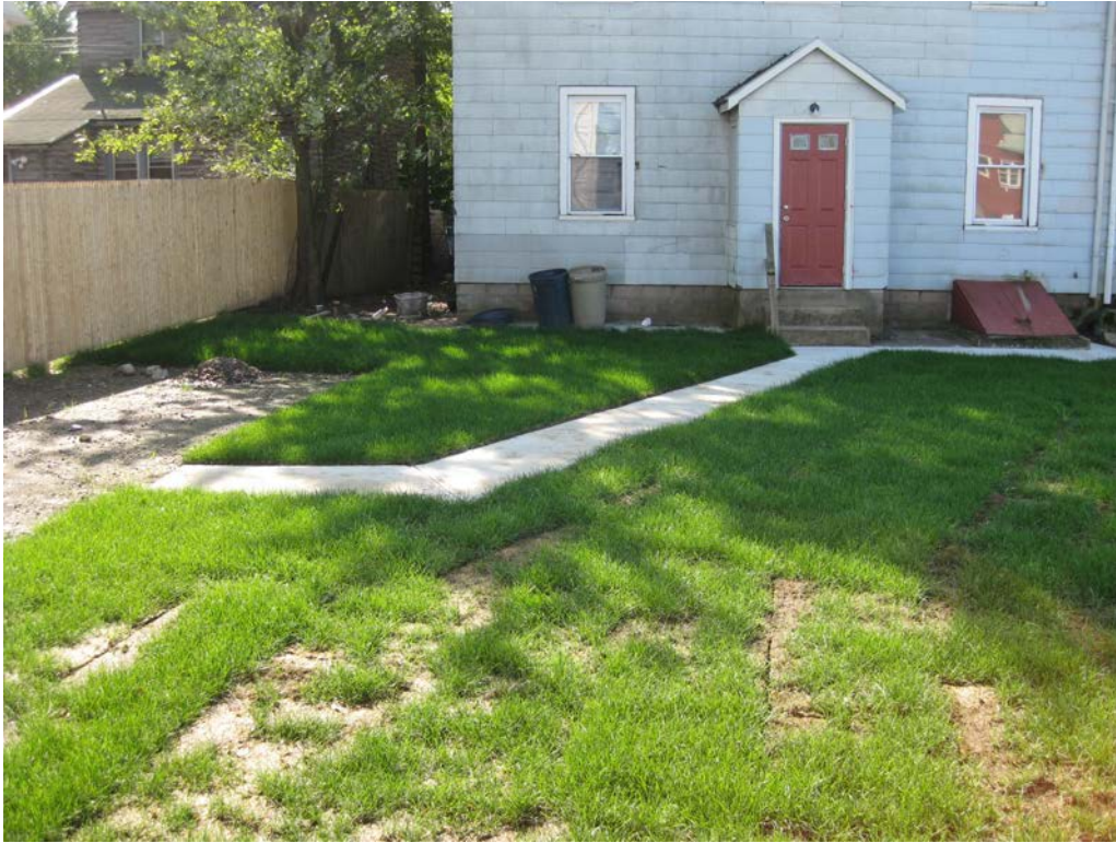
View looking South towards back of house