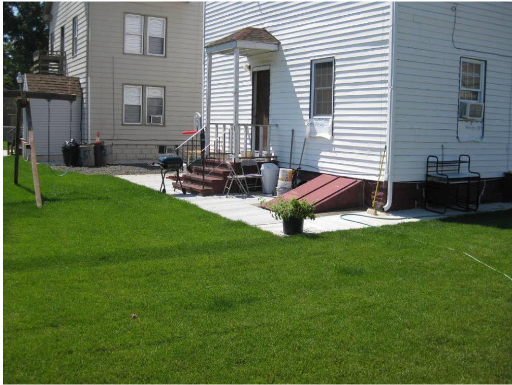
View looking Southwest at restored back yard