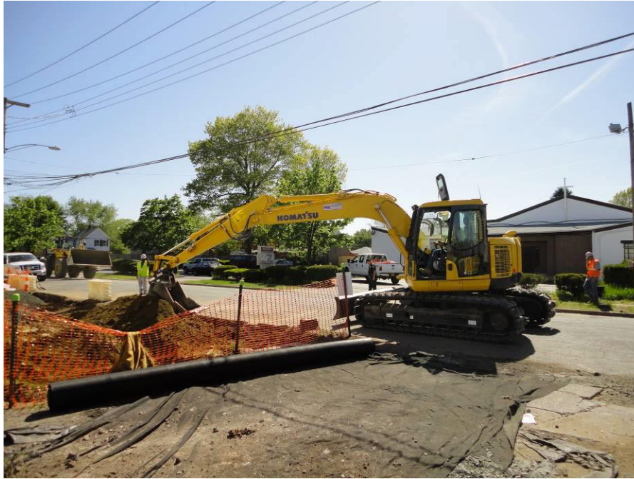
View looking Southwest at excavation of front yard