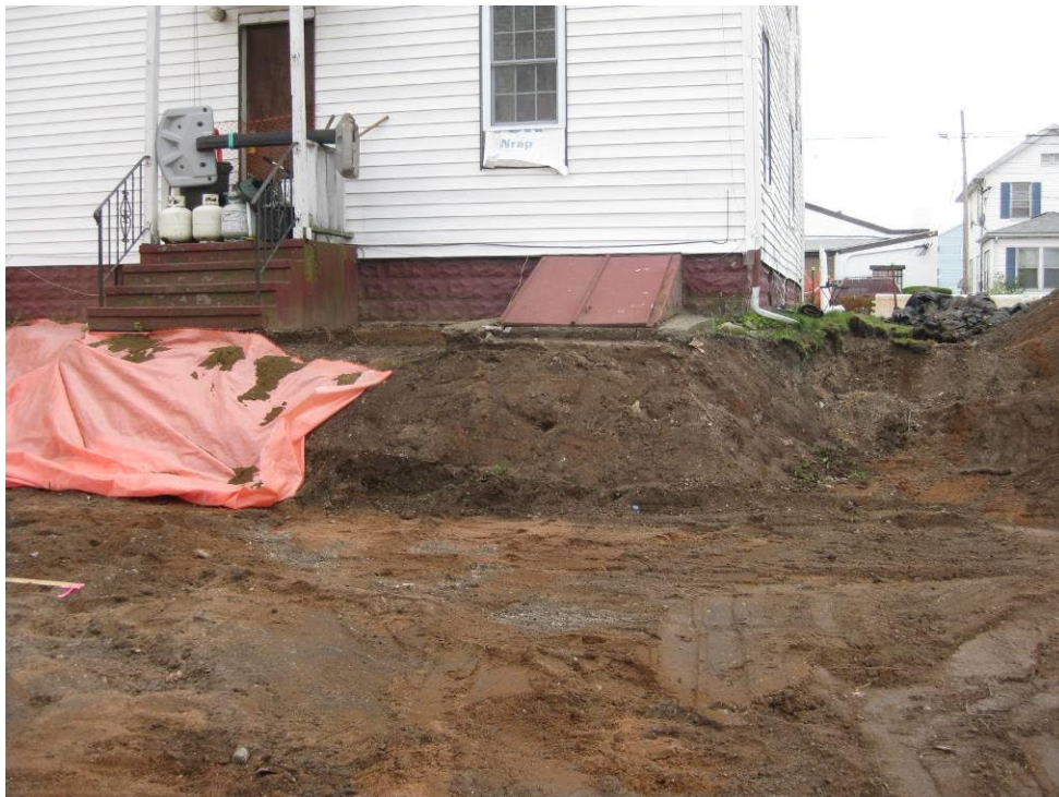
View looking West at excavated back yard as marker barrier is being placed