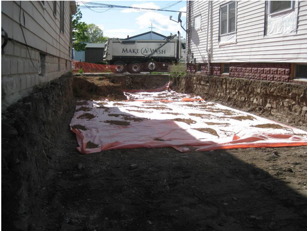
View looking West at excavated side yard on South side of house