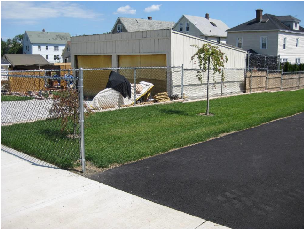
View looking Northeast at restored driveway and side yard