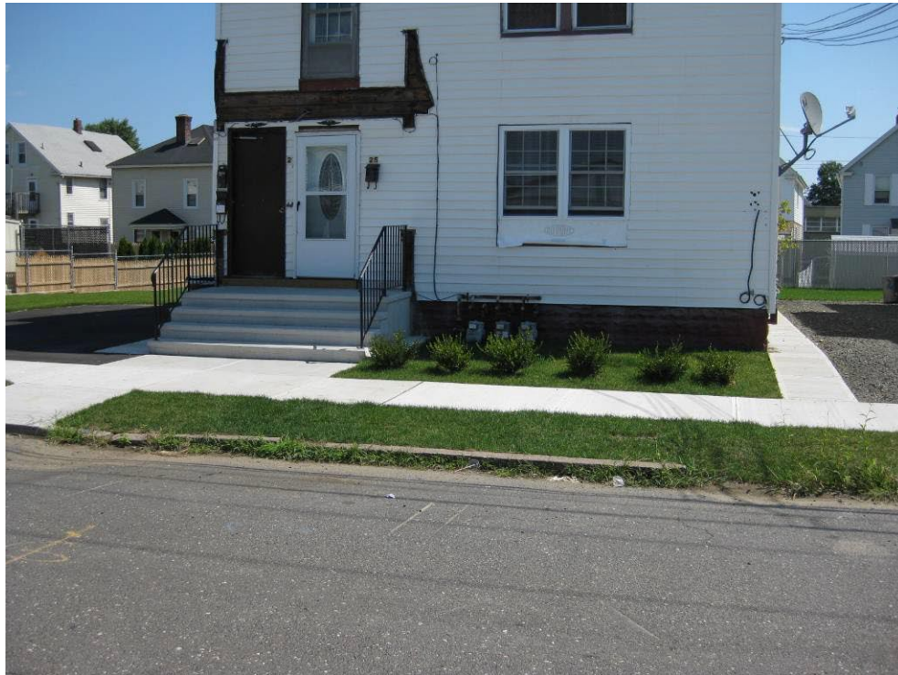
View looking Northwest at restored front yard