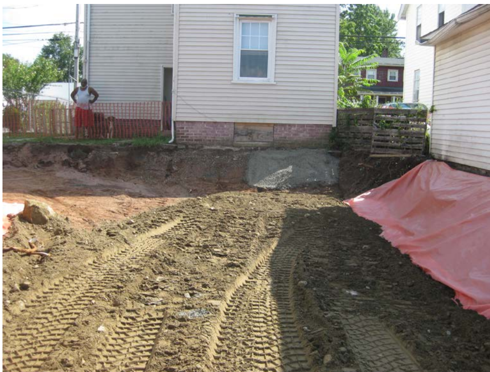
View looking South at excavated back yard and concrete marker barrier along back of house