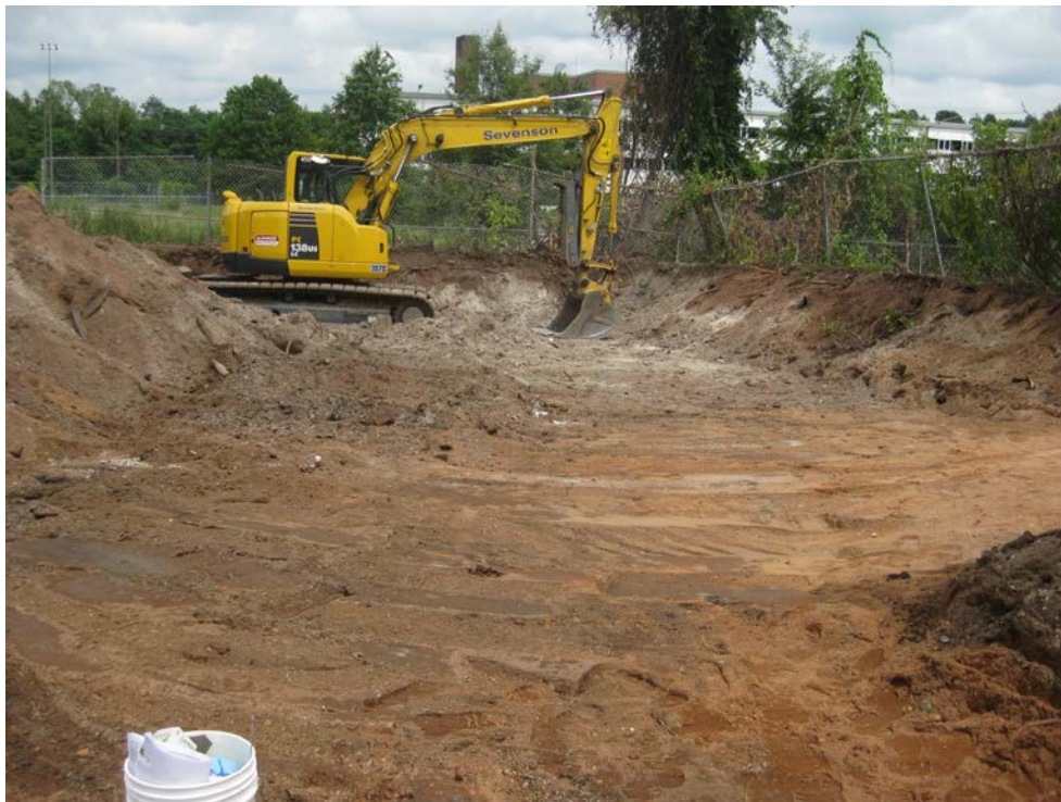
View looking North at excavated back yard