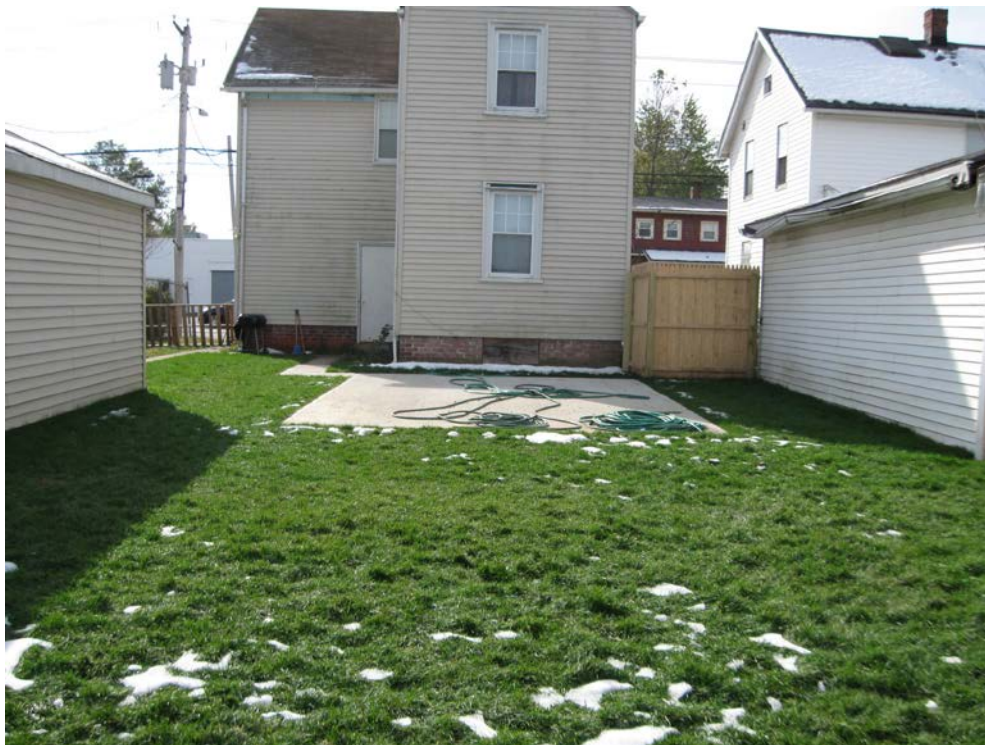
View looking South at restored back of house