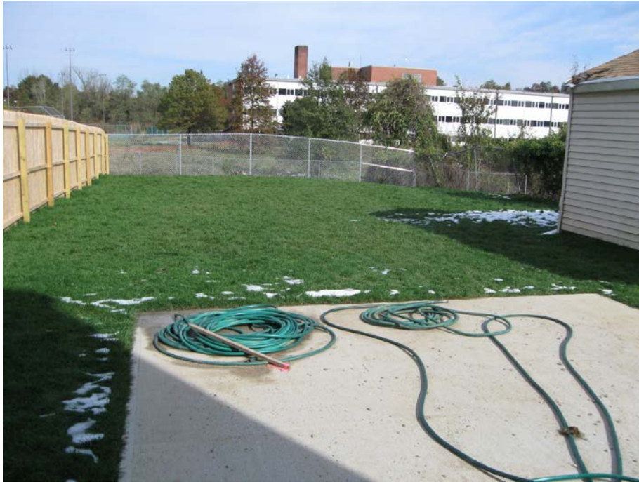
View looking North at restored back yard