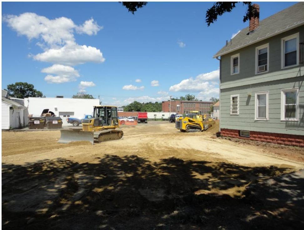
View looking North at property during placement of backfill