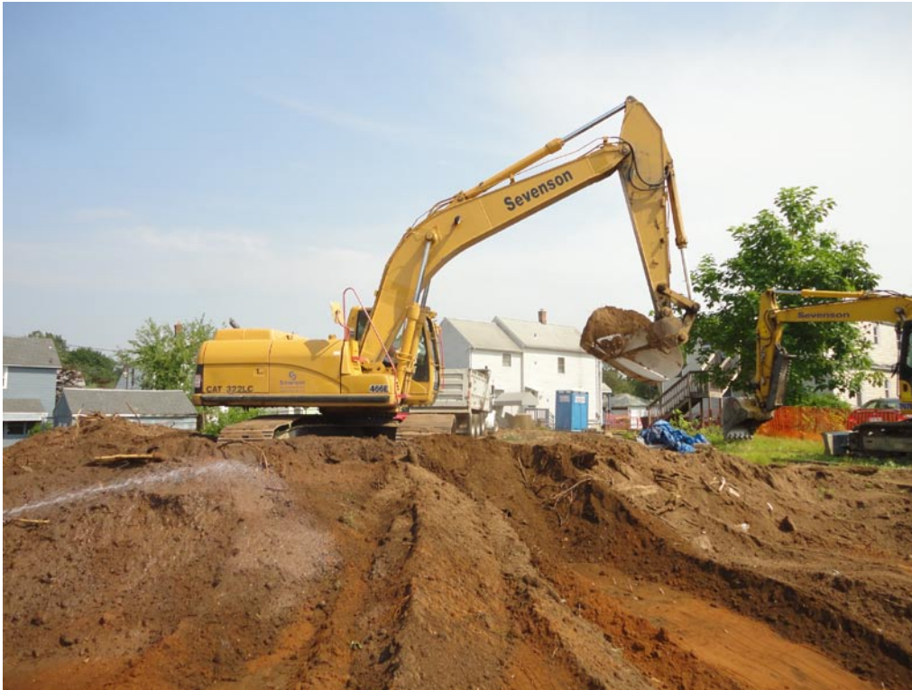
View looking South at excavation of parking area