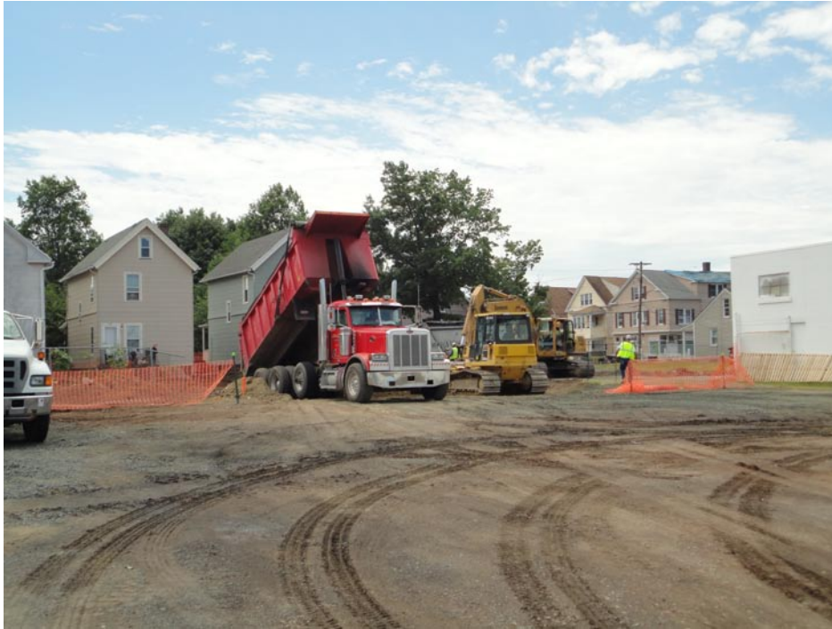
View looking Southeast during placement of backfill