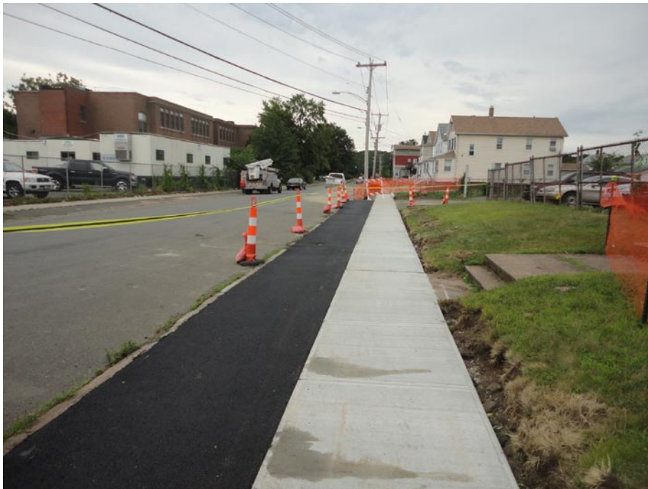
View looking East along Morse Street at restored sidewalk