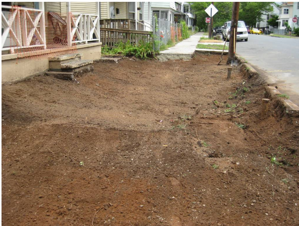
View looking East at excavated front yard in area between 267 and 265 Goodrich Street