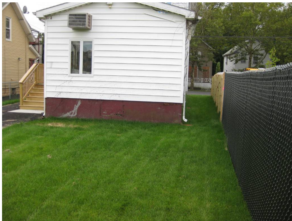
View looking South at restored back yard