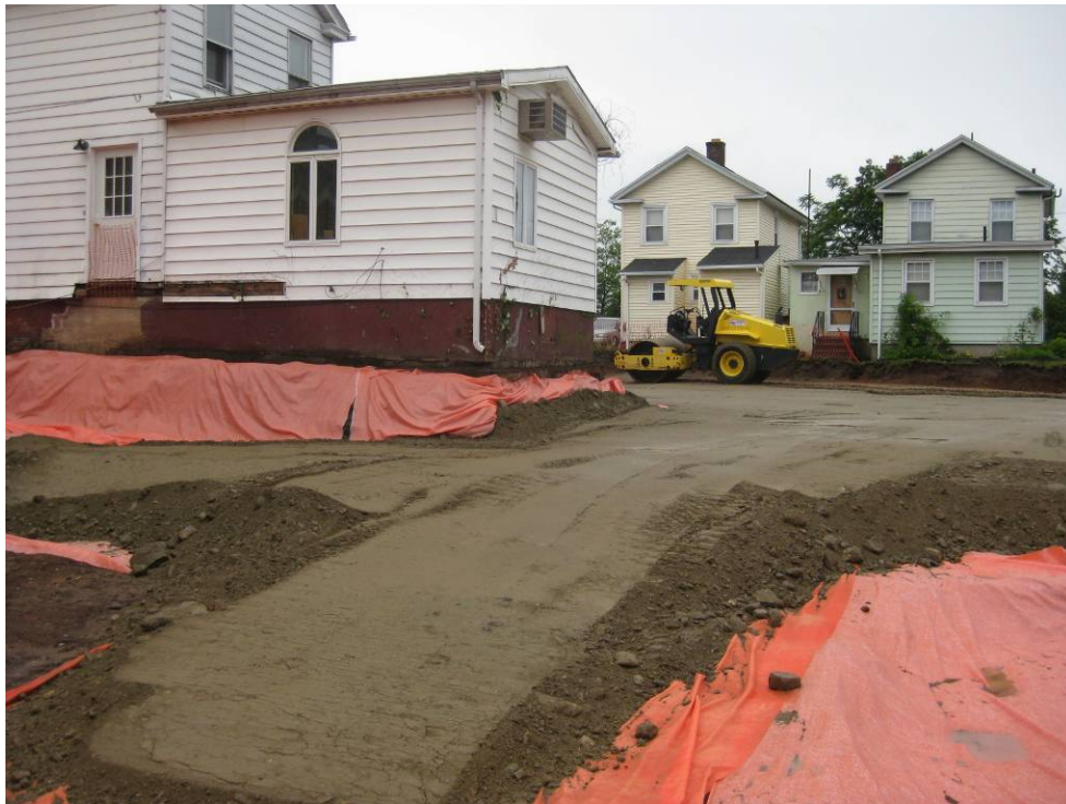
View looking West at partially backfilled back yard following placement of marker barrier