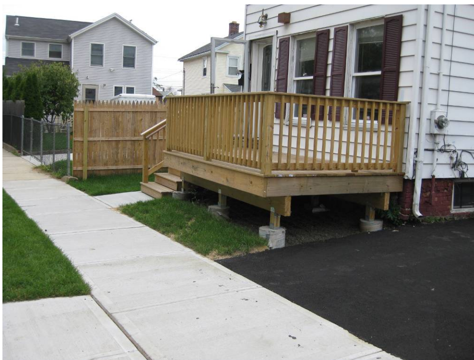
View looking Northwest at restored front yard and newly intalled deck