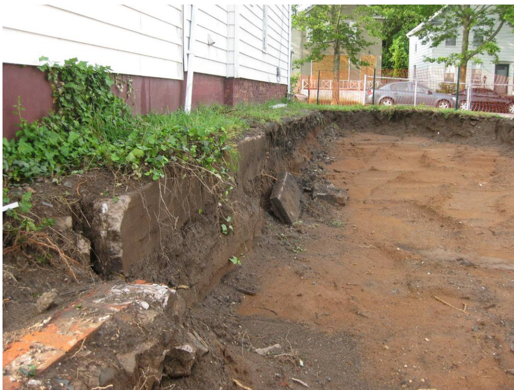
View looking South at excavated side yard to West of building