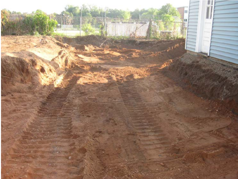
View looking North at excavated back yard