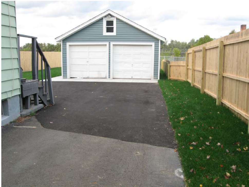
View looking North at restored driveway and fencing