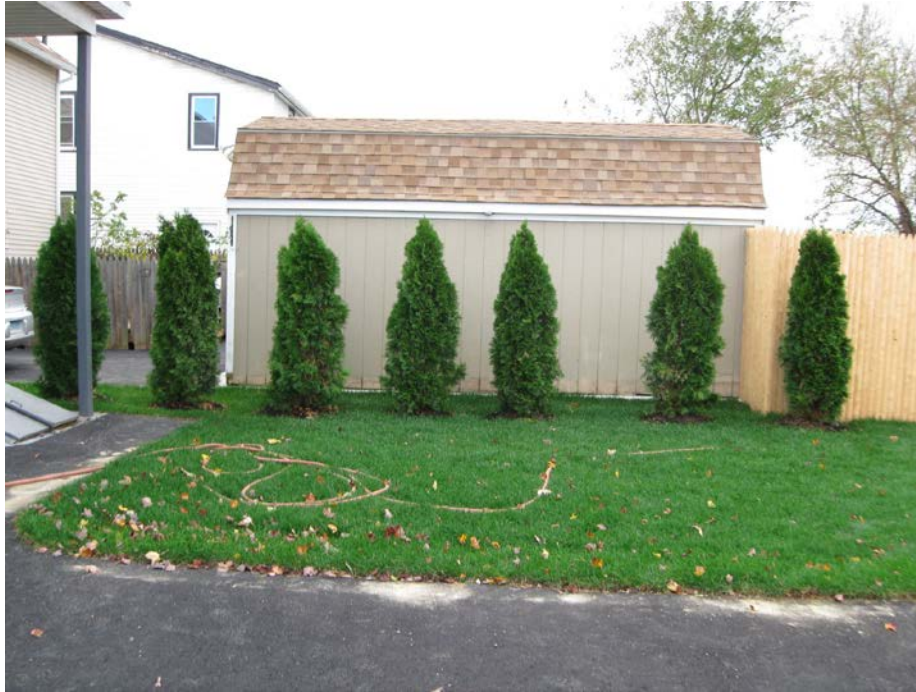
View looking West at restored lawn and bushes