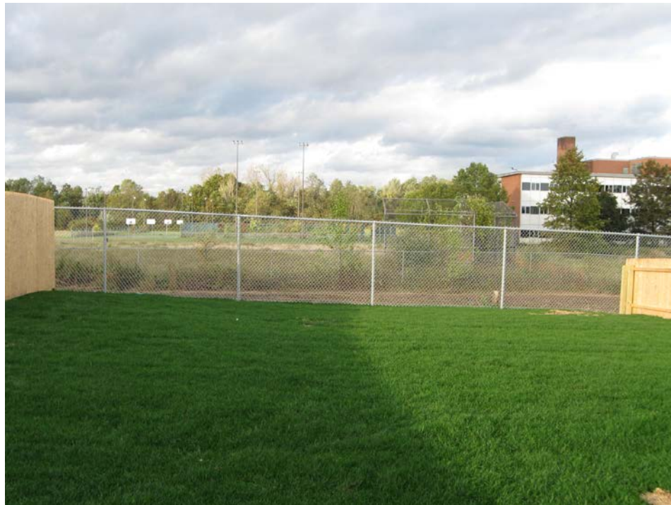
View looking North at restored back yard