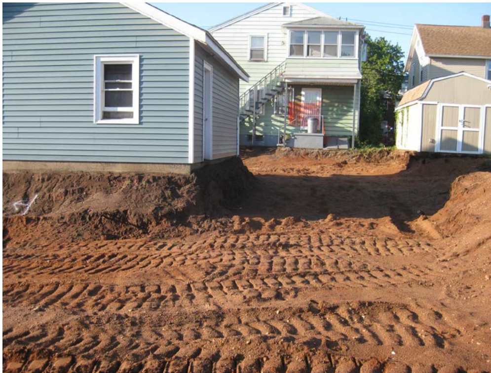
View looking South at excavated back yard