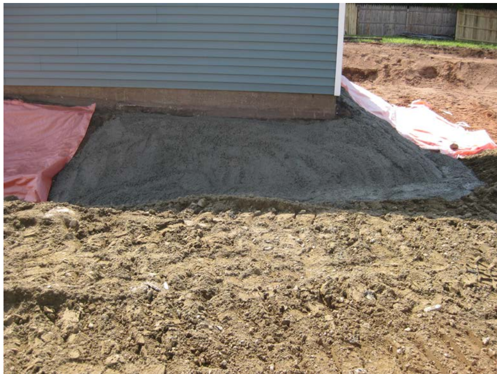
View looking West at concrete and marker barrier along garage