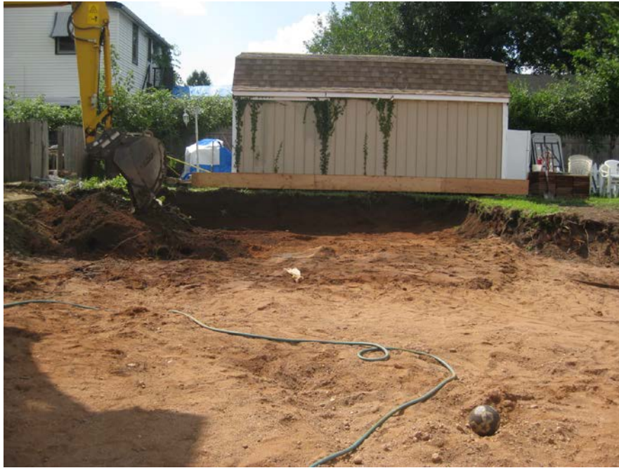
View looking West at excavation of back yard