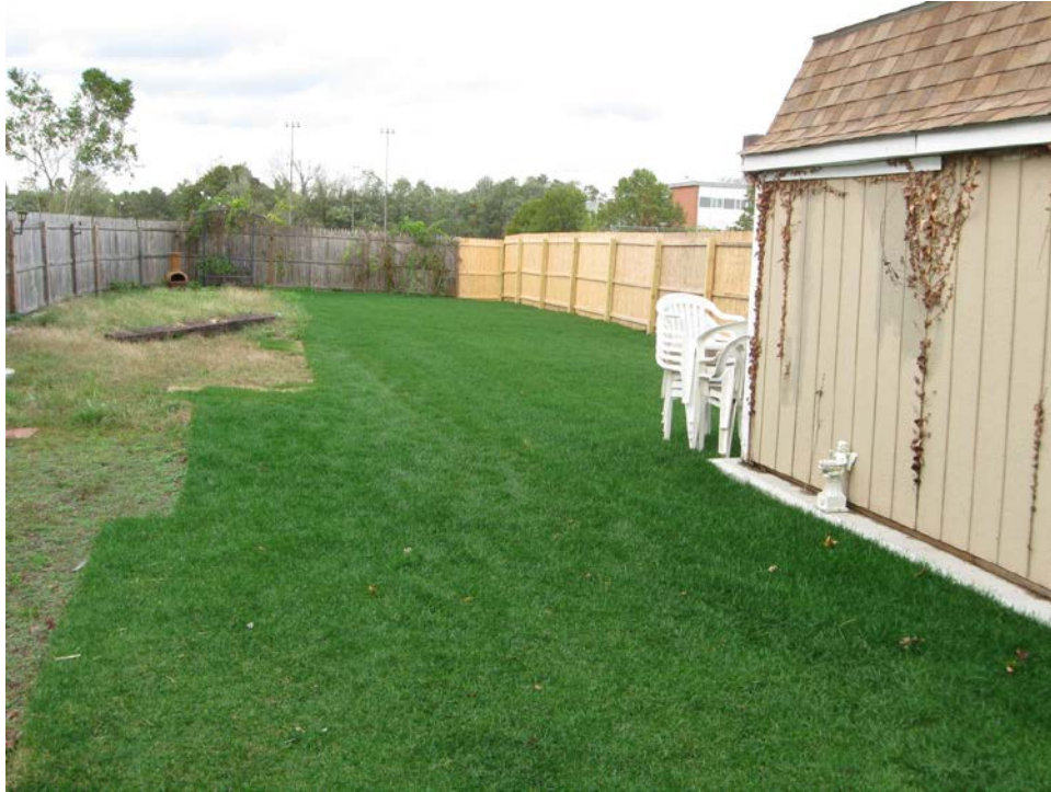
View looking North at restored back yard