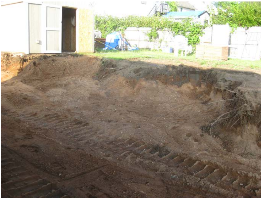
View looking Southwest at excavation area in back yard