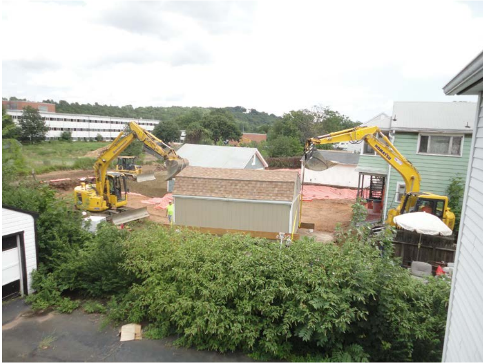
View looking East at excavation area and shed being moved