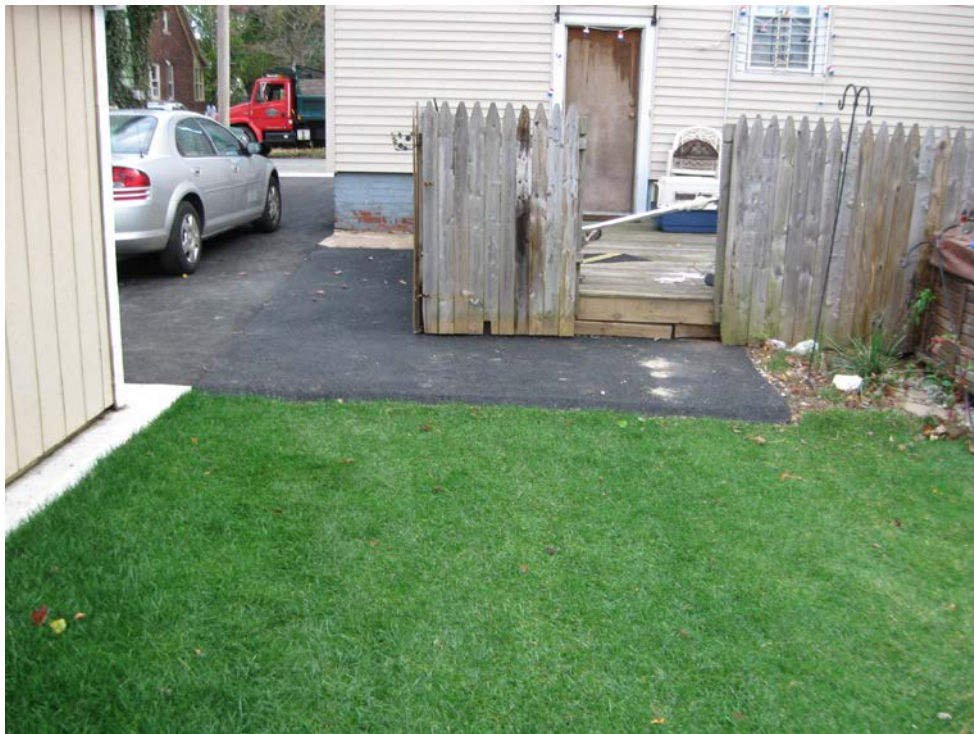
View looking South at restored driveway