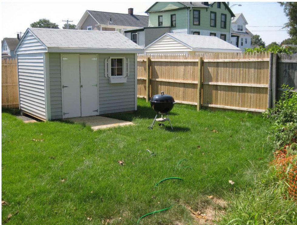
View looking Southwest at restored back yard