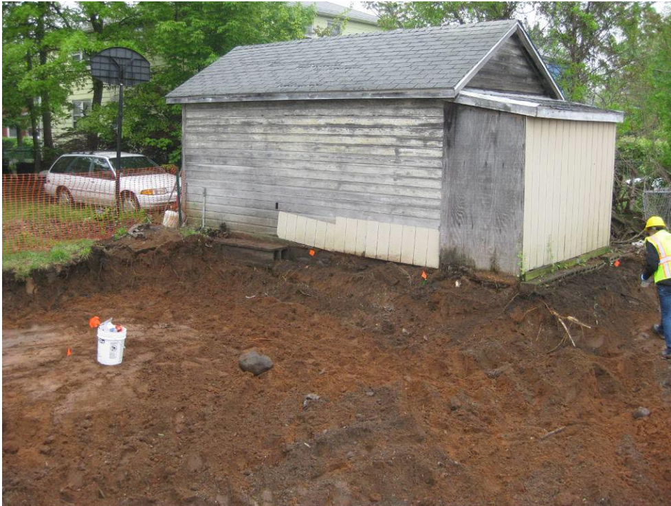
View looking Southeast at excavation area and soil wedge left in place around the garage