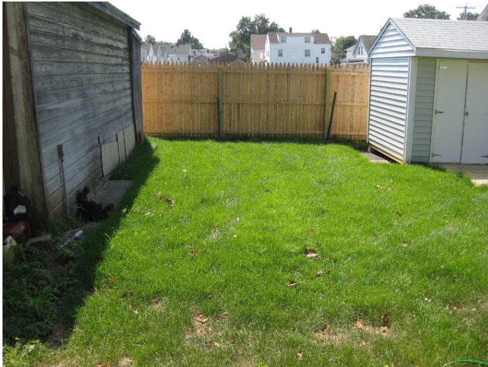
View looking South at restored back yard