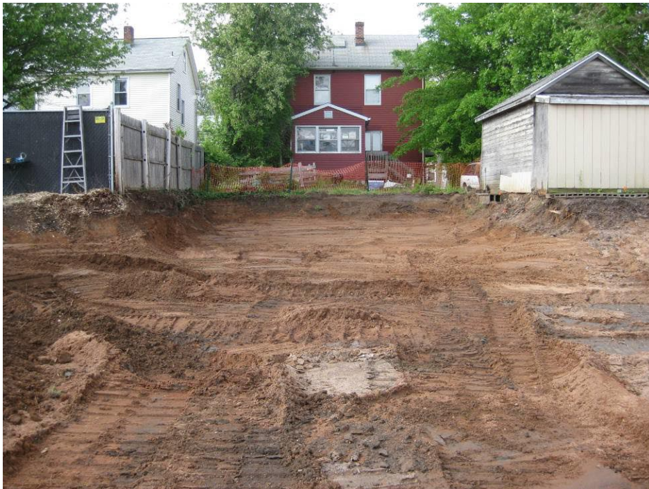
View looking North at extent of excavation on the property