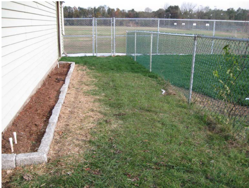
View looking North at restored back yard