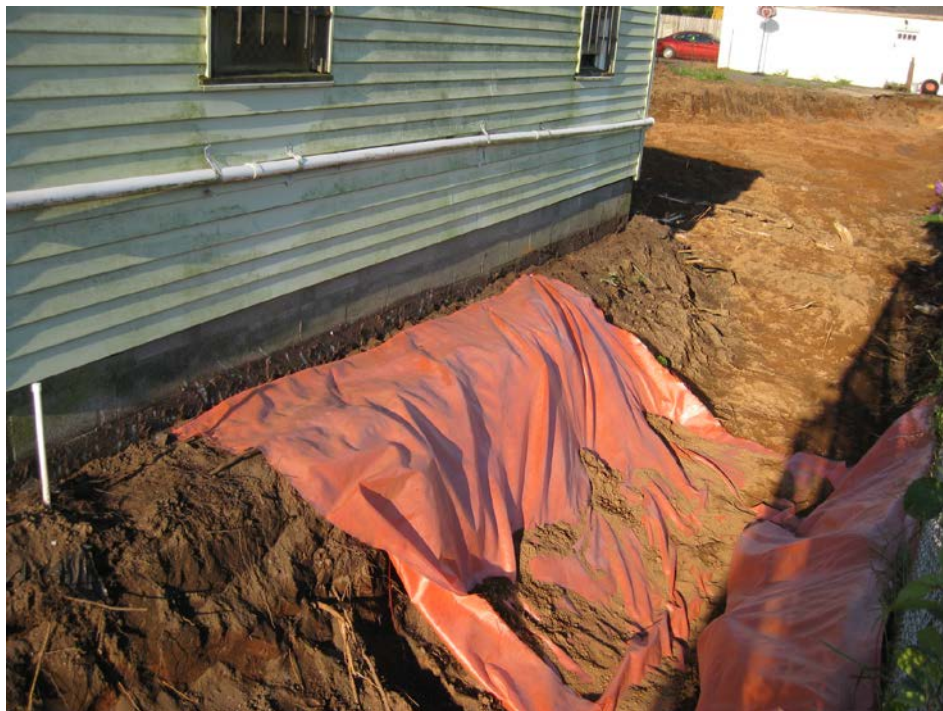
View looking West at marker barrier behind garage