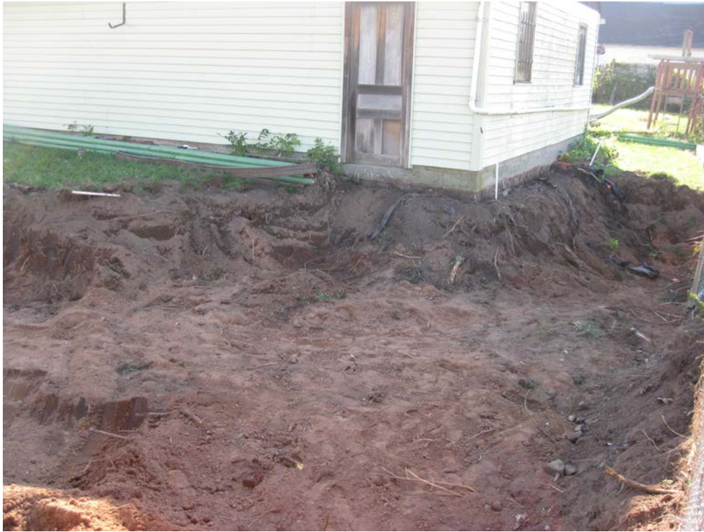
View looking West at excavation of back yard