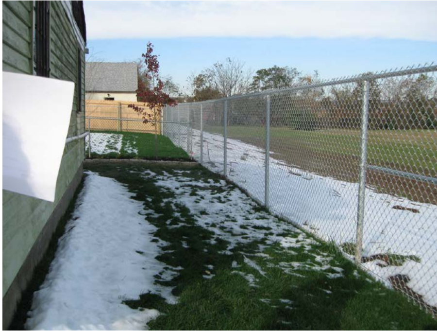
View looking West at restored yard behind garage