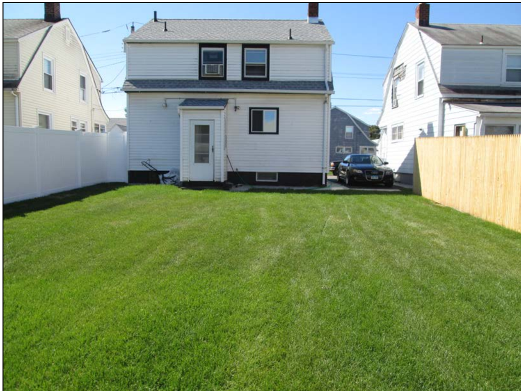
View looking south at restored back yard.