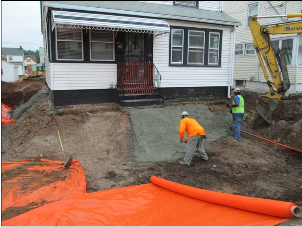
View looking north at excavated front yard.