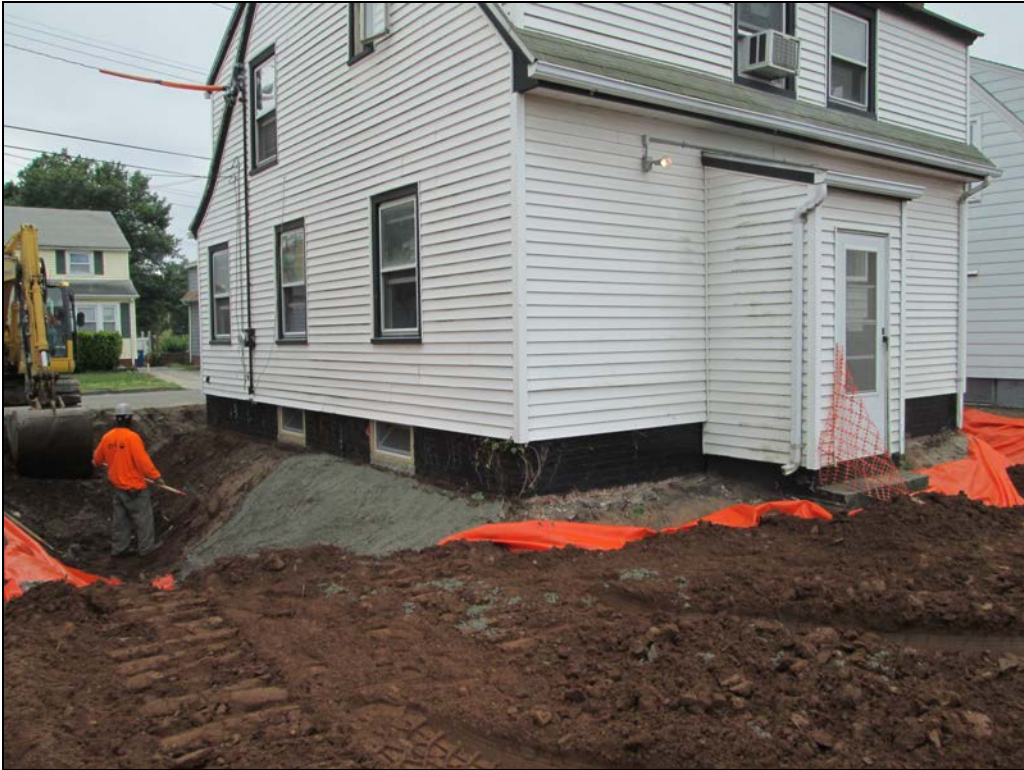
View looking southwest at partially backfilled side yard with marker barrier.