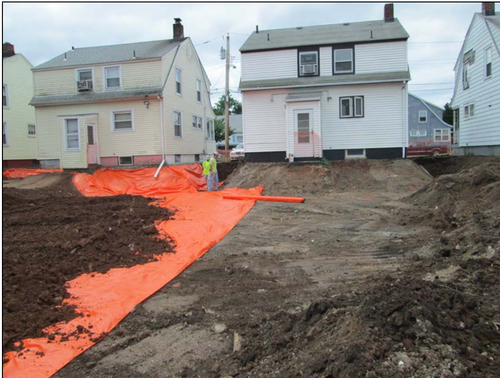
View looking south at excavated back yard during placement of marker barrier.