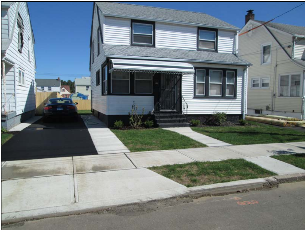
View looking north at restored front yard.