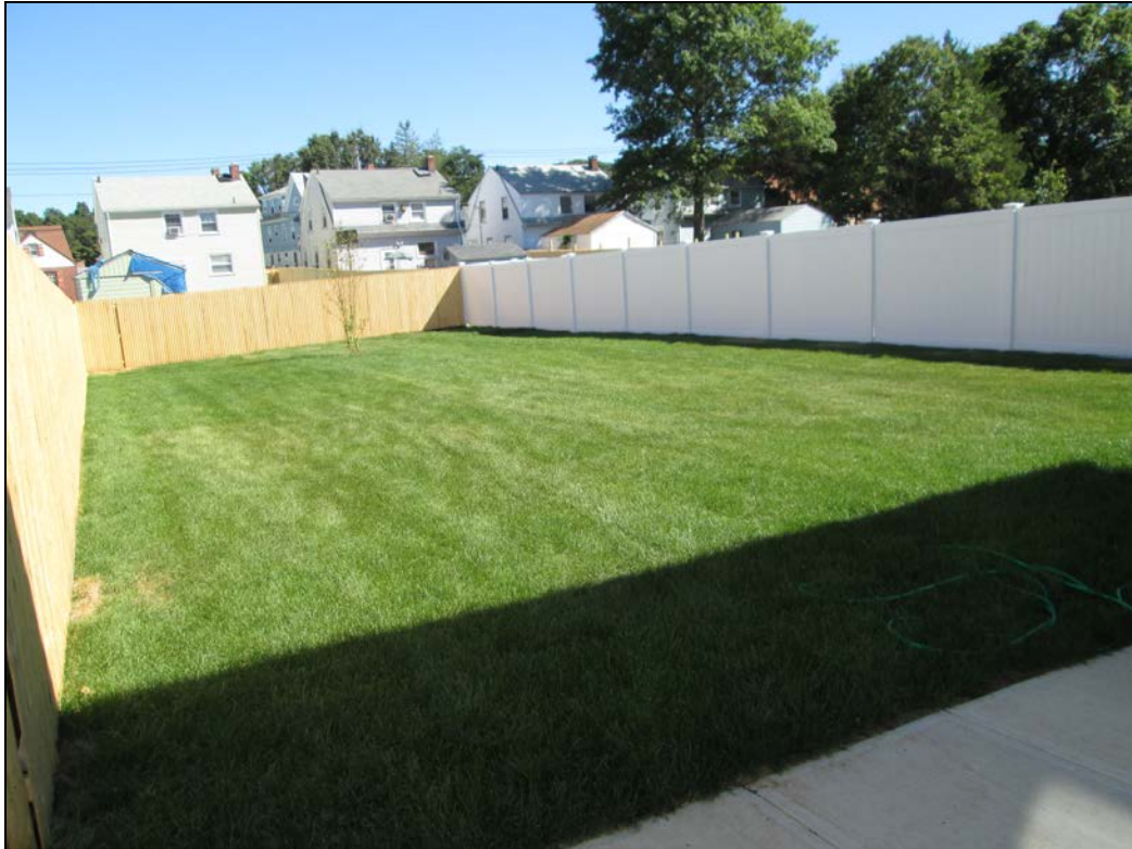
View looking north at restored back yard.