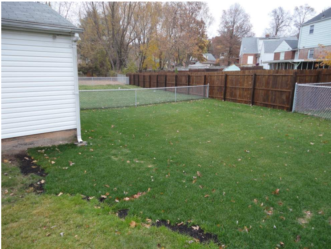
View looking northeast from back yard showing restored property.