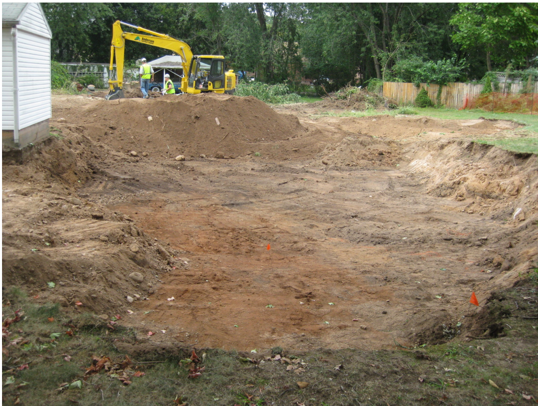
Looking west from backyard, view of excavation immediately prior to placement of marker barrier.