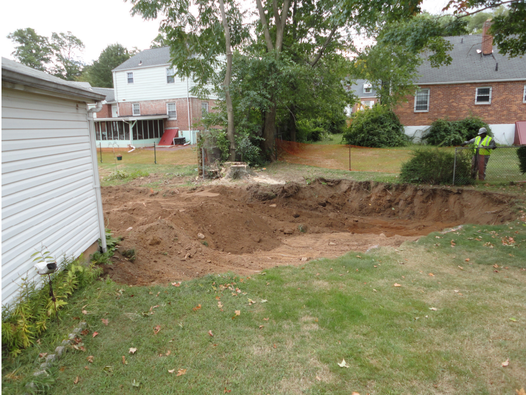
View looking east from back yard as excavation activities begin.