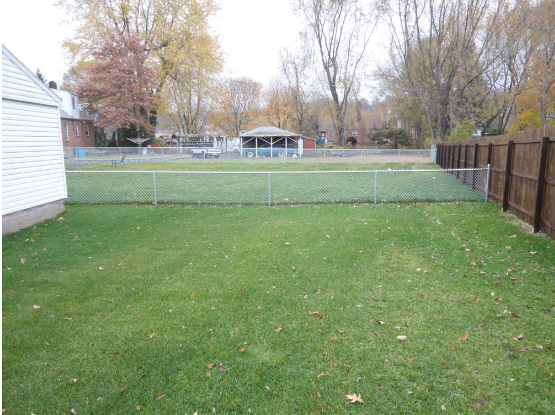
View looking north from back yard showing restored property.