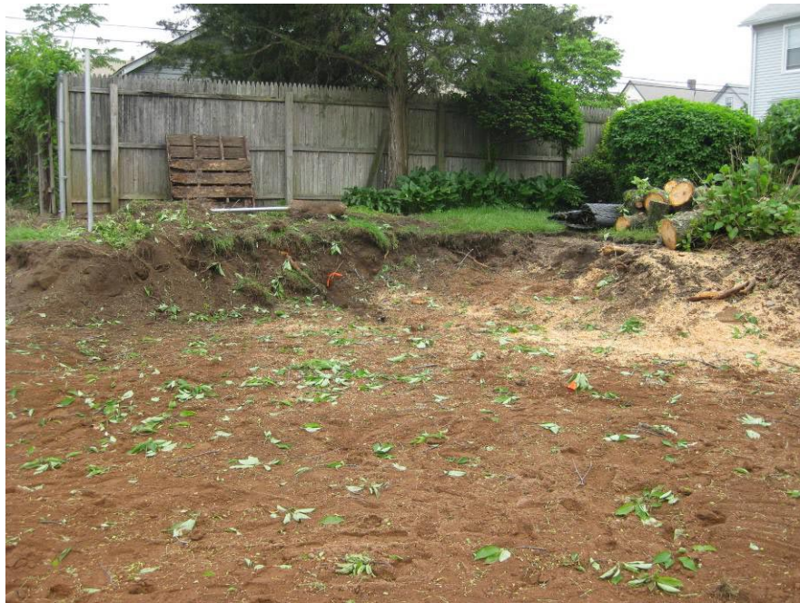
View looking Northwest at limits of excavation on the property