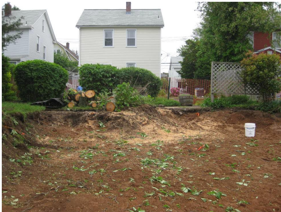
View looking North at excavated back yard