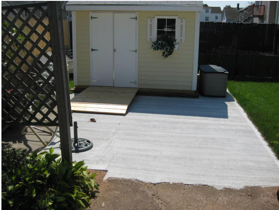
View looking South at restored features