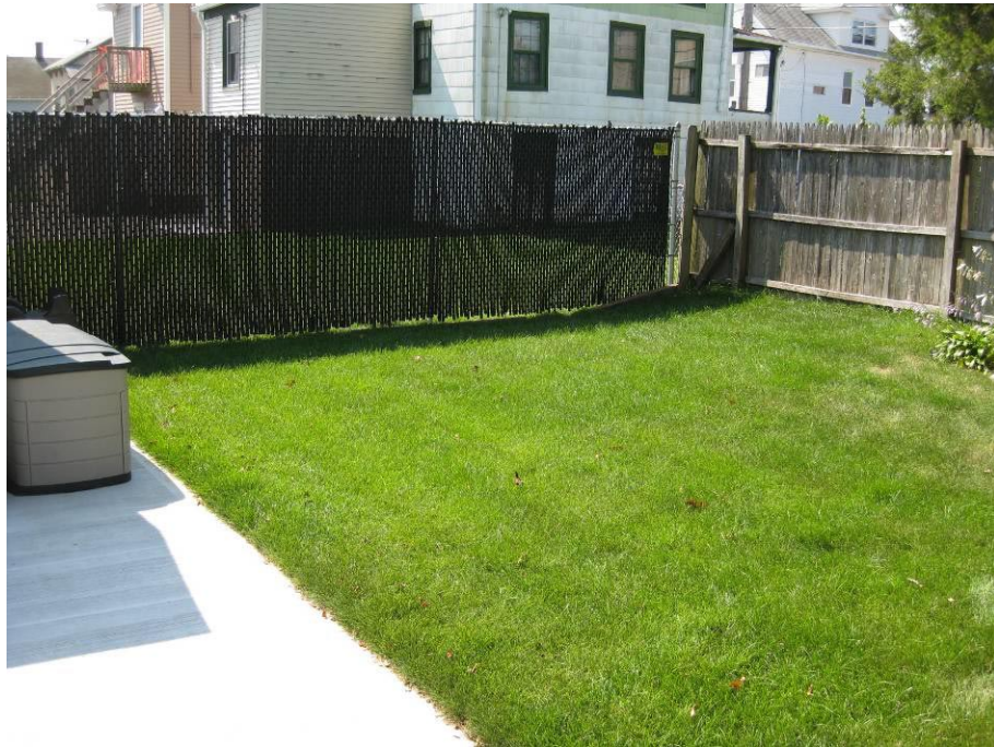
View looking Southeast at partially restored back yard